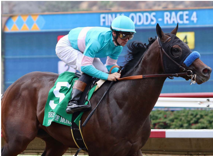
Prince of Monaco

The GI Breeders' Cup Juvenile is the last Grade I dirt race for 2-year-olds of the year in North America and also the ultimate predictor of who will be crowned champion 2-year-old male. From 39 previous runnings, the connections of the winner of this race didn't collect the Eclipse Award trophy just eight times and