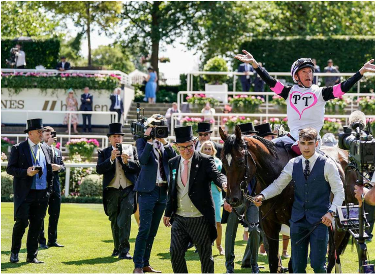
Porta Fortuna and connections at Royal Ascot