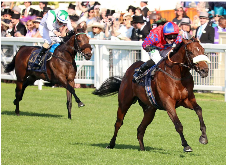
Big Evs (foreground)