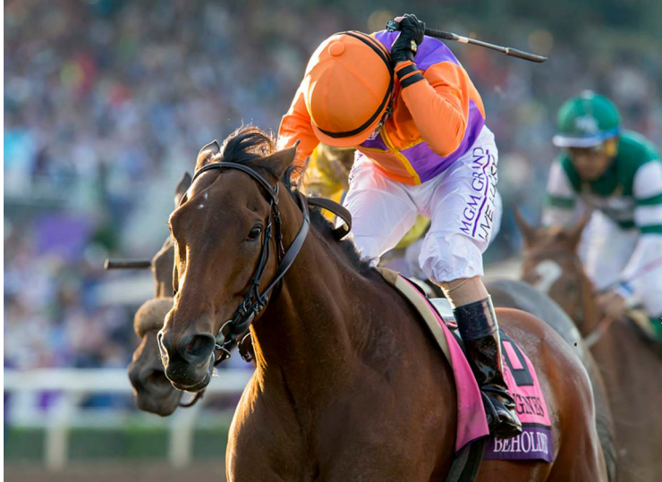
Beholder | Benoit

“We try to keep it simple,” Reyes said. “It can get very complicated if you start looking for ways to do it differently. People have been doing this for 100 years. They say the good things don't change.”