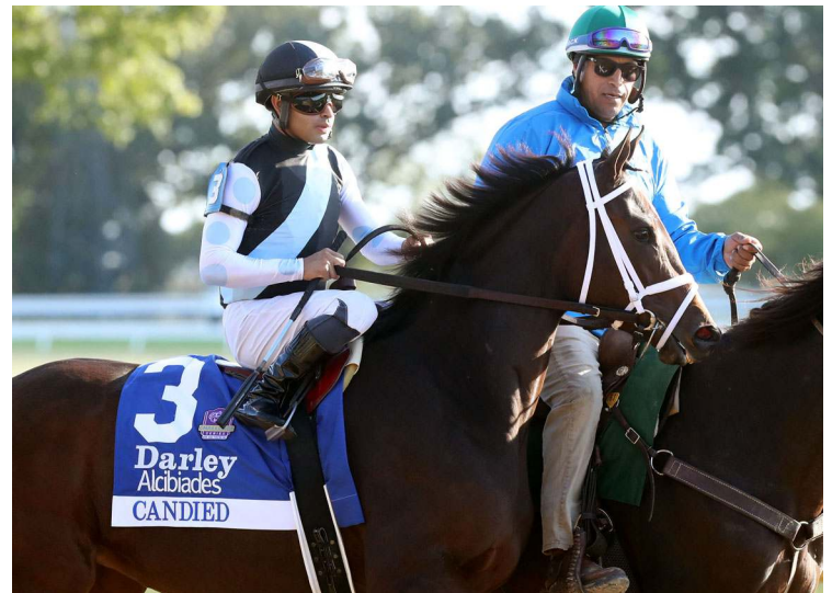
Candied

Chatalas (Gun Runner) is coming off a win in the GI Chandelier S. over this track, which is also her home track. Her only poor performance was a flat fourth-place finish behind Tamara in the Del Mar Debutante, but she clearly rebounded well and will certainly be up on the engine if not setting the pace entirely.