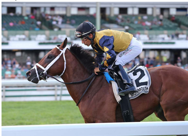
No Nay Mets