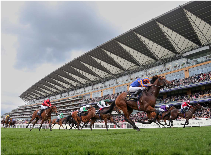
River Tiber at Royal Ascot