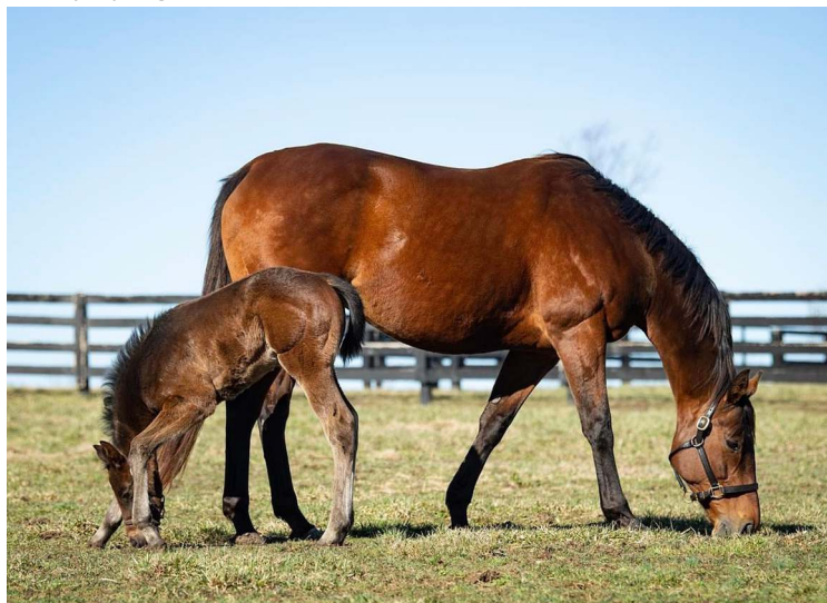
Tamara as a foal with Beholder

ARCADIA, CA – As the unbeaten Tamara (Bolt d'Oro) looks to emulate her legendary dam Beholder (Henny Hughes) with a win in the GI Breeders' Cup Juvenile Fillies, the duo have something else in common that you won't be able to find in Friday's program at Santa Anita.