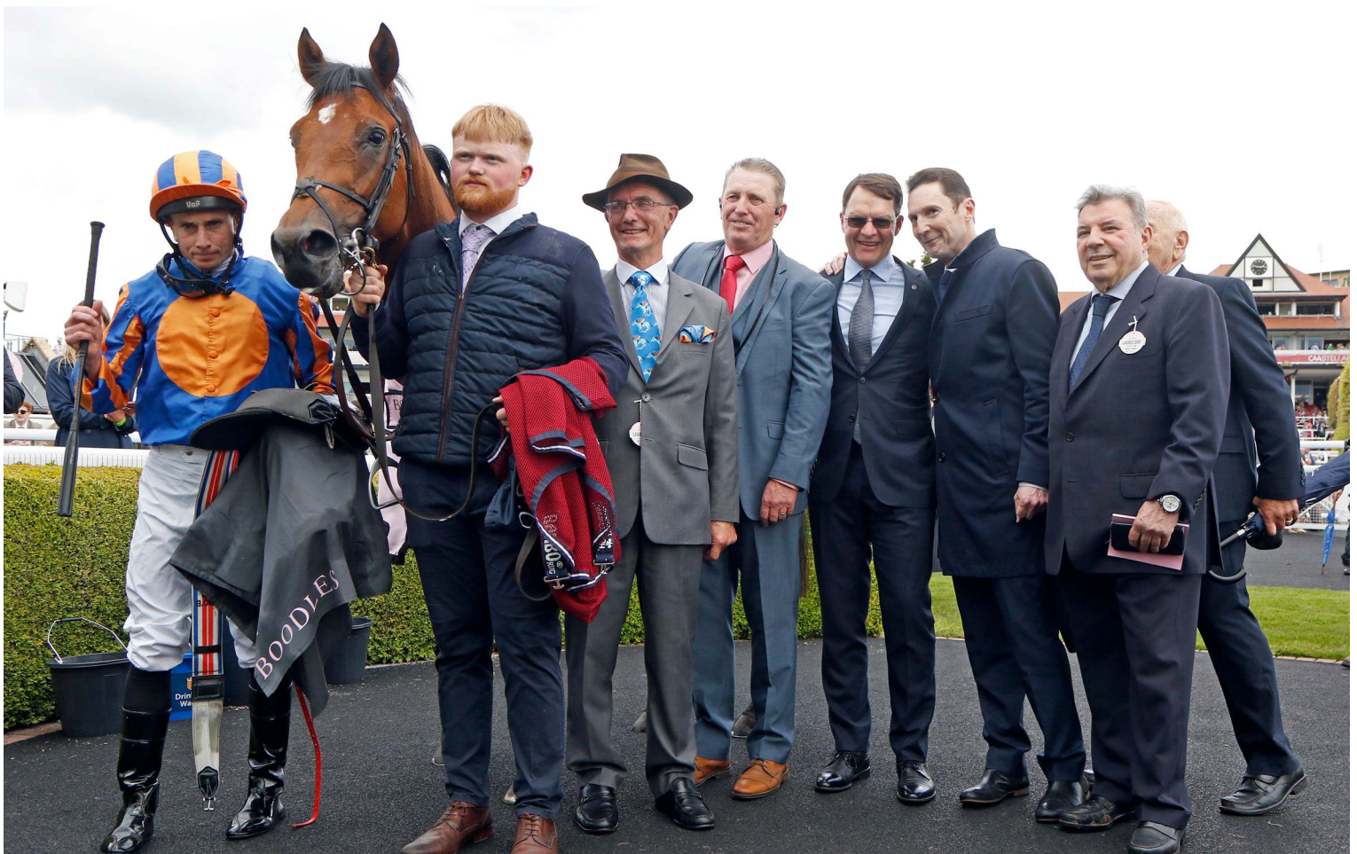
San Antonio would be a first Derby winner for Dubawi.

This year's lone representative by the late sire is Artistic Star.