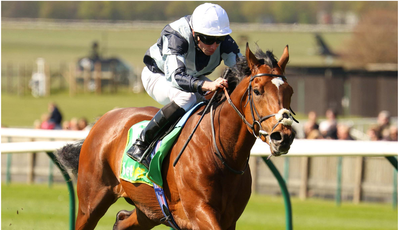
The supplemented Passenger is attempting to emulate Kris Kin, who became the first supplementary entry to win the Derby in 2003. Connections stumped up £90,000 to enter the son of Kris S. 20 years ago.

150 years ago (1873): Doncaster, sire of the great Bend Or, wins on just his second start having finished unplaced on debut in the 2000 Guineas.