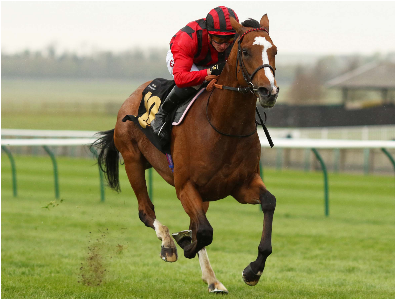
Waipiro is one of two colts by 2014 Derby hero Australia entered in the Derby.