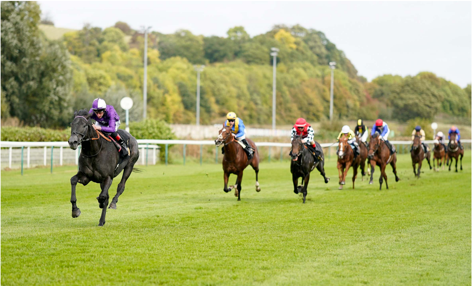
Colossal grey King Of Steel winning at Nottingham last autumn

VERDICT: Huge odds for each-way bettors.