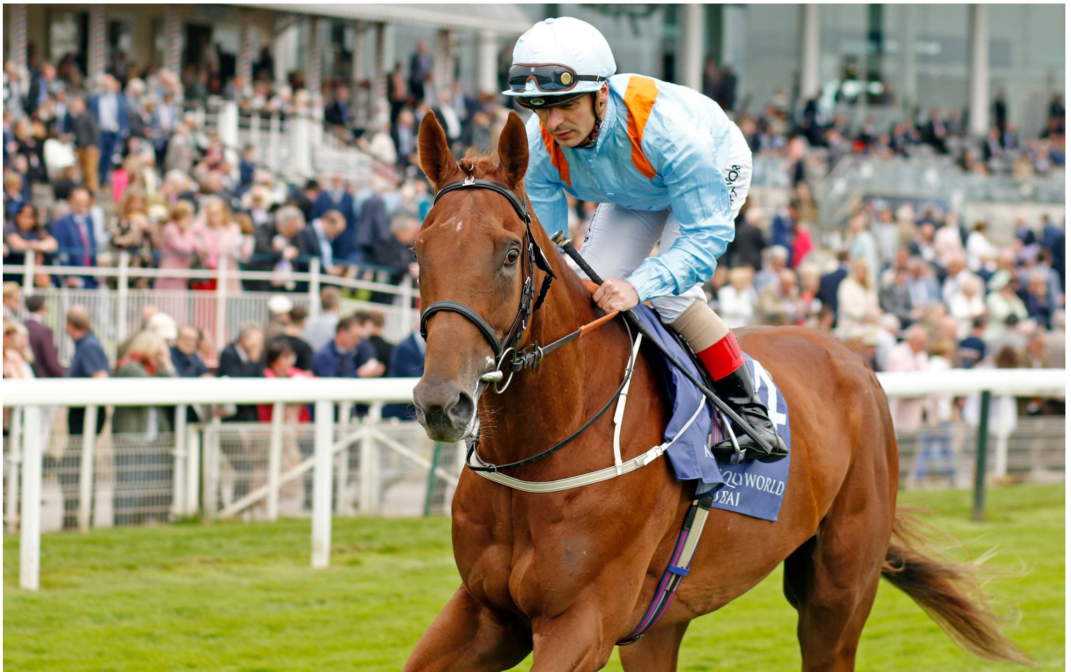
Dear My Friend is the first Derby runner for Middleham Park Racing.