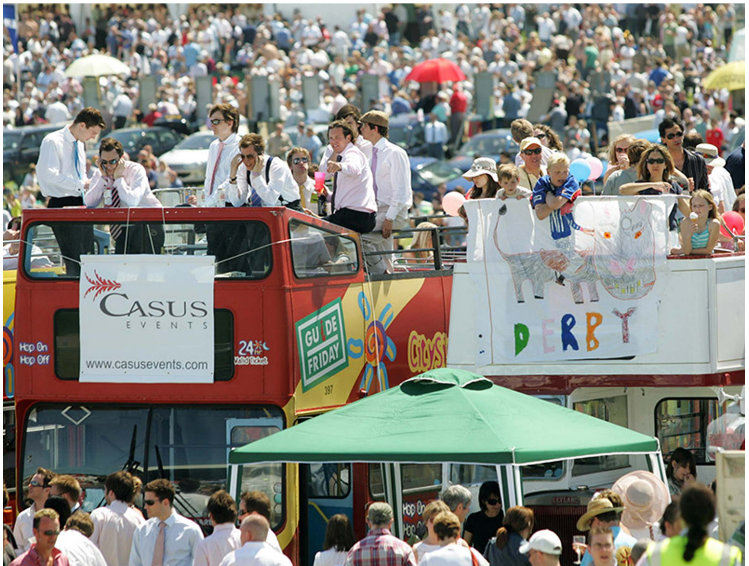
The Derby has appealed to the masses for centuries.

VERDICT: Improving colt who should see out the trip but the ground has to be a major worry.