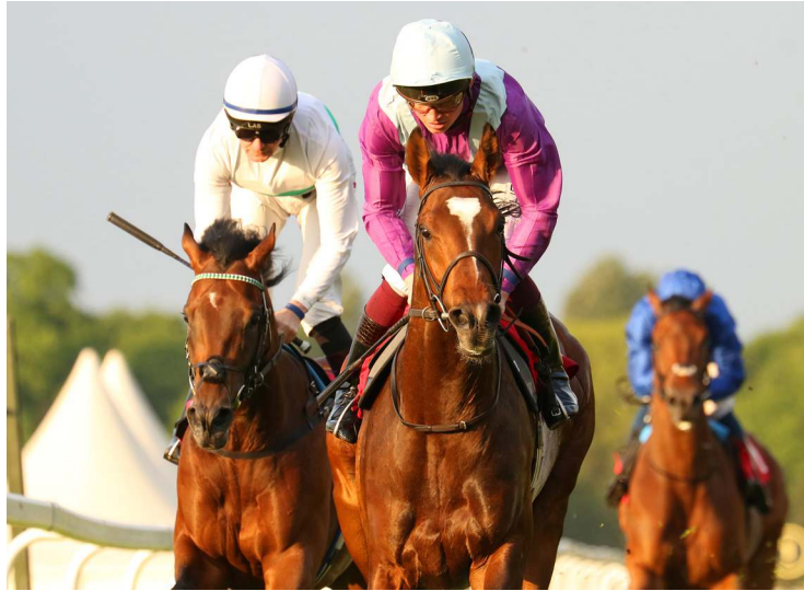
Artistic Star