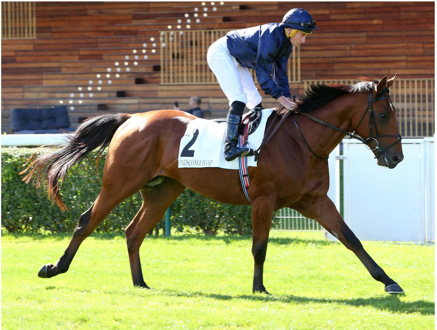
Adelaide River holds good form behind Dubai Mile and Arrest.

VERDICT: Experience has taught us never to overlook long-priced runners from this stable but he does need to take a big step forward to be threatening in this company.