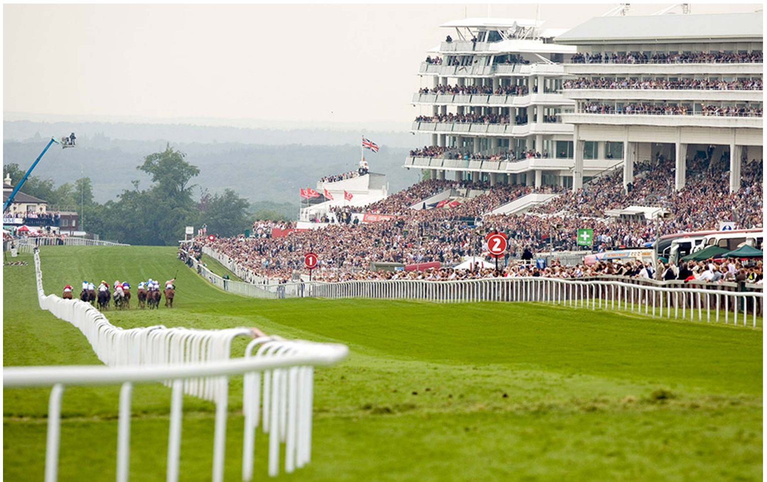
The home straight at Epsom viewed from Tattenham Corner

PEDIGREE: Artistic Star is one of his dam's five foals and four winners by lamented icon Galileo, who has sired a record five winners of the Blue Riband.