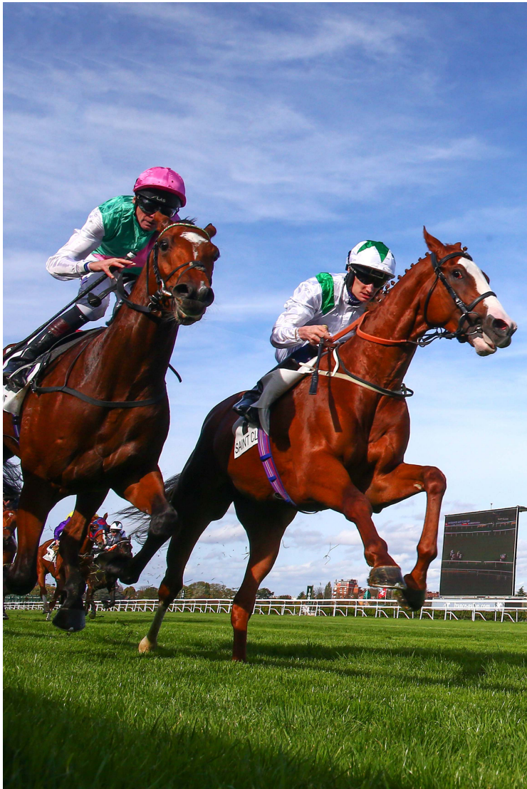
Dubai Mile (right) defeats Arrest in the Criterium de Saint-Cloud. The duo square off again in the Blue Riband on Saturday.