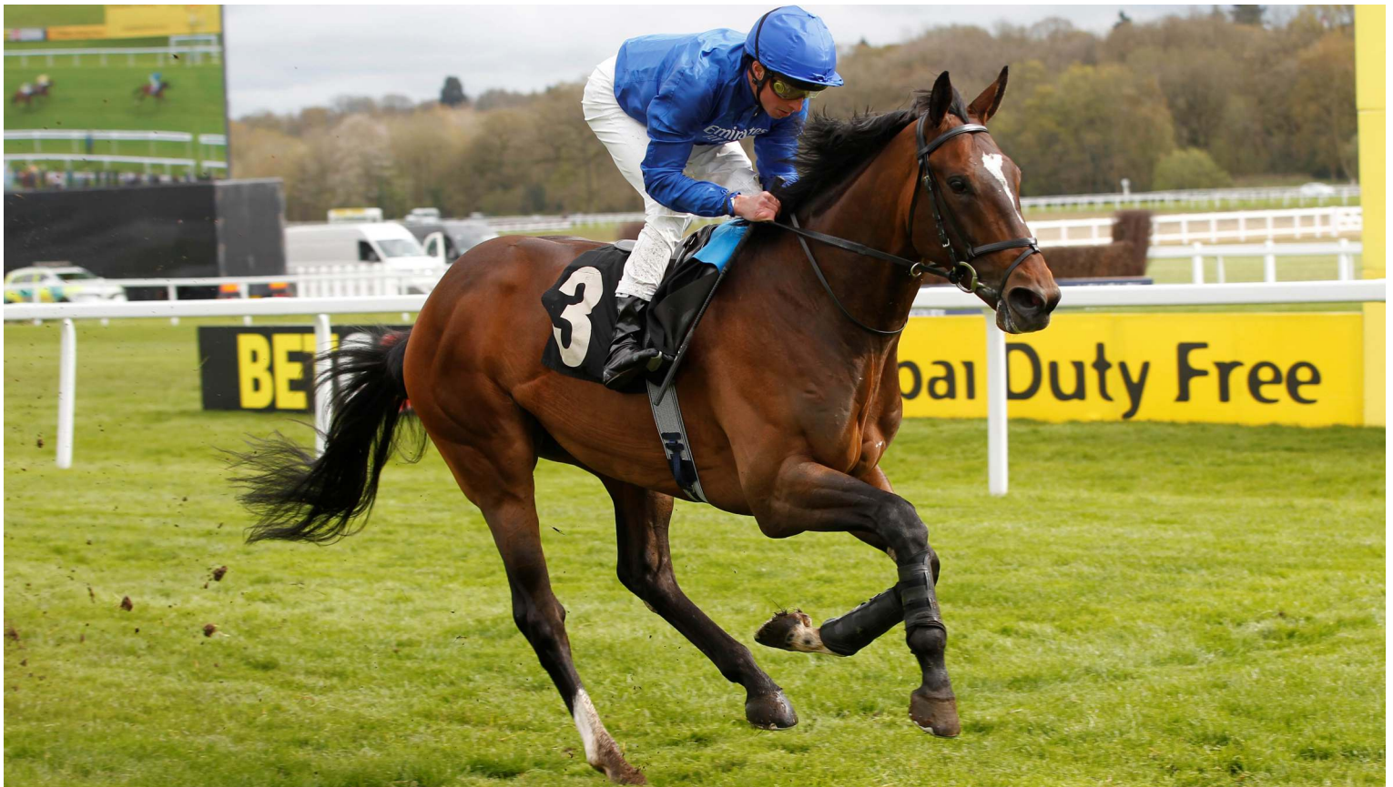
Military Order is a full-brother to 2021 Derby winner Adayar