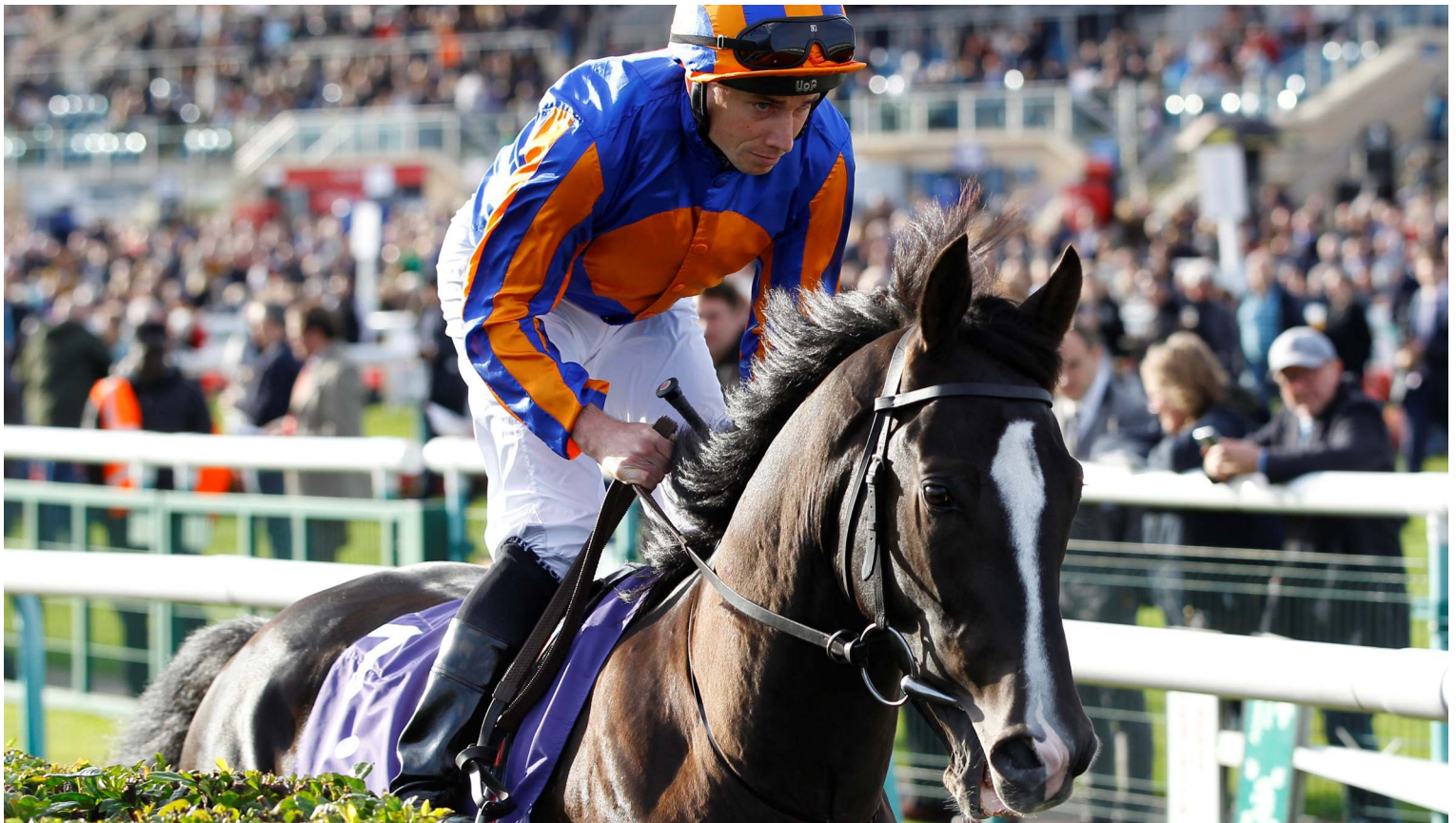
Auguste Rodin

This year's representative is Bright Diamond.