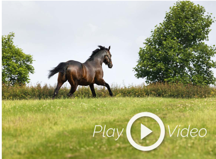
Click the photo above to watch our video on Too Darn Hot and his transatlantic appeal