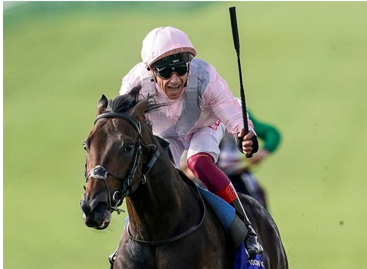
Too Darn Hot: all alone at the uphill finish of the Dewhurst

in Europe. So you can't do better than that. It's up to the horse then himself to see if he can do it."