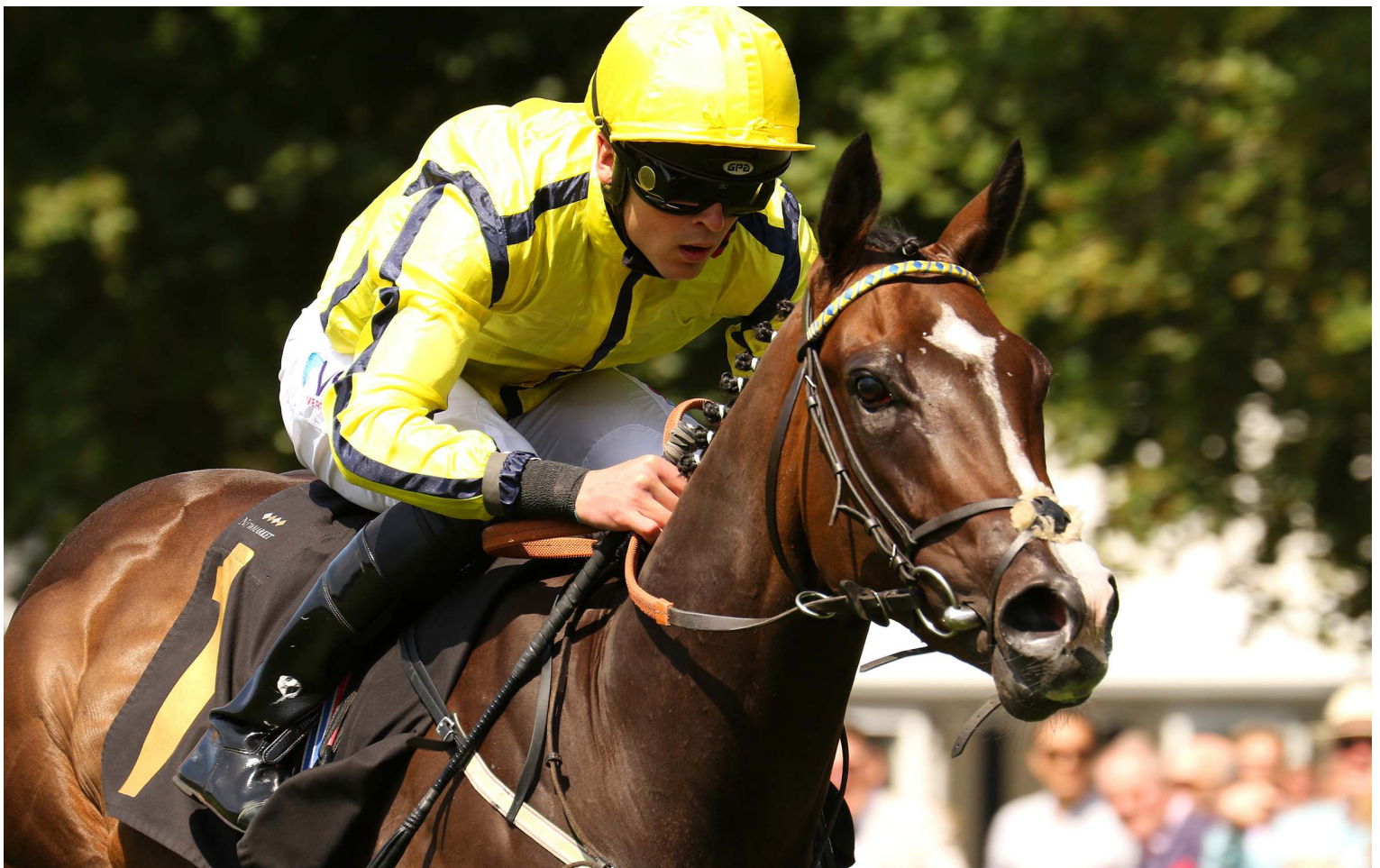
Bright Diamond rolls to victory at Newmarket on Saturday. She is her sire's second 'TDN Rising Star'.