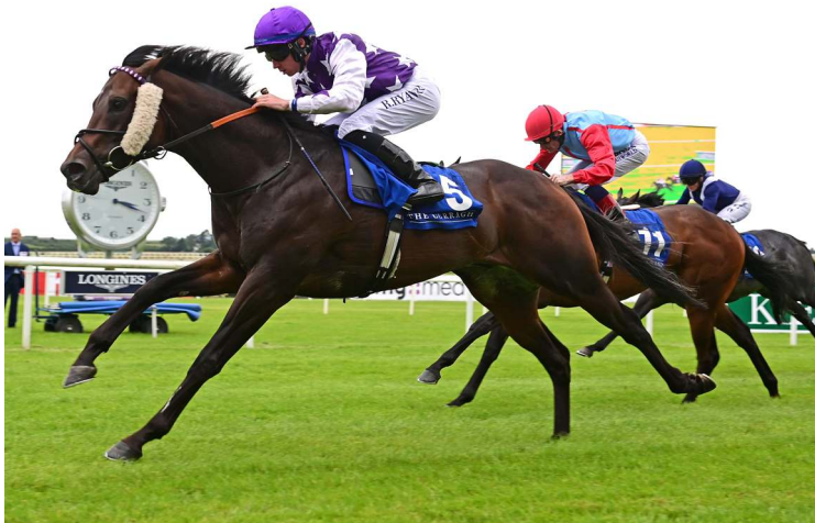
Go Bears Go

"He disappointed in Royal Ascot, but just got out of the wrong side of the bed, overheated and didn't run his race. I'd love to