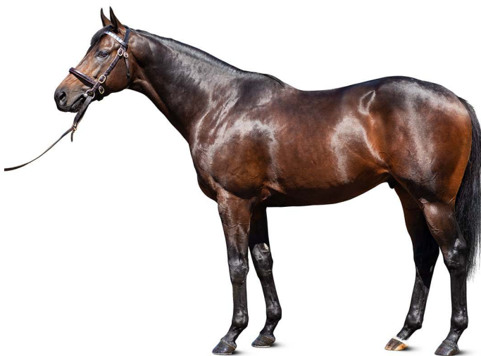
Dubawi's heir apparent? Too Darn Hot at Darley | Darley