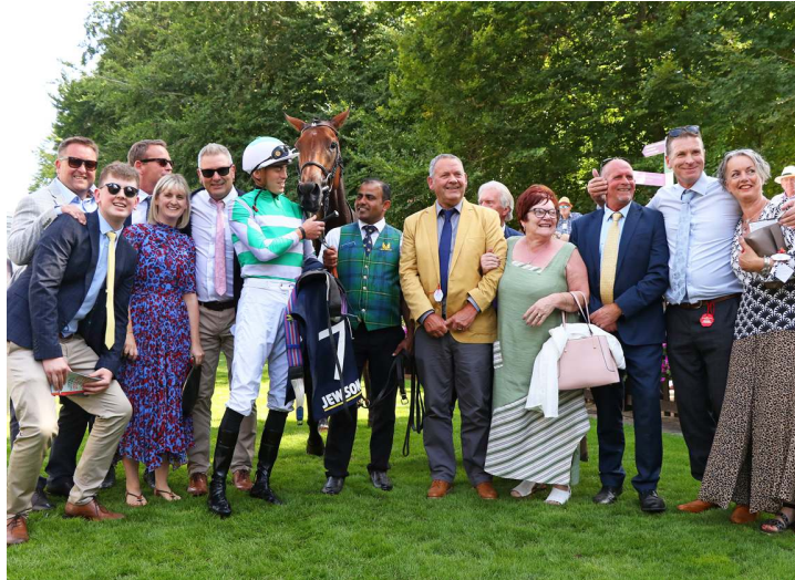
Lakota Sioux and her winning connections

Gallop Racing's 2-year-old distaffer Lakota Sioux (Ire) (Sioux Nation--Shemiyla {Fr} {GSW-Fr, $169,373}, by Dalakhani {Ire}) bounced back off a third in Royal Ascot's Listed Chesham S. to secure a career high in Saturday's G3 Jewson Sweet Solera S. at Newmarket, becoming the second black-type winner for her freshman sire (by Scat Daddy). She had earlier debuted with a May 20 third at Haydock before plundering a May 30 Lingfield maiden by 6 1/2 lengths in her penultimate start. The 10-3 second favourite was swiftly into stride and raced in a prominent third through the early fractions of this pattern-race bow. Cruising to the front in the centre of the track approaching the quarter-mile marker, she was driven along at the foot of the hill and kept on strongly under