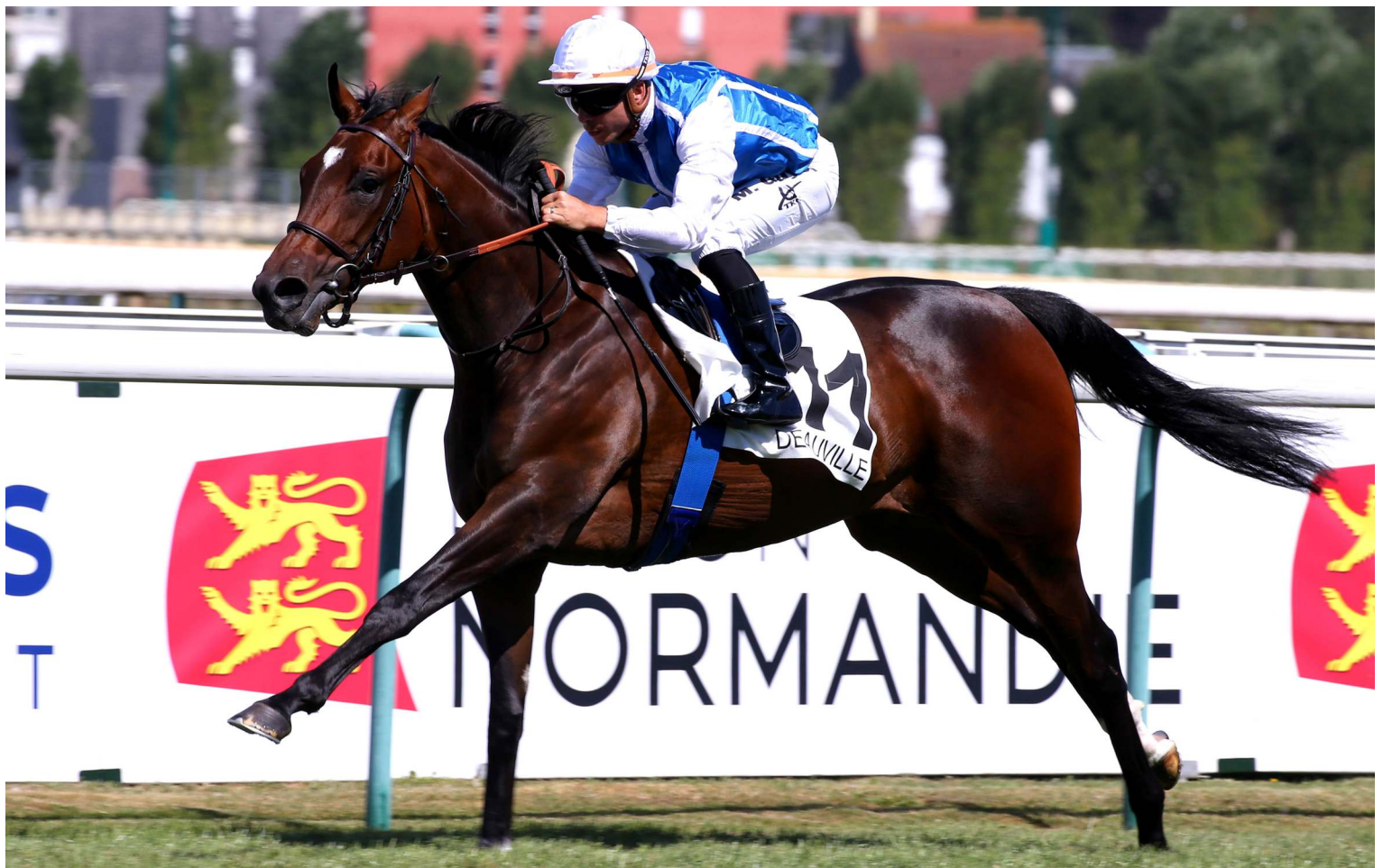
Kelina broke her maiden at first asking on Saturday. She is the 32nd 'Rising Star' for her Juddmonte sire.

Alain and Gerard Wertheimer’s hitherto unraced 2-year-old filly Kelina (Ire) (Frankel {GB}--Incahoots {GB}, by Oasis Dream {GB}) was let go at odds of 29-5 for Saturday’s Prix des Marettes at Deauville and returned home with a ‘ TDN Rising Star ’ tag after posting a taking pillar-to-post performance in the 7 1/2-furlong debutantes’ heat. The eventual winner was the sharpest of one dozen into stride and seized an immediate lead. Holding sway throughout, she was shaken up when threatened passing the quarter-mile marker and ran on strongly once quickening clear approaching the eighth pole to easily outclass Shalromy (Fr) (Shalaa {Ire}) by an impressive three lengths. Cont. p14