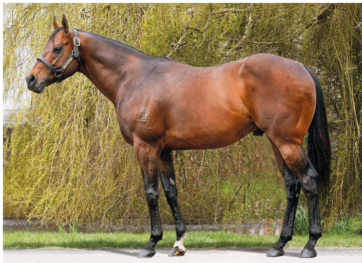
Zoustar has a runner at Haydock | Tweenhills

Zoustar (Aus) (Northern Meteor {Aus}), Tweenhills Stud 107 foals of racing age/4 winners/1 black-type winner 16:15-HAYDOCK PARK, 6f, Zoology (GB) 90,000gns Tattersalls December Foal Sale 2020