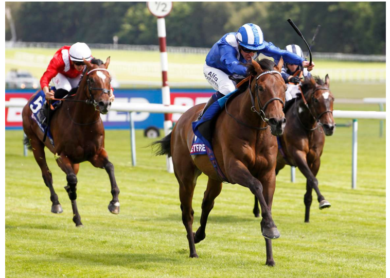
Anmaat