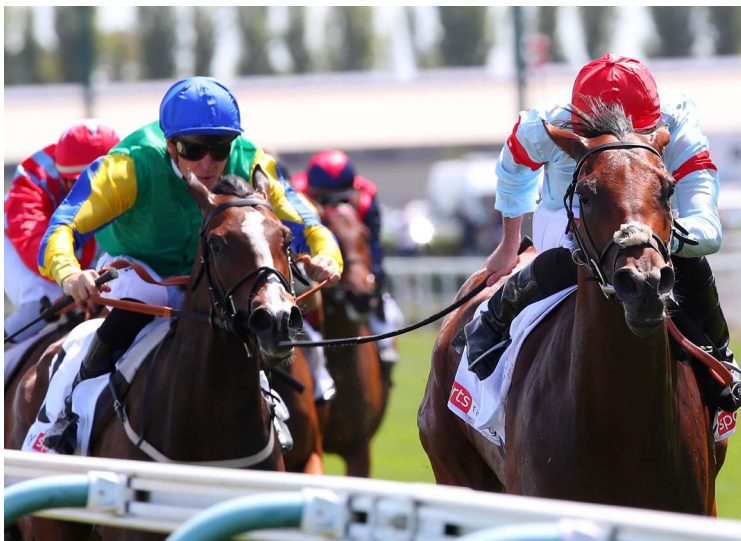
Sioux Nation's Sydneyarms Chelsea