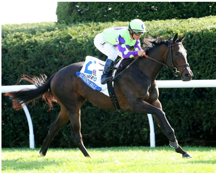
Rushing Fall en route to victory in the GIII Jessamine S. at Keeneland