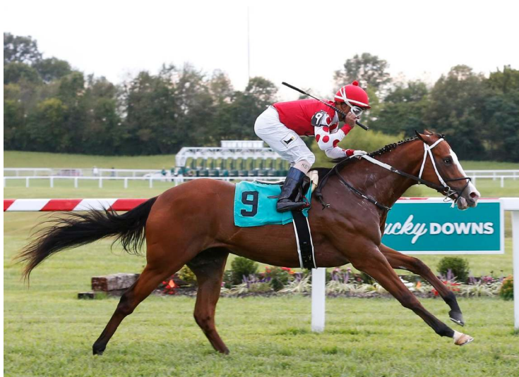
Snapper Sinclair | Kentucky Downs