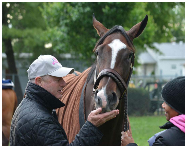
Paradise Woods

'TDN Rising Star' Paradise Woods (Union Rags), who has had an up-and-down season, faded badly after setting the pace as the favorite in the Kentucky Oaks and was sidelined for nearly four months. Heavily favored in her return to the races, she stumbled at the start and came home only sixth in the Aug. 27 GIII Torrey Pines S., her only start at Del Mar. She comes into the Distaff off a resounding front-running victory in the Sept. 30 GI Zenyatta S. at Santa Anita and could benefit from a Distaff field which seems to be lacking in pace.