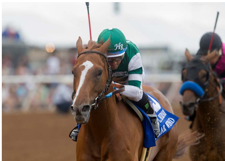
Stellar Wind

Stellar Wind (Curlin) gets her third chance at a Breeders' Cup title as she looks to cap an unbeaten season in Friday's Distaff before going through the sales ring at Keeneland Tuesday. The chestnut mare missed catching Stopchargingmaria (Tale of the Cat) by a neck when second in the 2015 Distaff. She beat the mighty Beholder (Henny Hughes) twice before finishing fourth