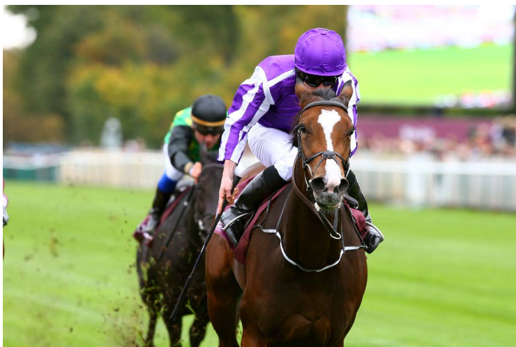
Happily leading home a lethal Aidan O'Brien/Coolmore trifecta in the G1 Prix Jean-Luc Lagardere.