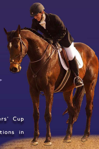
Romp - 2010 & 2012 Breeders' Cup Marathon contender. Adopted through New Vocations in April 2014.