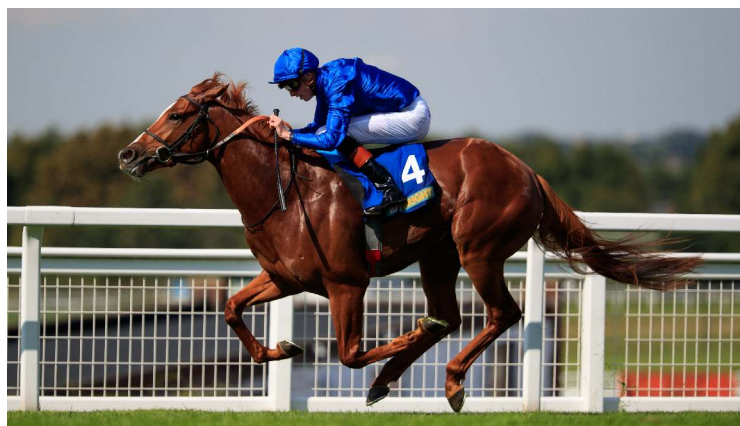
Masar

Given some time to mature after that--which he certainly seemed to need--the beautifully moving chestnut returned a convincing winner of Sandown's G3 Solario S. Sept. 2. He chased a strong pace before fading to third last time in the G1 Prix Jean-Luc Lagardere at Chantilly Oct. 1, but he seemed to be spinning his wheels over the soft ground and figures to relish the firmer sod in San Diego.