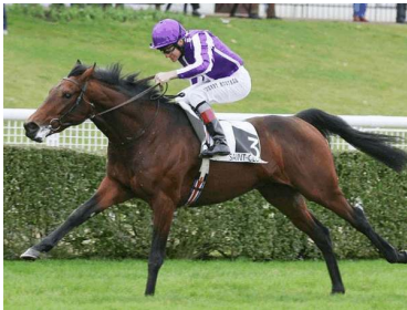
Fame and Glory