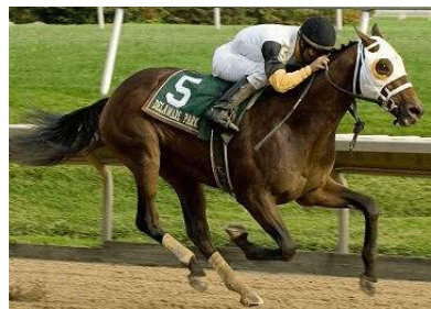
Citrus Kid in command nearing the wire in Delaware's Dover S.

Citrus Kid (Lemon Drop Kid), a $50,000 OBSMAR graduate earlier this year, made it two straight decisive victories to remain unbeaten on dirt when annexing last Saturday's Dover S. at Delaware Park ( video ).