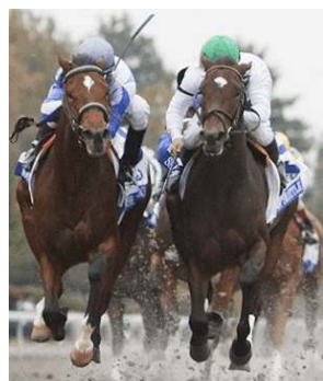
House of Grace (left)