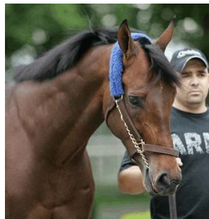
Chocolate Candy