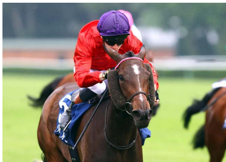
Lapothese