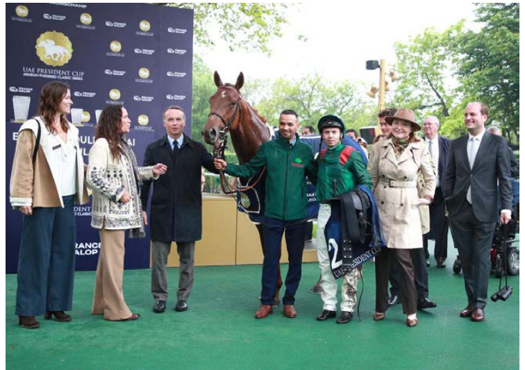
Rayif with winning connections

Rayif debuted with a win at Deauville in July and doubled his tally back there in the following month's G3 Prix Francois Boutin, before hitting the board behind Puerto Rico in this venue's G1 Prix Jean-Luc Lagardere on Arc weekend when last seen.