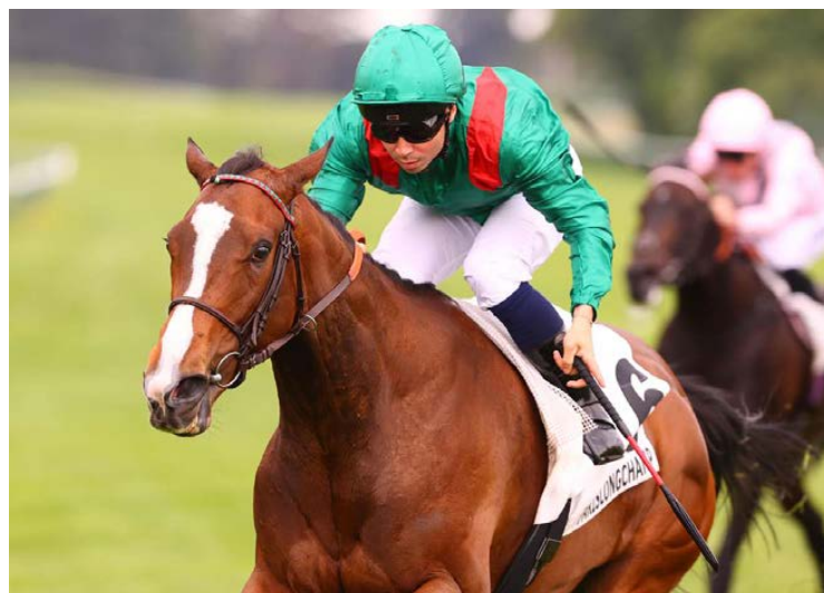
Rayevka