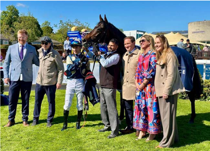
Next stop Epsom for James J Braddock?