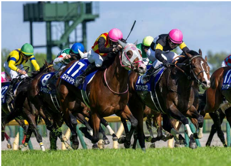
Rodeo Drive (centre)