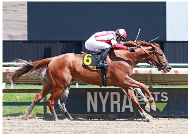
Hedge Ratio