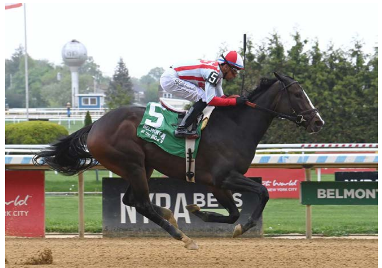
Point of Reference | Coglianese-NYRA

5th-Belmont The Big A, $88,000, Alw (NW1$X)/Opt. Clm ($55,000), 5-10, 3yo/up, f/m, 1m, 1:35.47, ft, 2 3/4 lengths.