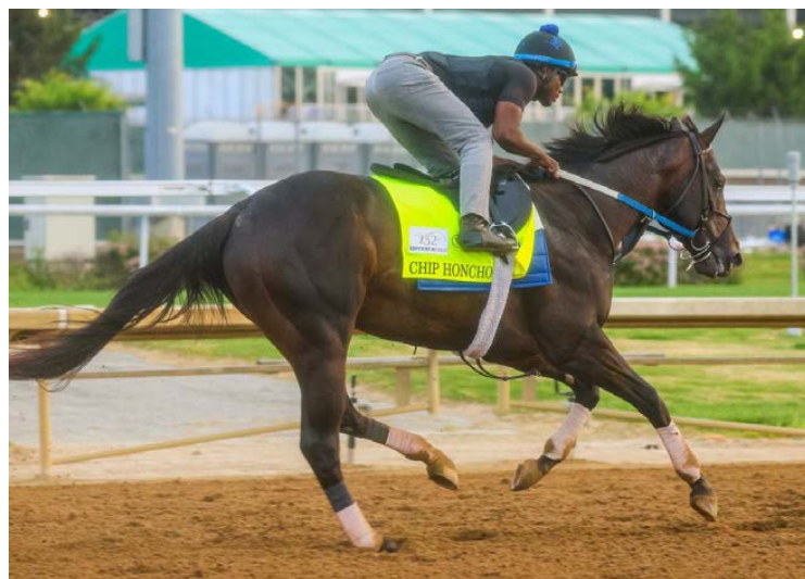
Chip Honcho