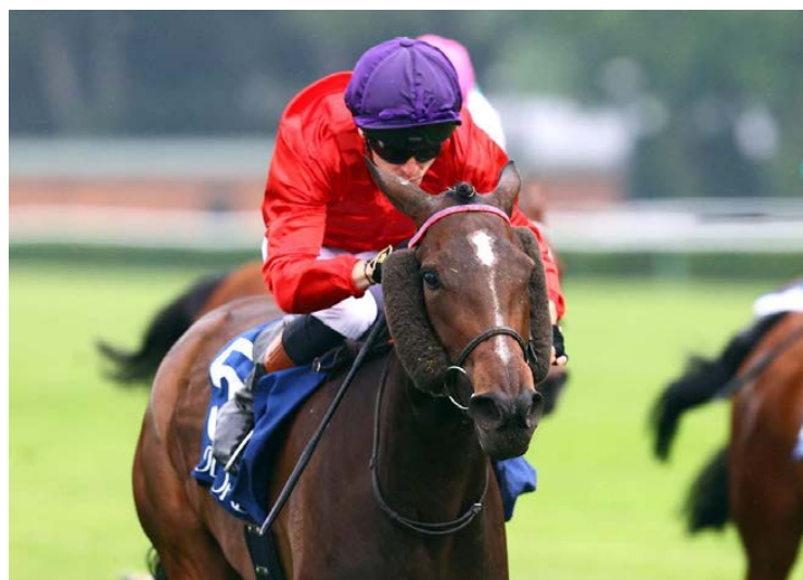
Lapothese

Lapothese is just the latest advert for her remarkable sire, whose loss will be felt for some time to come. The dam Loyale (Turtle Bowl), who had already produced one of his notable progeny and one of the first to fly his flag in the G2 Champions Juvenile Stakes winner Atomic Jones, is a daughter of the important mare Luminosity (Sillery), who hailed from the Wildenstein family of Bigstone et al. Cont. p8