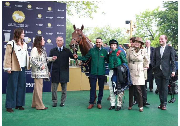
Rayif with winning connections

Rayif debuted with a win at Deauville in July and doubled his tally back there in the following month's G3 Prix Francois Boutin, before hitting the board behind Puerto Rico in this venue's G1 Prix Jean-Luc Lagardere on Arc weekend when last seen.