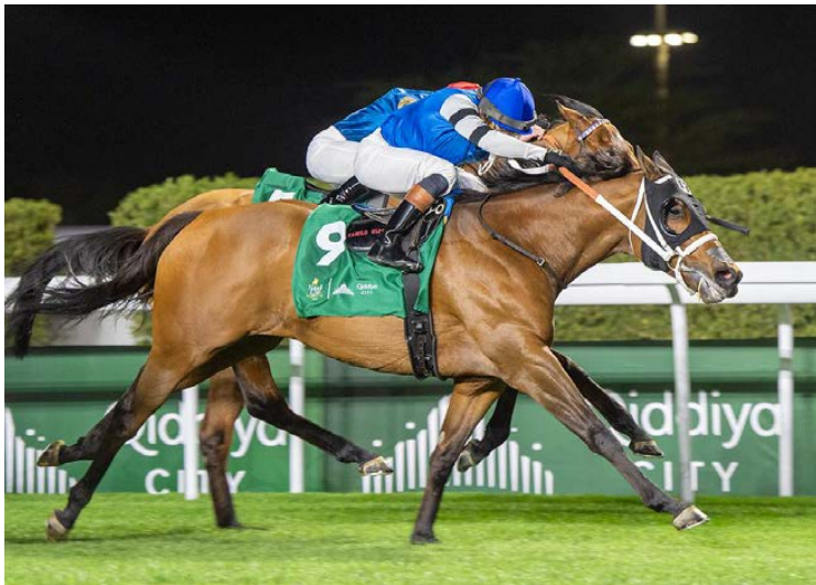
Reef Runner