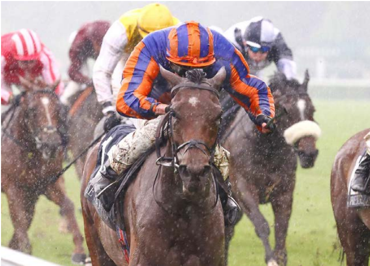
Diamond Necklace | Scoop Dyga