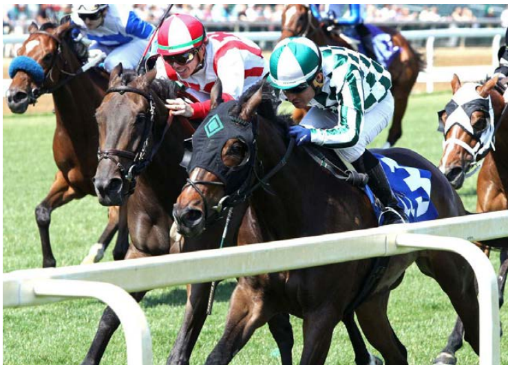
Princess Attitude (inside)