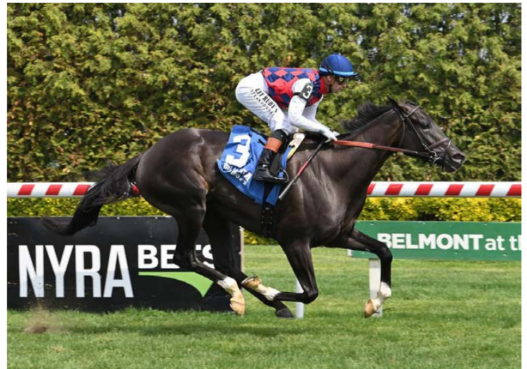
Right Timing

4th-Belmont The Big A, $85,000, Msw, 5-10, 3yo/up, f/m, 1mT, 1:35.79, fm, 4 1/4 lengths.