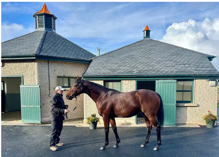
Bayside Boy

Thunder Moon (Ire) (Zoffany {Ire}), Castillon Stallions 52 foals of racing age/1 winner/0 black-type winners 1-NANTES, 1100m, Sydney Moon (Fr)