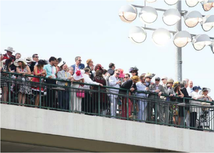
Kentucky Derby crowd