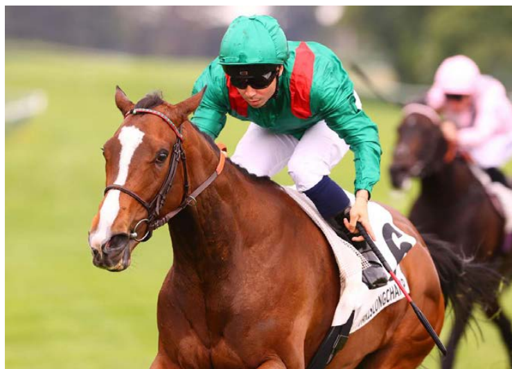
Rayevka