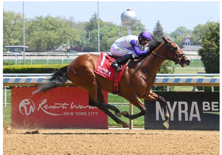
Blue Roof Beau by Beau Liam

3rd-Belmont The Big A, $80,000, (S), Msw, 5-10, 3yo/up, 1m, 1:34.63, ft, 3 1/2 lengths.