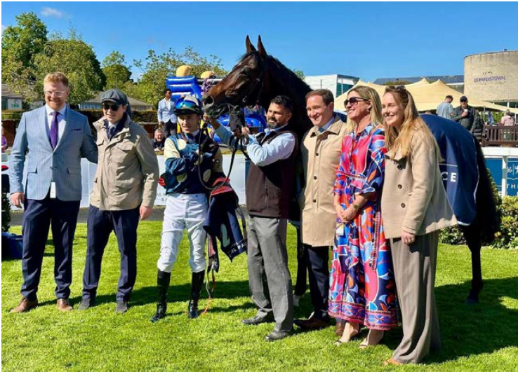
Next stop Epsom for James J Braddock?