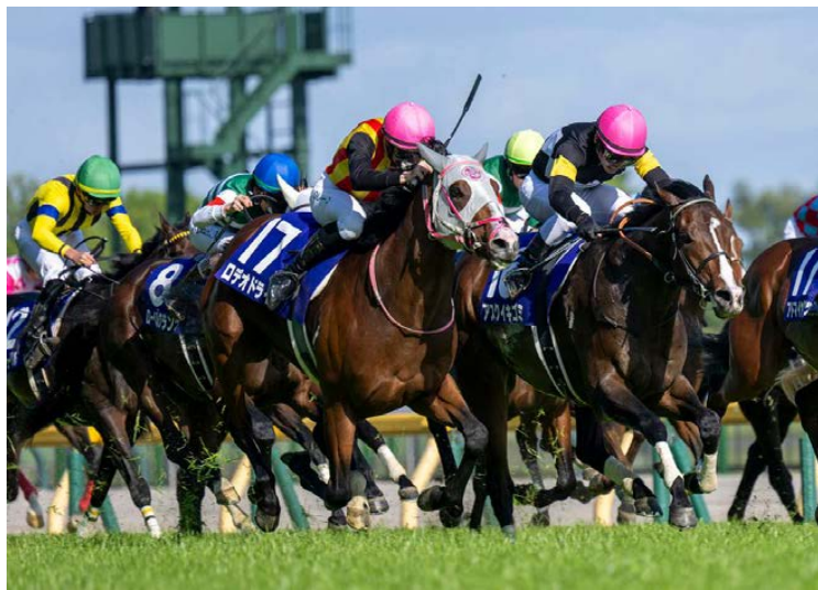
Rodeo Drive (centre)