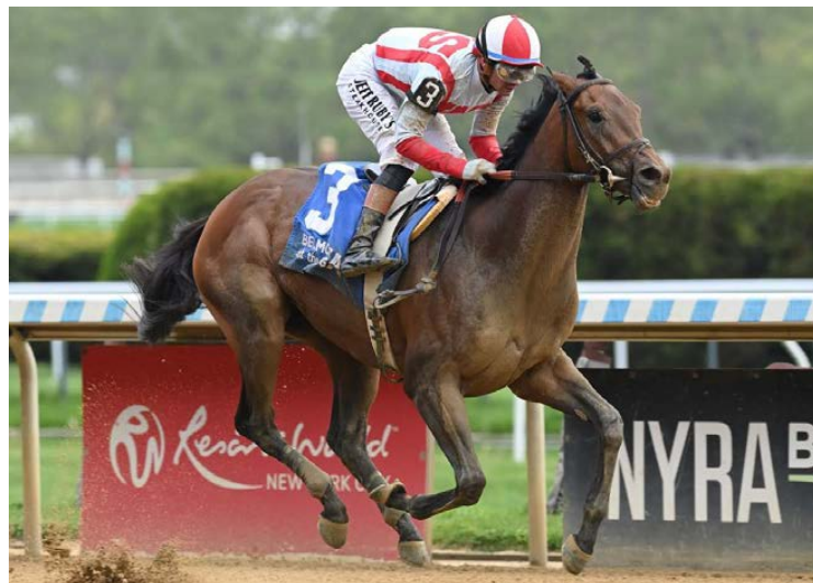
Growth Equity