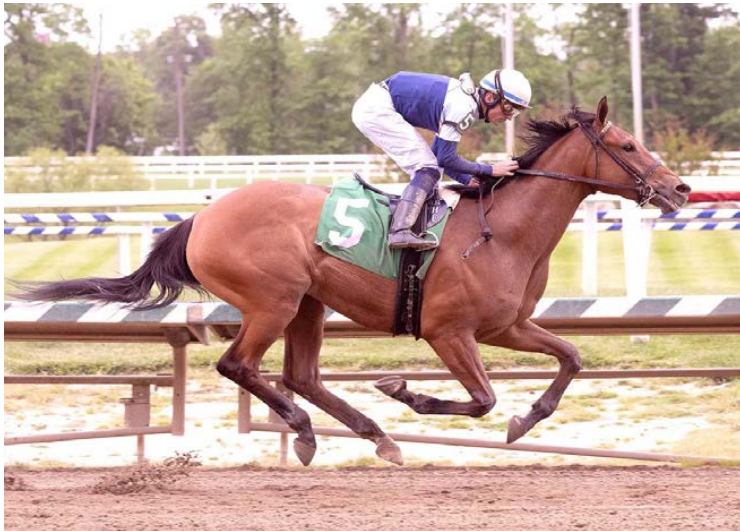
Making Daisys