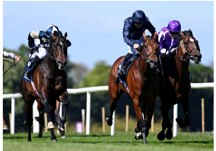
James J Braddock (left)