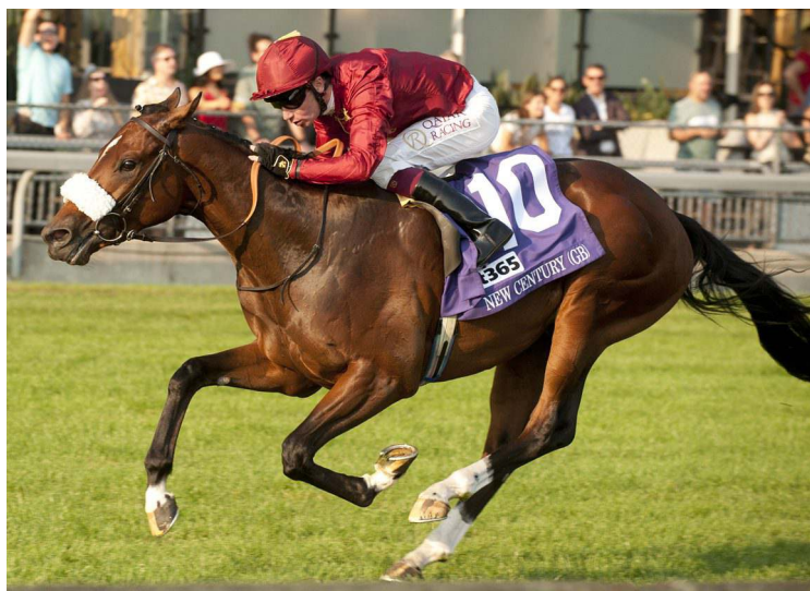
New Century in winning action at Woodbine | Michael Burns