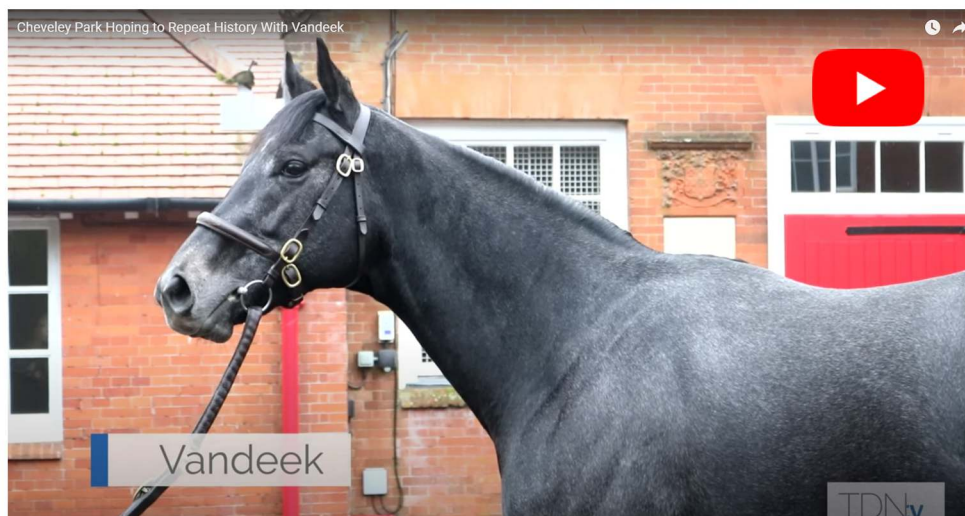
Cheveley Park Hoping to Repeat History With Vandeeek