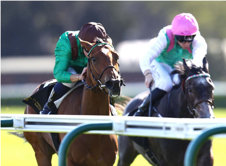
Mandanaba, left, is the final foal of treble Group 1 winner Mandesha Scoop Dyga