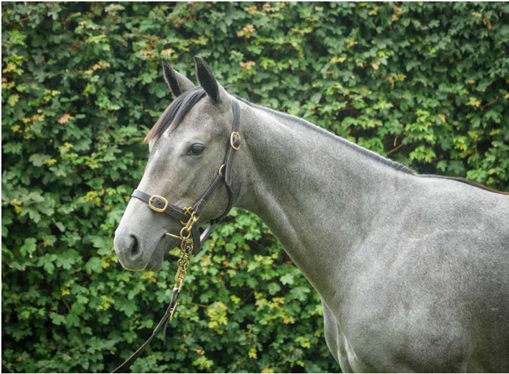
Love Olivia as a yearling

1st-Wolverhampton, £12,000, Mdn, 4-21, 2yo, f, 5f 21y (AWT), 1:02.18, st.