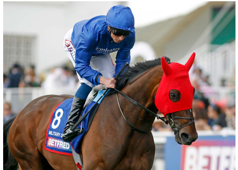
Military Order

Also Ran: Okeechobee (GB), Botanical (Ire), Lion's Pride (GB), Crown Board (Ire), Checkandchallenge (GB).