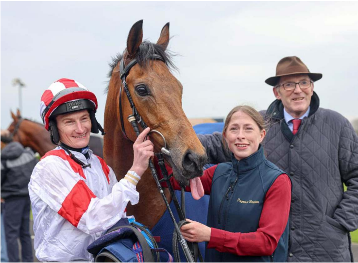
Glittering Legend