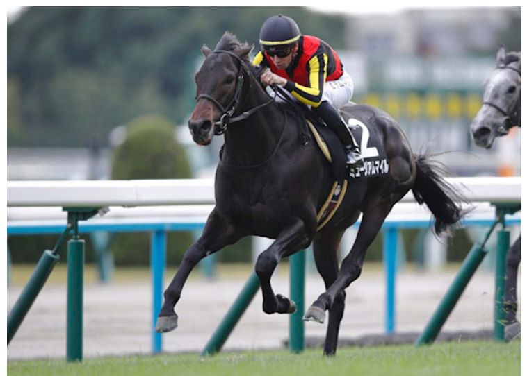
Museum Mile

Cutting back in distance is Rulership (Jpn)’s 2200-metre Listed Sumire Stakes winner G T Adamant (Jpn) . Cont. p14