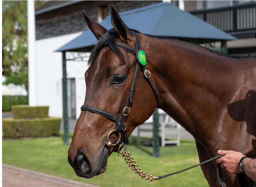
Cathedral as a juvenile | Mel Media