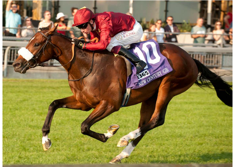
New Century winning at Woodbine