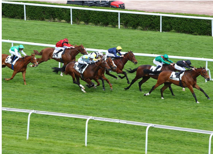
Uthred

UTHRED (FR) (g, 3, Persian King {Ire}--Eristars {Fr}, by Sea The Stars {Ire}) raced under cover in sixth for most of this debut. Making smooth headway in the straight, the 51-10 chance was shaken up to challenge approaching the furlong marker and pushed out to defeat Eliman (Fr) (Siyouni {Fr}) by 3/4-of-a-length. Uthred, half-brother to a yearling filly by Almanzor (Fr), is the first of two foals thrown by a dual-winning granddaughter