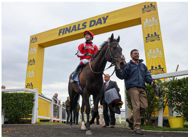
Berkshire Whisper