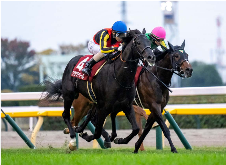
Croix Du Nord