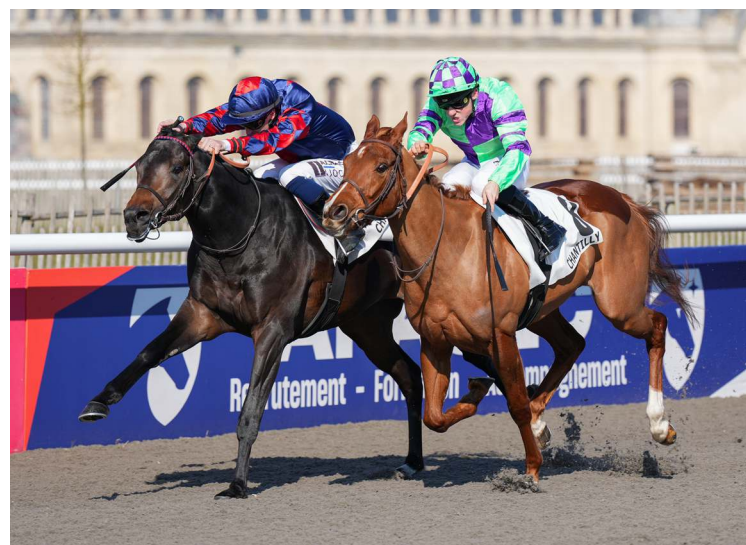
Les Petits Princes (left)