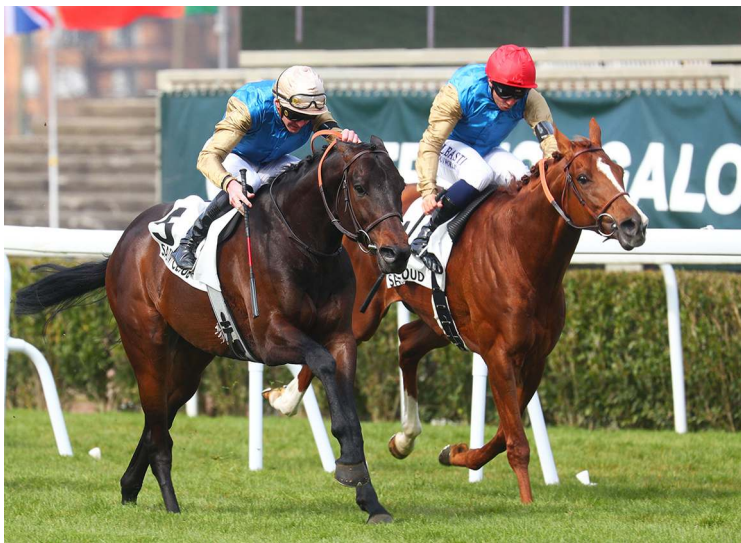
Map Of Stars (left) wins the Prix Exbury at Saint-Cloud

From Gold Cups for hedge-hoppers we turn to the stars of the Flat as Wathnan Racing starts the season in style