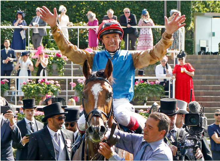
Courage Mon Ami is back in training