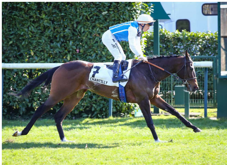
Polyvega | Scoop Dyga