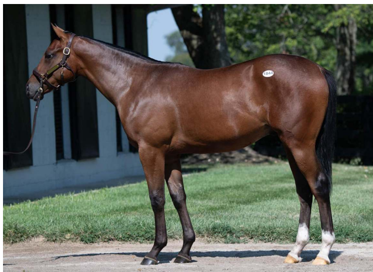
Lot 174 (shown as a yearling) is a Constitution half-brother to Tampa Bay Derby winner Owen Almighty