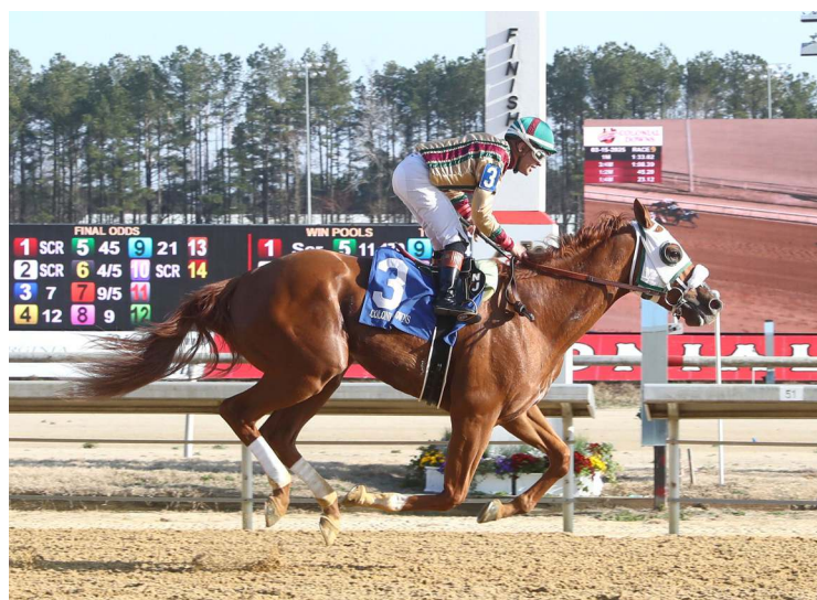
Justify’s American Promise punched his ticket to the GI Kentucky Derby with a towering victory in the Virginia Derby

FOR THE WEEK ENDING MARCH 16, 2025 ACTIVE NORTH AMERICAN-BASED STALLIONS