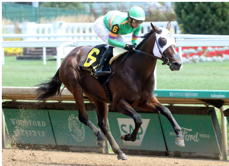
Vodka With a Twist

Most recently clocked in a five furlong move in :59.80 (4/71), the multiple Grade I-placed filly has been on the sidelines since running third behind GISW Tenma (Nyquist) and SW & GSP Look Forward (Bolt d'Oro) in the GII Starlet Stakes at Los Alamitos Dec. 7.