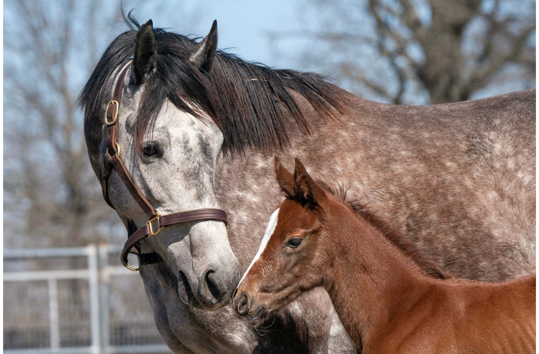
Macadamia (Fr) (Wootton Bassett {GB}), a full sister to King Of Steel, is pictured last week with her filly by Justify. The Bonne Chance Farm-bred filly was foaled on March 7.