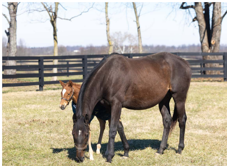
Sweet Sami D with her '25 Gun Runner colt

A young mare with an exceptionally deep pedigree. She got her broodmare career off to an excellent start in 2024 with her first foal, Into Diamonds (Into Mischief), winning at Keeneland in April and subsequently collecting black type at Woodbine. We have retained her Quality Road 2-year-old and she had a colt by Not This Time this year. Cont.