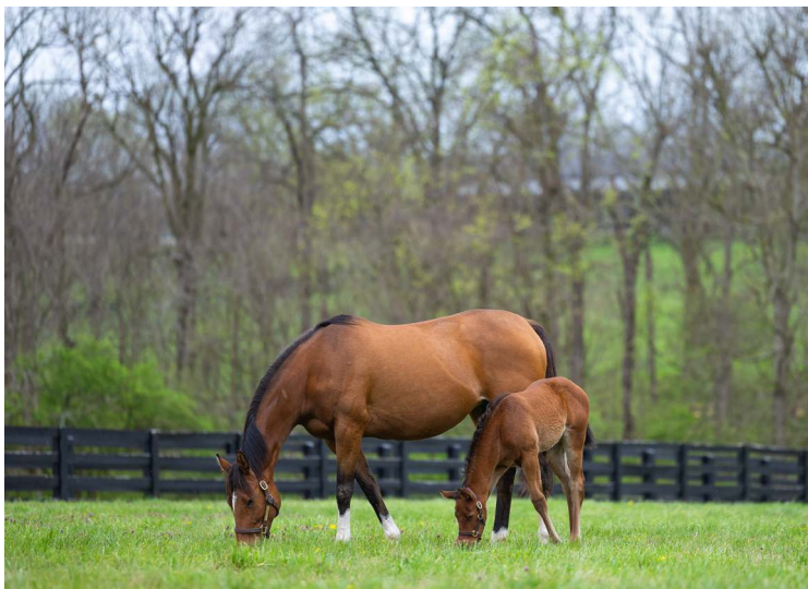
Glitter and Gold with her '24 Essential Quality filly

She will be covered this year by Twirling Candy, which looks like a strong cross for her with his Grade I winner Concrete Rose coming from the Twirling Candy x Sadler's Wells cross.