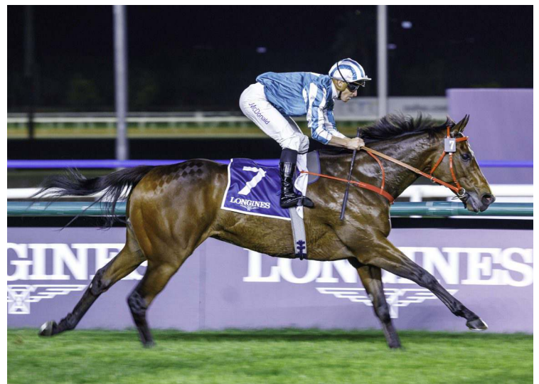
Romantic Warrior