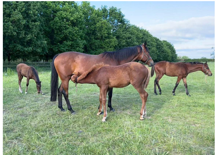
The British foal crop has dropped by 27 per cent over 20 years

Saudi Arabia imported 230 horses combined, while Italy accounted for 90 British-breds and 229 Irish-bred horses. Another 182 were exported to Australia from Britain and Ireland last year. Cont. p5