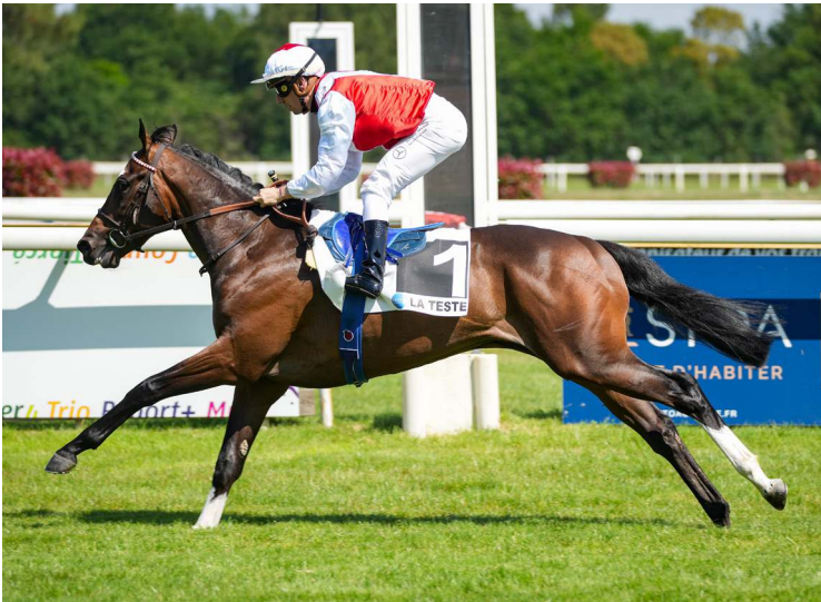
Keanu

The February-foaled bay's second dam Victoire Celebre (Stravinsky) is a half-sister to multiple Group 1-placed dual Group winner Verveine (Lear Fan), herself the dam of G1 Hong Kong Vase heroine Vallee Enchantee (Ire) (Peintre Celebre) and GI E. P. Taylor S. victrx Volga (Ire) (Caerleon). Sales history: €70,000 Ylg '23 ARQOCT. Lifetime Record: 2-1-1-0, €16,100.