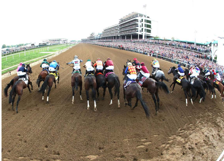
Honor Marie breaks from the seventh position in the GI Kentucky Derby