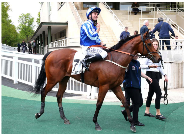
Hot Darling