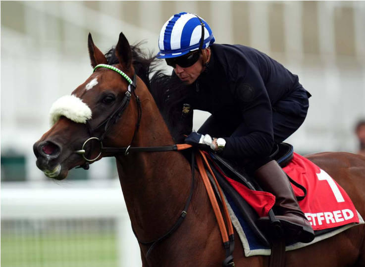
Deira Mile