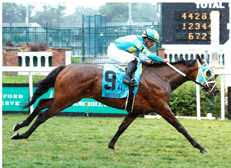
Pin Up Betty became the sixth stakes winner and fourth graded winner of 2024 for Constitution in the Regret S.