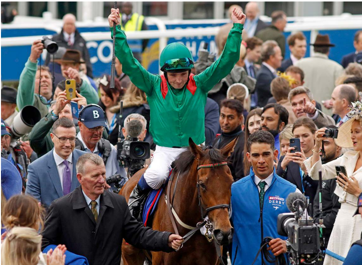
Ezeliya was a second Classic winner this season for the Aga Khan

In America, Justify , born in the year that Scat Daddy died, holds sway. How much his having sired a Derby winner on turf increases his appeal to American breeders is hard to quantify but City Of Troy is now the top-rated three-year-old colt in Europe, where he was also champion two-year-old, and Justify's ability to produce top-class runners on turf and dirt makes him a stallion that top breeders from around the world simply cannot ignore.