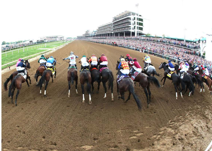
Honor Marie breaks from the seventh position in the GI Kentucky Derby