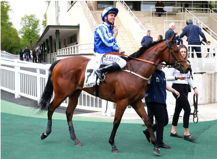
Hot Darling | Scoop Dyga