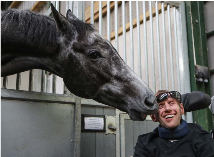
Rob Burrow: died at the age of 41 on Sunday