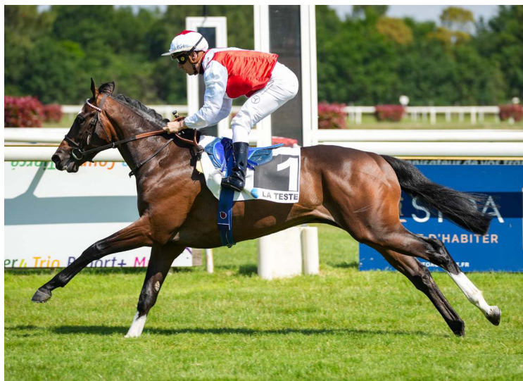
Keanu

The February-foaled bay's second dam Victoire Celebre (Stravinsky) is a half-sister to multiple Group 1-placed dual Group winner Verveine (Lear Fan), herself the dam of G1 Hong Kong Vase heroine Vallee Enchantee (Ire) (Peintre Celebre) and GI E. P. Taylor S. victrx Volga (Ire) (Caerleon). Sales history: €70,000 Ylg '23 ARQOCT. Lifetime Record: 2-1-1-0, €16,100.