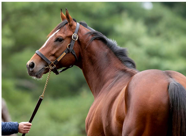
Maximum Security has an entry in France

Mohaather (GB) (Showcasing {GB}), Beech House Stud 96 foals of racing age/0 winners/0 black-type winners 17:30-WOLVERHAMPTON, 5f, Colocolo (GB) 10,000gns RNA Tattersalls October Yearling Sale (Book 3) 2023