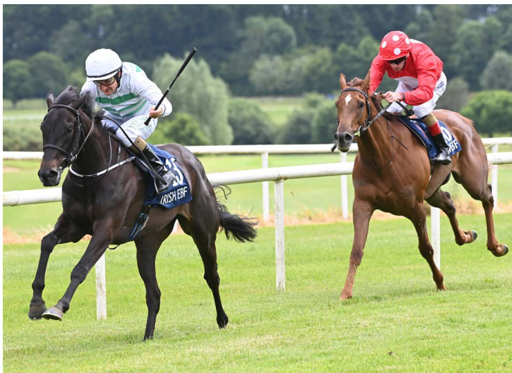
Fleur de Chine

Fleur De Chine, kin to a yearling filly by Kingman (GB) , is the third of five foals and one of two scorers out of a winning full-sister to G1 British Champions Fillies & Mares heroine Madame Chiang (GB) (Archipenko), the other being G3 Prix de Psyche third Empress Wu (GB) (Sea The Moon {Ger}). Madame Chiang, in turn, is the dam of multiple Group-placed Listed Prix Luth Enchantee victrix Oriental Mystique (GB) ( Kingman {GB} ) and the dual Group 3-placed Ching Shih (Ire) (Lope De Vega {Ire}).