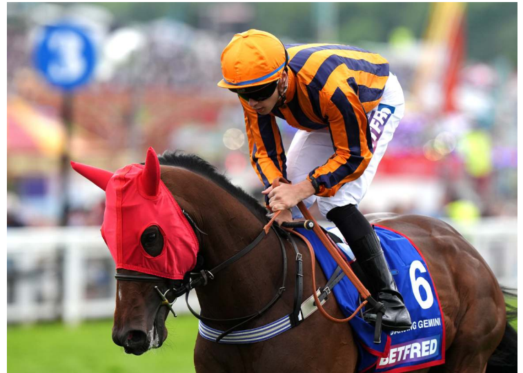
Dancing Gemini