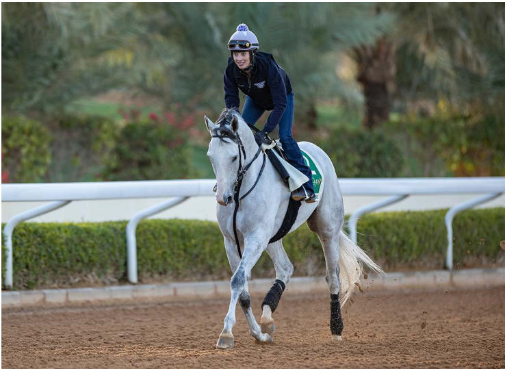
White Abarrio | Jockey Club of Saudi Arabia

Featured earlier in the card in the GI Hill 'n' Dale Metropolitan H. is the return of both last year's GI Longines Breeders' Cup Classic winner White Abarrio (Race Day) and this year's GI Pegasus World Cup Invitational winner National Treasure ( Quality Road ). Both horses enter off a trip back from the G1 Saudi Cup where National Treasure was fourth while White Abarrio was 10th.