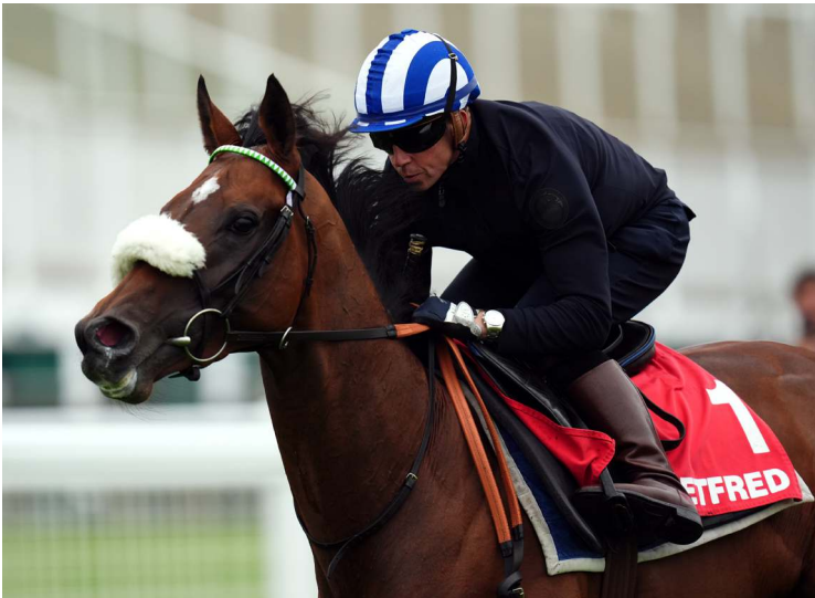
Deira Mile