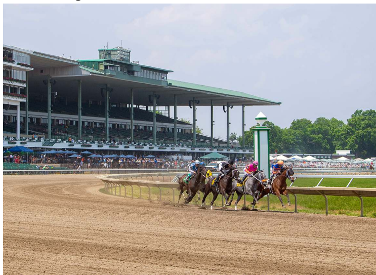
Monmouth Park | Sarah Andrew

New Jersey and will also be licensed to distribute BetMakers' Thoroughbred racing content to bet365 customers in New Jersey and both Thoroughbred and Standardbred racing in Colorado. Bet365 will also be licensed to distribute BetMakers' Thoroughbred racing content to bet365 customers in New Jersey and both Thoroughbred and harness racing in Colorado. Bet365 will pay BetMakers a 'Market Access Fee' based on a percentage of all fixed odds bets placed in New Jersey on all Thoroughbred racing events it offers to its customers and a 'Content Fee' based on a percentage of all fixed odds bets placed in New Jersey and Colorado on applicable BetMakers Global Racing Network content.