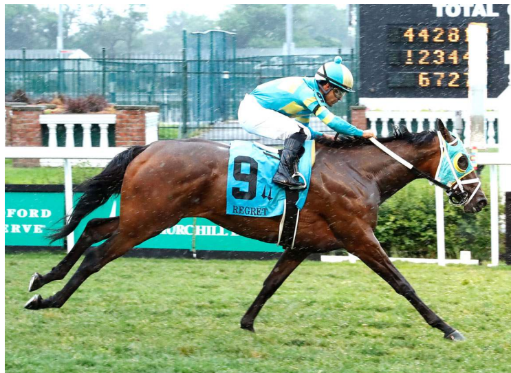
Pin Up Betty became the sixth stakes winner and fourth graded winner of 2024 for Constitution in the Regret S.