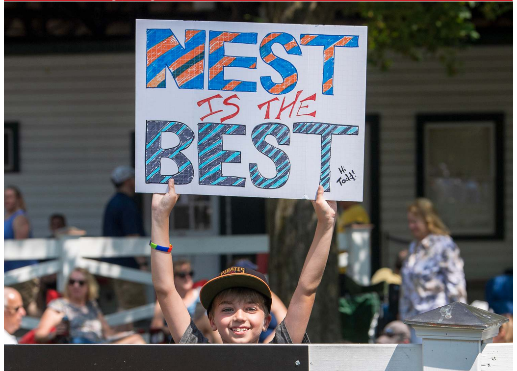
A young fan cheers Nest (Curlin) to victory in the GII Shuvee S. last summer at Saratoga Race Course.