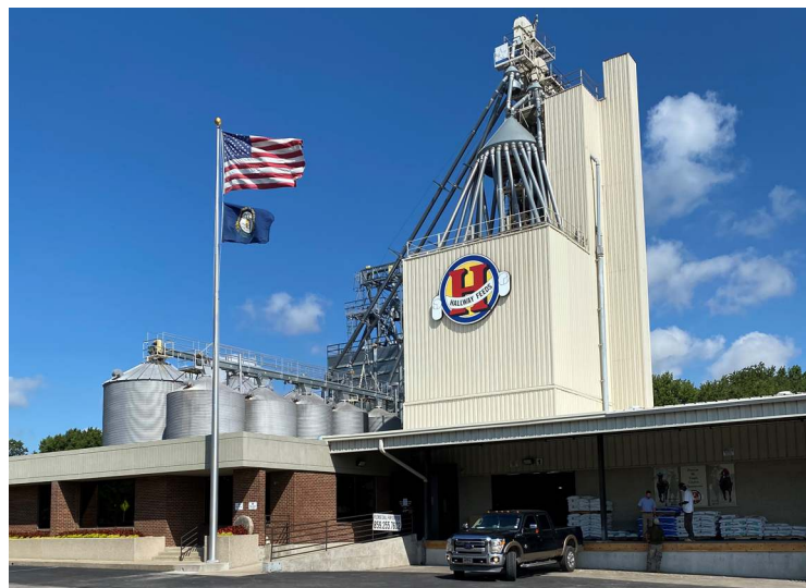
The new Hallway Feeds | Hallway Feeds