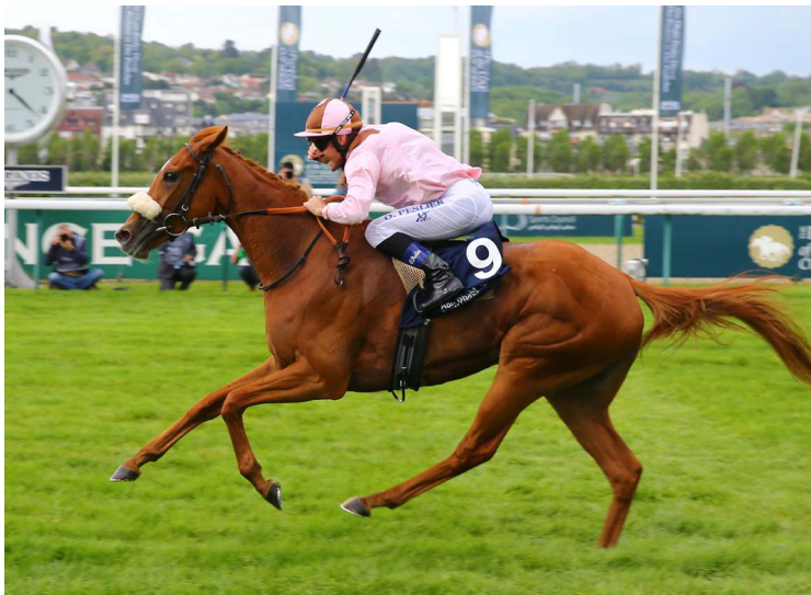
Precieuse, dam of Gallantly