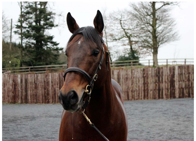
Far Above

Far Above (Ire) (Farhh {GB}), Starfield Stud 83 foals of racing age/0 winners/0 black-type winners 14:05-CHESTER, 6f, Far Above Mary (Ire) £32,000 Goffs UK Premier Yearling Sale 2023