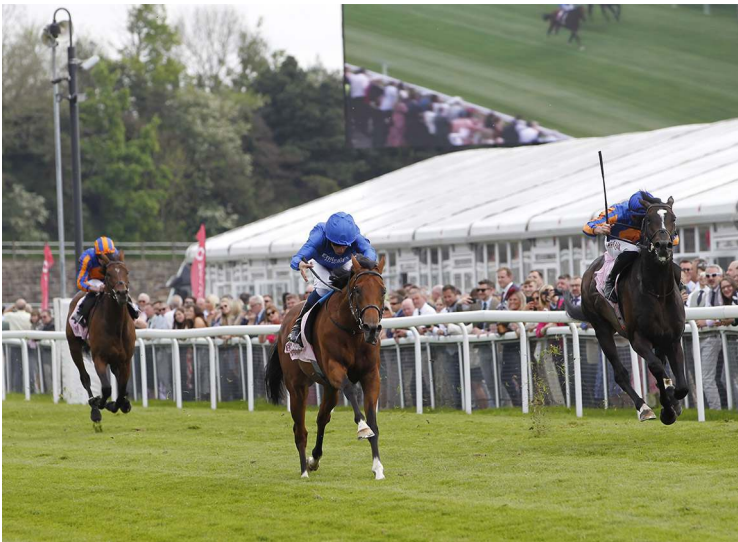
Hidden Law winning the Chester Vase