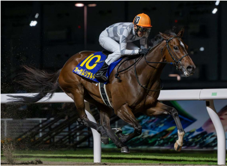
Awesome Result