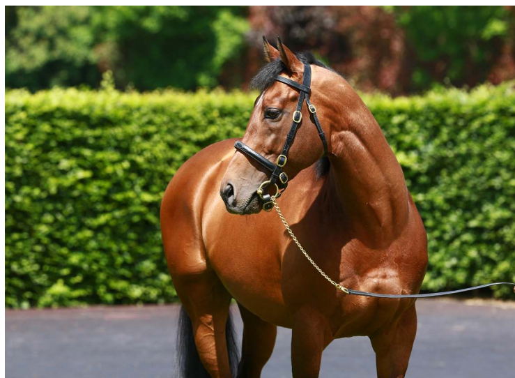
Zoffany | Coolmore

Since New Year's Day, the stallion is already enjoying an international renaissance with his progeny and has five stakes winners of all ages to his name in both hemispheres. His first stakes horse of the year was the gelding Al Nayyir (GB), second in the Listed Al Khail Trophy in Dubai in January, who was only two lengths off Tower Of London (Ire) (Galileo {Ire}) in the G2 Dubai Gold Cup at the end of March. Zoffany's international results were further padded that month by an Australian listed and Group 3 wins for Fawkner Park (Ire) and Osmose (Fr) respectively, with the former doubling up at listed level in the Wagga Wagga Gold Cup last week. His latest stakes winner is 'TDN Rising Star' Gather Ye Rosebuds (GB), successful in the Listed British Stallion Studs EBF Daisy Warwick Fillies' S. at Goodwood on 2,000 Guineas Day.