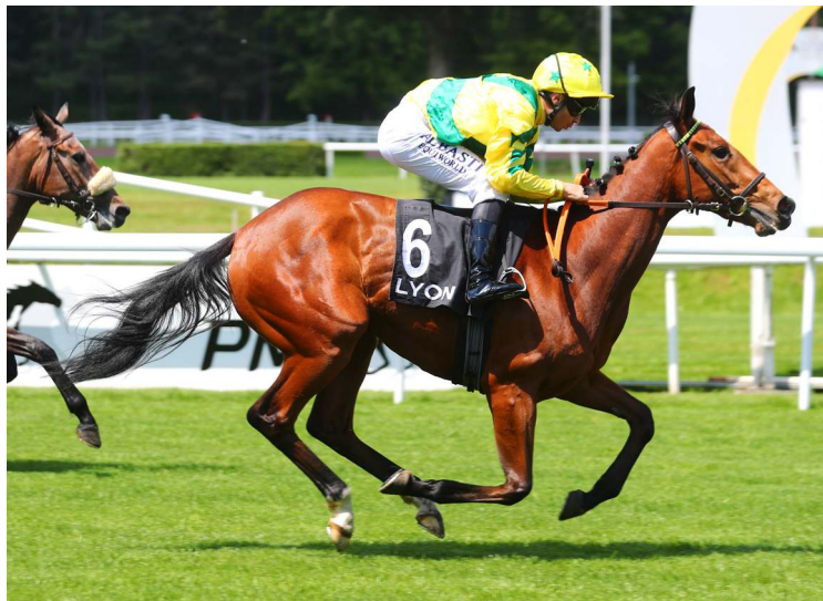
Stunning Angel | Scoop Dyga