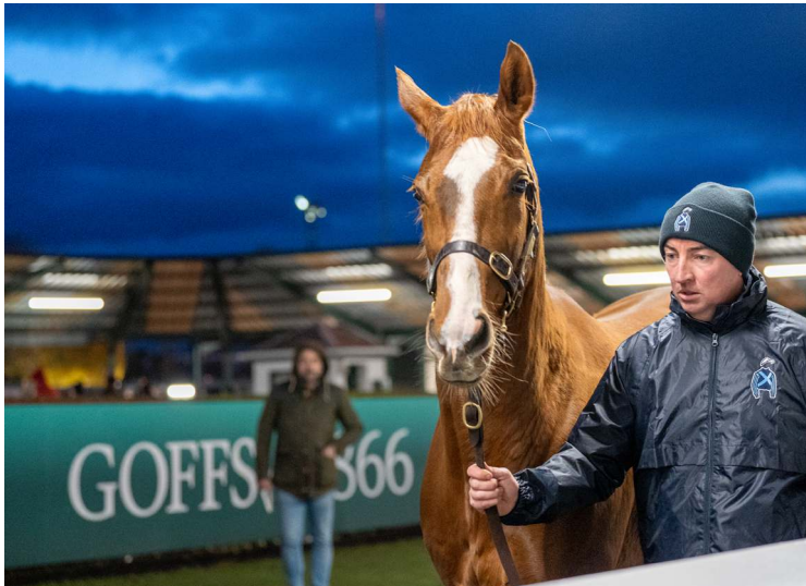
Albigna was one of several seven-figure mares by Zoffany sold in 2023 Goffs

Regardless of what his final crop accomplishes on the racecourse, it is more likely that Zoffany will prove more potent as a broodmare sire. His sextet of stakes winners in that sphere are anchored by G1 Prix Marcel Boussac heroine Tiger Tanaka (Ire) (Clodovil {Ire}) and Licancabur (Jpn) ( Silver State {Jpn}) struck in the G3 Nakayama Kimpai just six days into the new year. This past Sunday, Tamfana (Ger) (Soldier Hollow {GB}) ran an eye-catching fourth in the G1 QIPCO 1000 Guineas, and could yet be poised to add a Group 1 rosette.