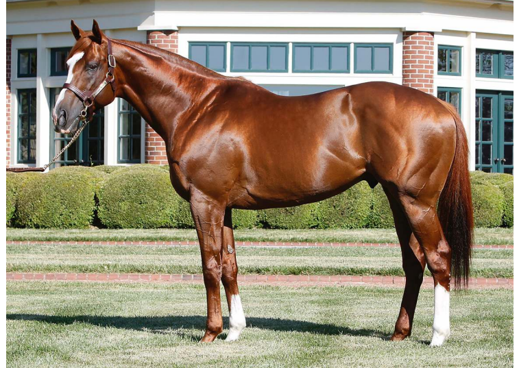
Catalina Cruiser | Lane's End

Candygram (Candy Ride {Arg}) 27 foals of racing age/2 winners/0 black-type winners 3-Charles Town, 7:57 p.m. EDT, Msw 4 1/2f, Petty Perfect, 4-1