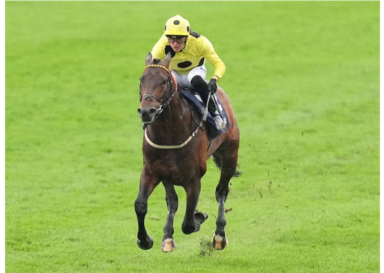
Caviar Heights

The G2 Dante S. at York on Thursday, May 16 is likely to be the next port of call for Caviar Heights (Ire) following his victory in last week's Listed Newmarket S. on the Rowley Mile.