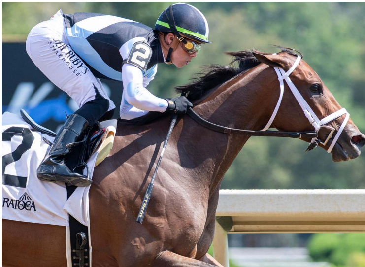
Nest