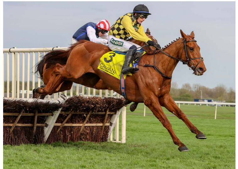
Sale graduates excel at the highest levels of the jumps sphere | Goffs

A 701-lot catalogue for the Goffs Arkle Sale , held in partnership with Defender, was released by the sales company on Wednesday.