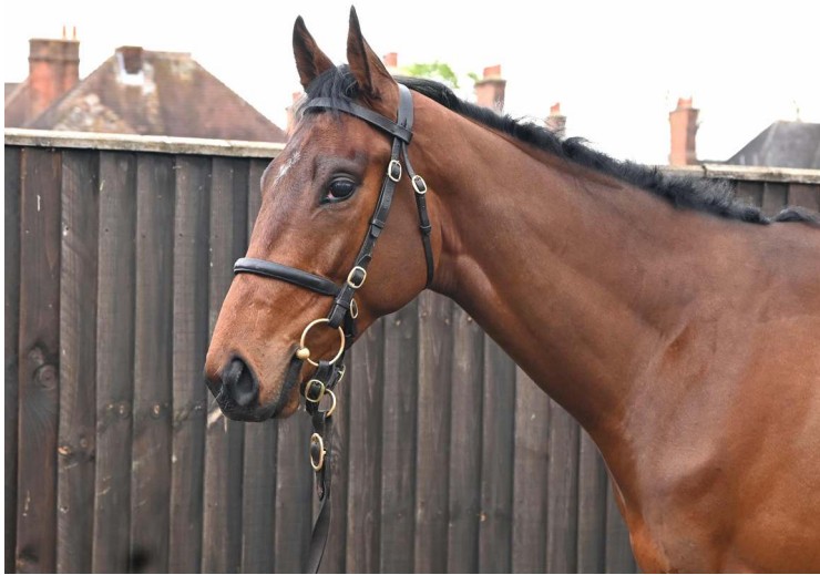
Bracken's Laugh at two