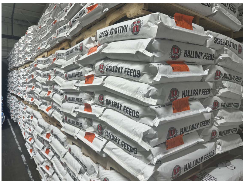
Hallway Feeds in the mill | Hallway Feeds