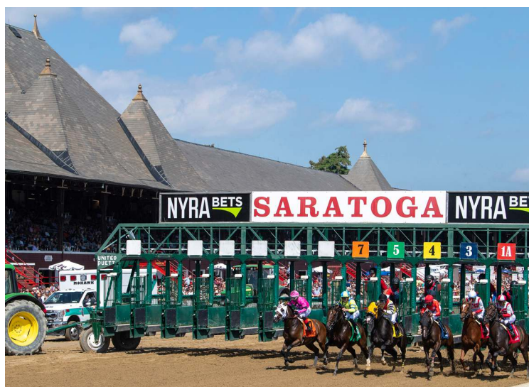
Saratoga Race Course