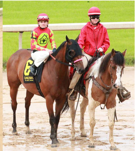
Horses and riders pause the post parade to commemorate the end of the meet at Oaklawn with the Trail's End ceremony, in which the bugler plays "Auld Lang Syne" before Sunday's final race.