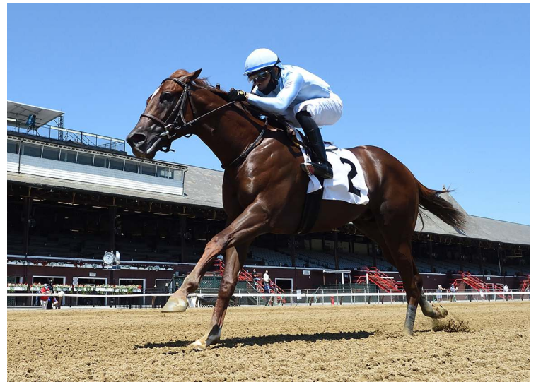
'TDN Rising Star' Momos