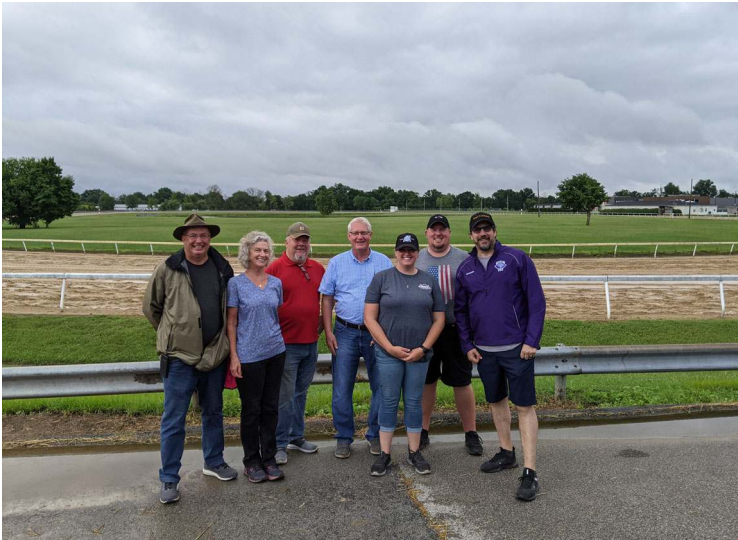
Morning training with Ironhorse partners

“This is how typical owners buy horses, and there is no reason partnership participants can't have that same opportunity.”