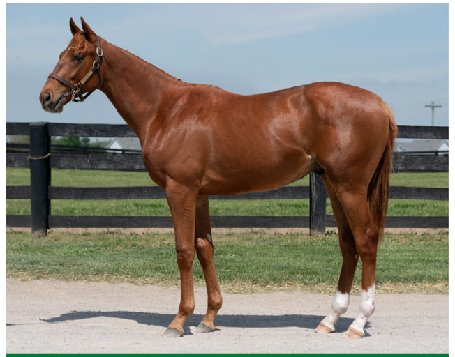
Colt o/o Manahatta

“The whole package. Everybody that sees him says 'wow'. We're pointing towards the Saratoga sale.”