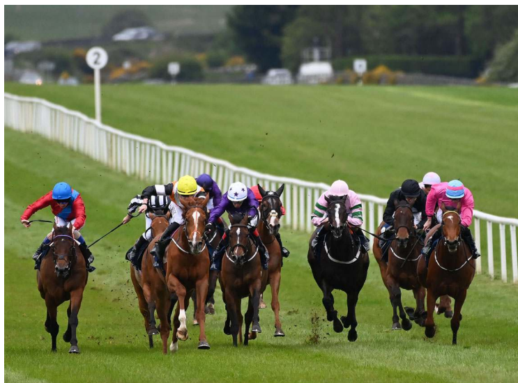
Gregarina winnins at the Curragh

Gregarina is the fourth of five reported foals and one of three scorers produced by a winning half-sister to GII San Clemente H. and GII Honeymoon Breeders' Cup H. victrix Altima (GB) (Zafonic) and G3 Prix des Chenes second San Domenico (GB) (Zamindar). Descendants of the March-foaled chestnut's third dam Atropa (Vaguely Noble {Ire}) include G3 Prix de Psyche victrix Tenuous (GB) (Generous {Ire}), dual stakes-winning G3 Prix de Cabourg and G3 Prix d'Aumale third Kithira (GB) (Danehill) and stakes-winning dual Group 3 runner-up Tombelaine (First Defence).