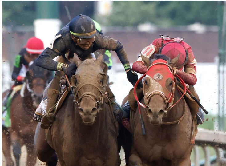
Sierra Leone (left) and Forever Young (right)