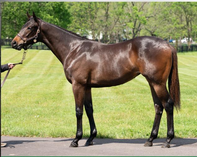
Filly o/o Skinner Box

“Spendthrift and St. Elias have supported him, and we've been rewarded with athletes.”