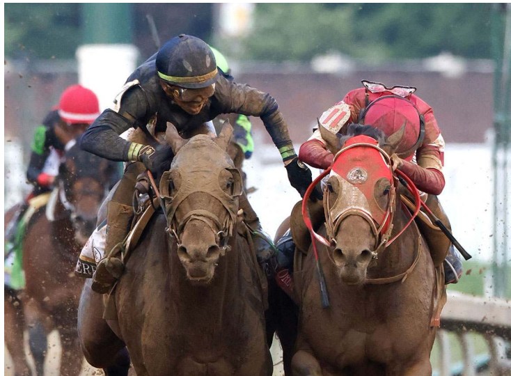
Sierra Leone (left) and Forever Young (right)