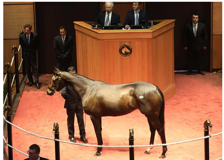
My Bronx Tail at the 2020 Fasig-Tipton February Sale | Fasig-Tipton