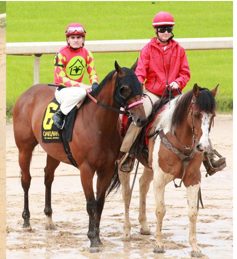
Horses and riders pause the post parade to commemorate the end of the meet at Oaklawn with the Trail's End ceremony, in which the bugler plays "Auld Lang Syne" before Sunday's final race.