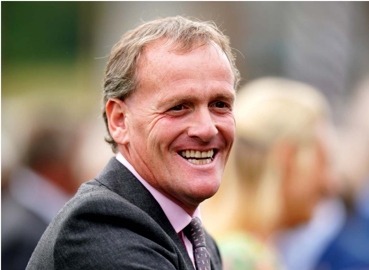
Richard Hannon