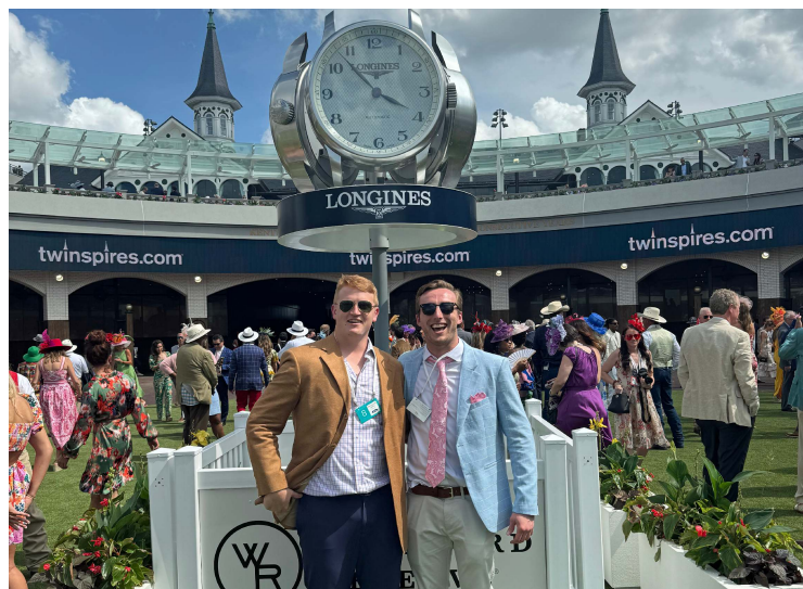
Their smiles say it all. Two members of the group got to experience the new paddock at Churchill Downs

As the day progressed, many of their reactions and comments made me laugh. Some of their questions were humbling, reminding me how incredible our sport is, while others were a bit of a reality check as they made me realize just how easy it can be to live in our “racing bubble” and forget about the general public's true perception of horse racing. I jotted down a few of their direct quotes that struck me most.