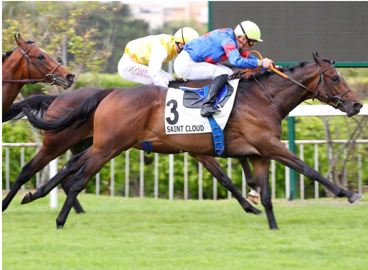
Wootton Verni | ScoopDyga