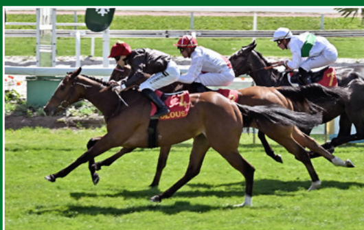
BIRTHE winning the Listed Prix Caravelle.