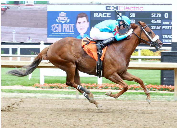
Carimba | Coady

5th-Finger Lakes, $26,500, Alw, 5-6, (NW2L), 3yo, f, 4 1/2f, :52.19, gd, 5 3/4 lengths.