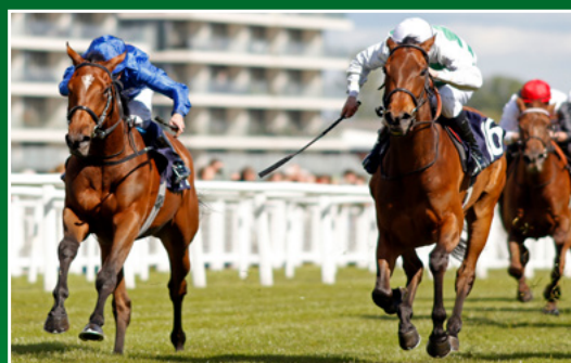
SINOLOGY winning at Newbury.

info@lanwades.com • www.lanwades.com • Tel: +44 (0)1638 750222 X Instagram