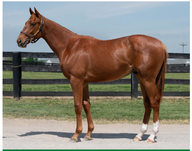
Colt o/o Manahatta

“The whole package. Everybody that sees him says 'wow'. We're pointing towards the Saratoga sale.”