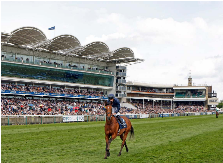
City Of Troy: is still on course for the Derby

Aidan O'Brien has suggested that he left City Of Troy ( Justify ) "too fresh" ahead of what turned out to be a bitterly disappointing return in the 2,000 Guineas at Newmarket on Saturday but went on to explain that last season's European Champion Two-Year-Old remains on course to run in the Derby.