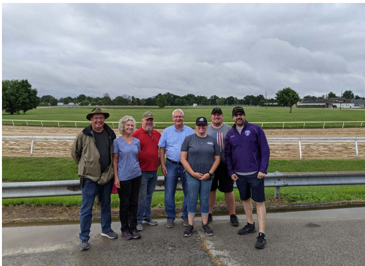
Morning training with Ironhorse partners

“This is how typical owners buy horses, and there is no reason partnership participants can't have that same opportunity.”