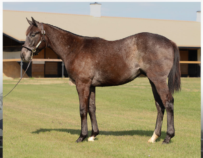
Colt o/o Bettyfromtheblock

“Tremendous mover, just floats over the ground. A lot of substance, power and very well balanced.”