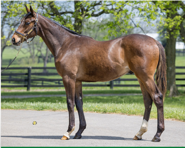
Colt o/o Pin Up (IRE)

“A lot of quality. Physically, he stacks up to his brother Timberlake. The plan is to race him.”