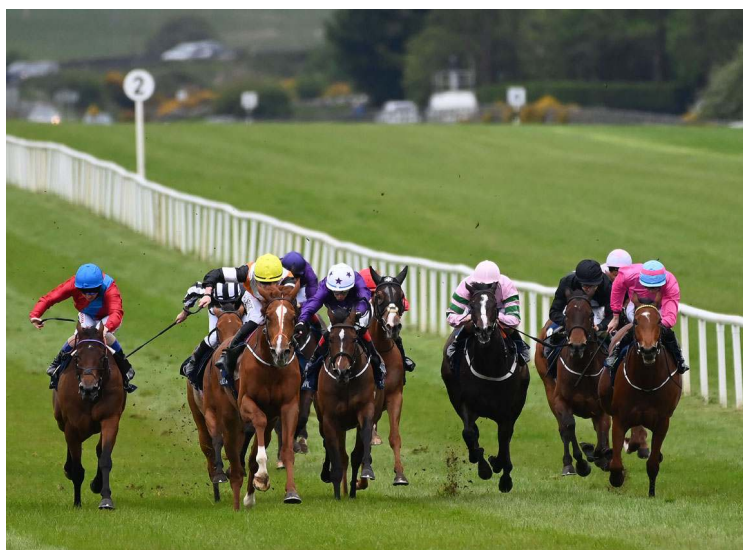
Gregarina winnins at the Curragh

Gregarina is the fourth of five reported foals and one of three scorers produced by a winning half-sister to GII San Clemente H. and GII Honeymoon Breeders' Cup H. victrix Altima (GB) (Zafonic) and G3 Prix des Chenes second San Domenico (GB) (Zamindar). Descendants of the March-foaled chestnut's third dam Atropa (Vaguely Noble {Ire}) include G3 Prix de Psyche victrix Tenuous (GB) (Generous {Ire}), dual stakes-winning G3 Prix de Cabourg and G3 Prix d'Aumale third Kithira (GB) (Danehill) and stakes-winning dual Group 3 runner-up Tombelaine (First Defence).