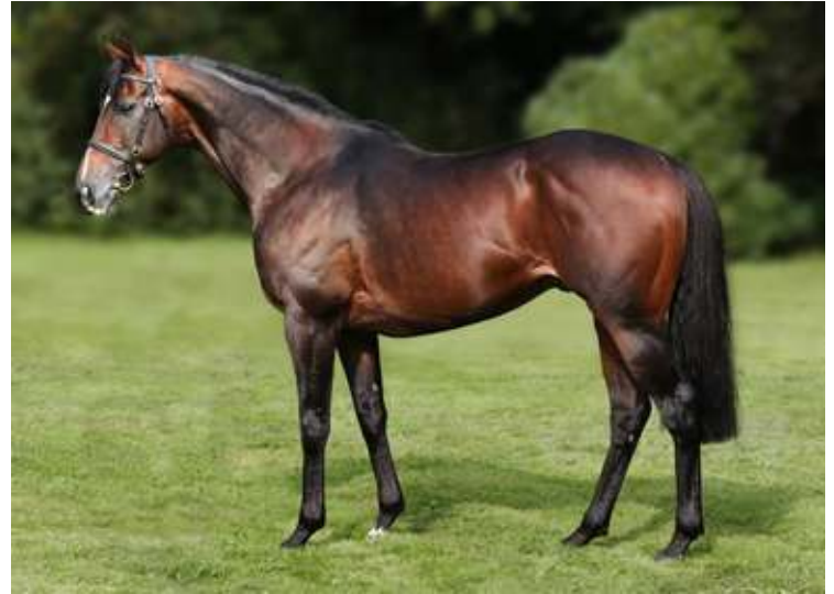
Soldier Hollow