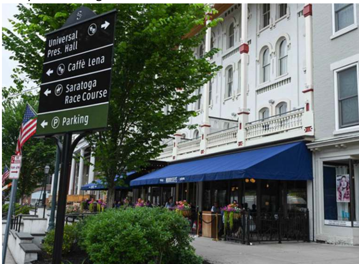
Saratoga downtown