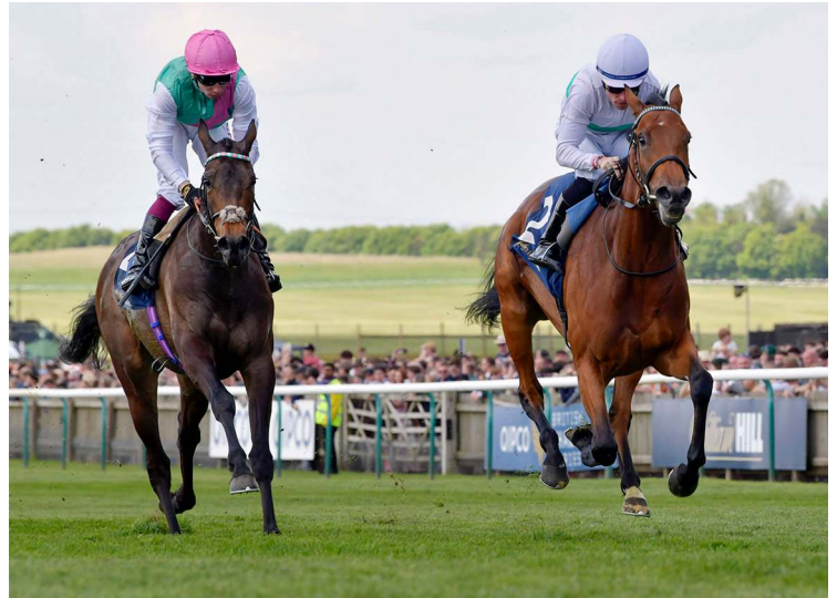
Two smart fillies: Kalpana and Friendly Soul