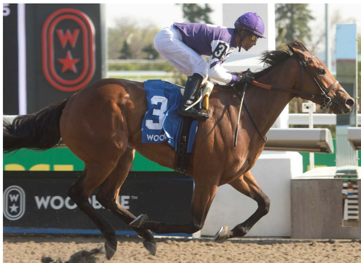
Play the Music became the latest graded stakes winner for Coolmore's Mo Town in the GIII Whimsical S.

FOR THE WEEK ENDING MAY 5, 2024 ACTIVE NORTH AMERICAN-BASED STALLIONS