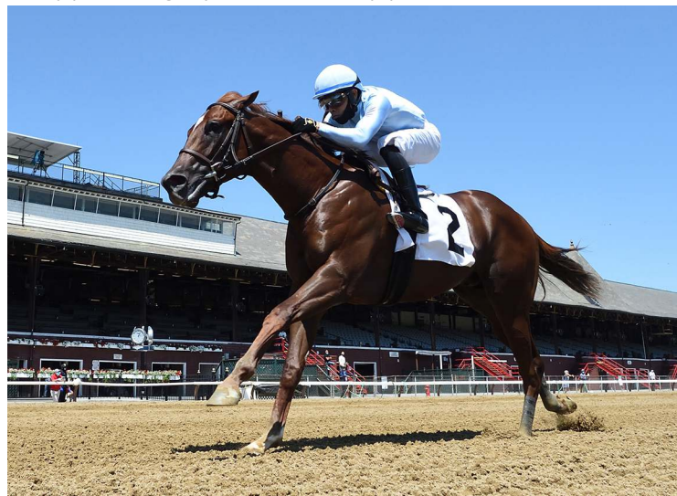
'TDN Rising Star' Momos