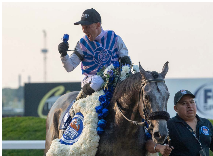
Arcangelo