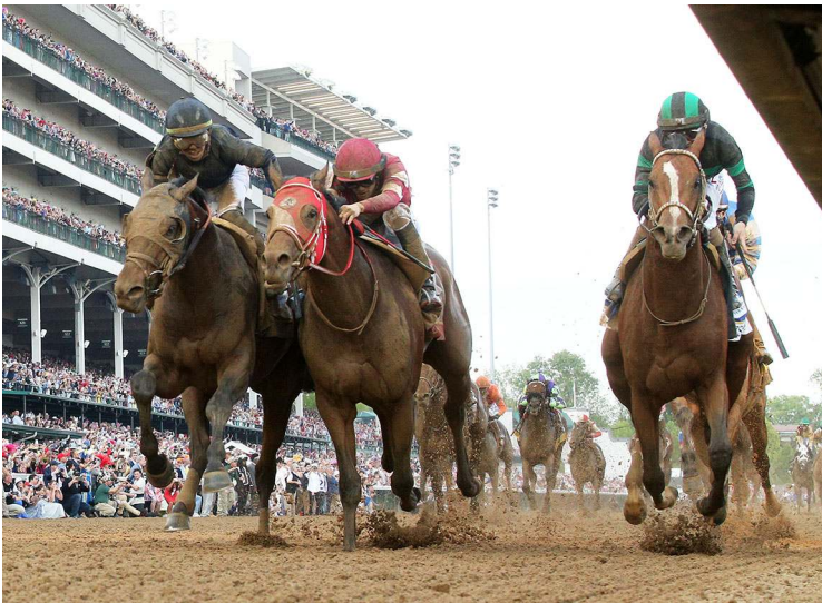
Mystik Dan (rail) holds off Forever Young (Jpn) (middle) and Sierra Leone (outside) in the GI Kentucky Derby