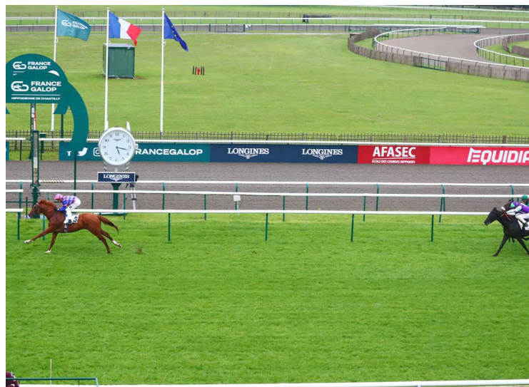
Fast Tracker wins easily at Chantilly

unleashed the smart Mountain Breeze (Ire) (Lope De Vega {Ire}), a three-parts-sister to Pinatubo (Ire), to win the £40,000 Tattersalls-sponsored fillies' maiden on Sunday. She became the latest TDN Rising Star in Europe and is already being talked about with Royal Ascot in mind. Her brother of course took the Chesham S. en route to becoming champion two-year-old.