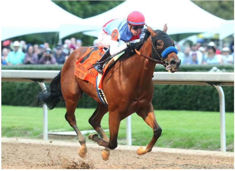
Muth

With the leading GI Kentucky Derby runners looking likely to skip the May 18 GI Preakness S., a wave of non-Derby starters are lining up for the second leg of the Triple Crown. Trainer Bob Baffert, whose horses were banned from the Derby, confirmed GI Arkansas Derby winner Muth (Good Magic) and stablemate Imagination (Into Mischief), who won the GII San Felipe S. before finishing a narrow runner-up behind Stronghold (Ghostzapper) in the GI Santa Anita Derby last time out, are both expected for the Preakness. The duo breezed in company at Santa Anita Saturday, both timed in 1:11.40 (1/5) for six furlongs and they are tentatively scheduled to ship from Southern California to Baltimore May 14.