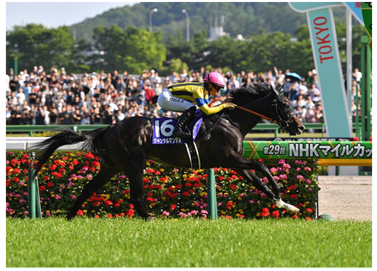
Jantar Mantar

Jantar Mantar (Jpn) (Palace Malice), who was crowned Japan's champion two-year-old colt in 2023, resumed winning ways with a decisive defeat of the unlucky-in-running Ascoli Piceno (Jpn) (Daiwa Major {Jpn}) in Saturday's G1 NHK Mile Cup at Tokyo Racecourse, his fourth win from six career starts.