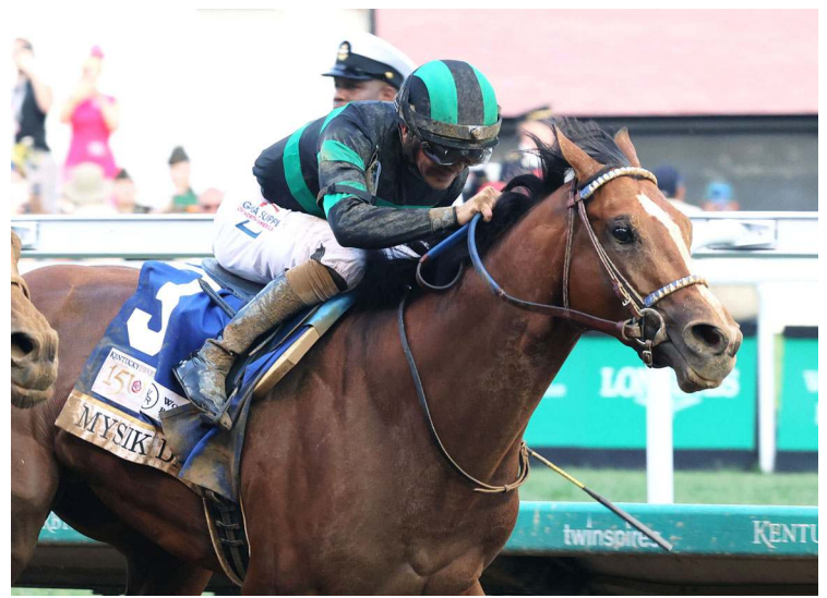
Mystik Dan