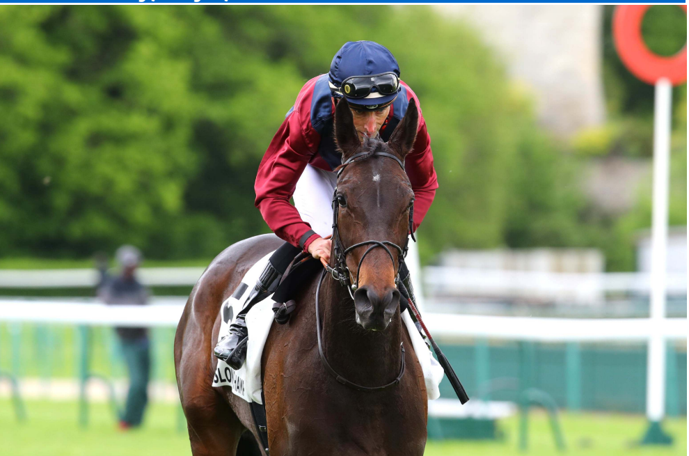
Caption: Gala Real (GB) (Wootton Bassett {GB}) became the latest stakes winner for her Coolmore sire when running out a short neck winner of the Listed Prix de la Seine at ParisLongchamp on Sunday.