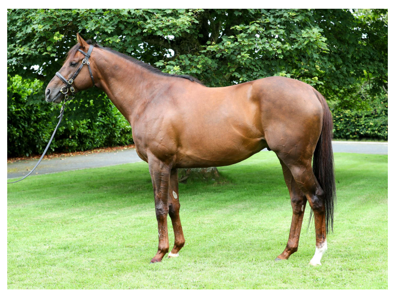
Shaman has a runner at the Curragh | Yeomanstown Stud

Shaman (Ire) (Shamardal), Yeomanstown Stud 103 foals of racing age/0 winners/0 black-type winners 1-CURRAGH, 6f, Sheamus Seimhiu (Ire) Verbal Dexterity (Ire) (Vocalised), Redmondstown Stud 8 foals of racing age/1 winner/0 black-type winners 2-CURRAGH, 24K Gain First Flier Stakes (Listed), 5f, Monotone (Ire)