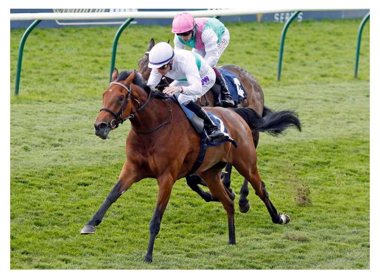
Friendly Soul