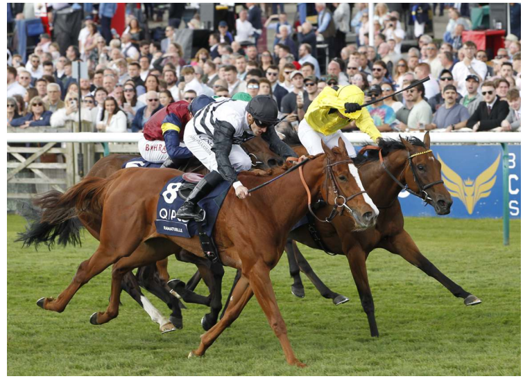
Elmalka (yellow)