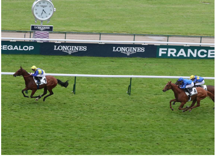
Goliath skips away | Scoop Dyga