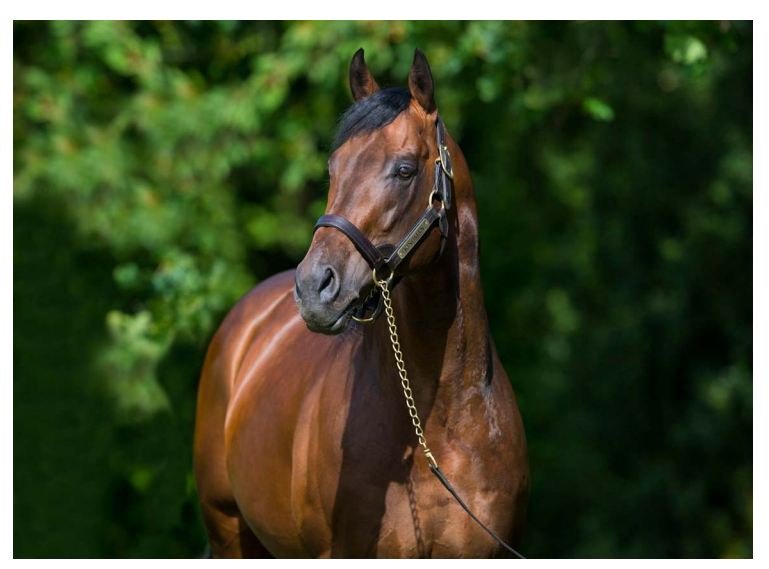
Kingman | Juddmonte

chance," he said. "I don't really know what to say--you could run the race 100 times and 99 times she would win, but that's life. It was a matter of getting gaps and we didn't, which can happen. I'd like to be happy but I can't really as we came here to win the race. I can be happy as we know have a very good filly-everything was right except the result."