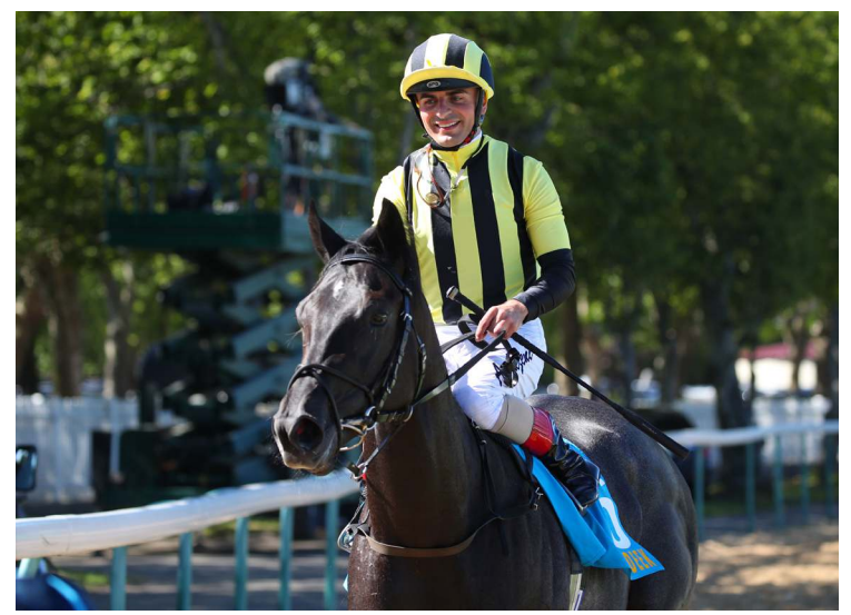
Vandeek