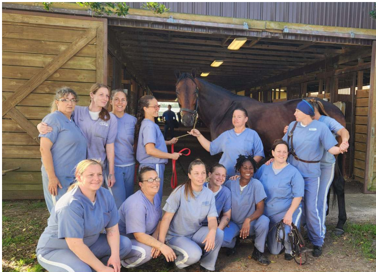
Women's TRF Second Chances Program at Lowell Correctional Institute in Ocala, FL.

Celestial City learned how to be a racehorse by continually proving himself against top competition. Each time he raced, he showed that the lessons he was learning were taking hold. Celestial City became a graded stakes winner, but just when his