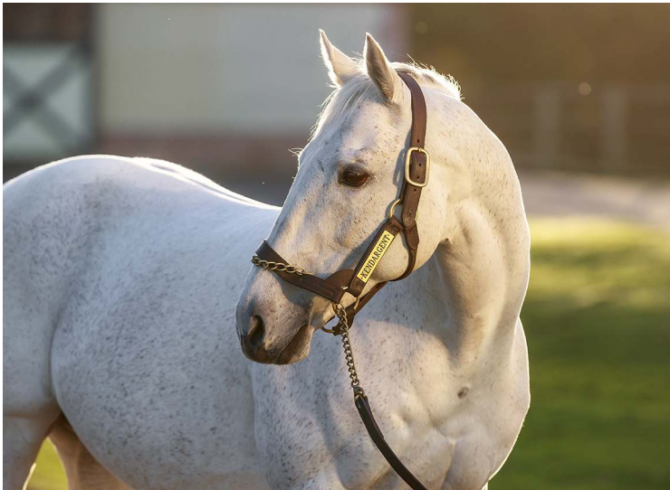
Kendargent