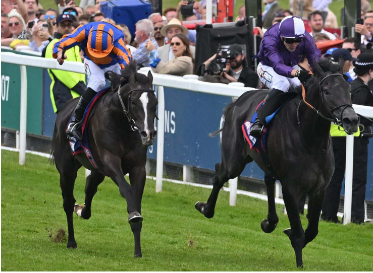
Will Auguste Rodin and King Of Steel clash again at Epsom in the Coronation Cup?

Fifty-eight entries for the Betfred Oaks on May 31 have been revealed, led by last season's champion juvenile filly Opera Singer ( Justify ). The G1 Prix Marcel Boussac winner remains the market leader despite the recent announcement by her trainer Aidan O'Brien that she may miss the 1,000 Guineas at Newmarket following a minor setback in training.