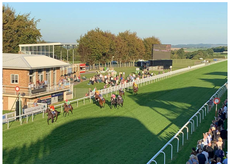
Salisbury Racecourse