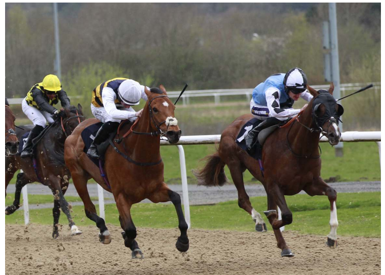
Travolta winning at Wolverhampton

Kawareth (Fr) , f, 4, Oasis Dream (GB) --Zalzalalah (Fr), by Dubawi (Ire). Fontainebleau, 4-2, 9fT, 1:56.52. B-AI Shaqab Racing (FR).