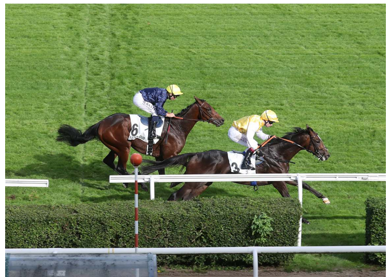
Sunway wins the Criterium International

Kendargent is a sire of sires himself, of course, with Goken (Fr) standing alongside him at Haras de Colleville. In 2023, he was the leading French-based sire of two-year-olds in France by earnings and by percentage of winners to runners (67%). He is the sire of 12 black type horses including Zorken (Fr), a dual Listed-winning two-year-old in 2023, as well as Go Athletico (Fr) and Fang (Fr), both Group 3 winners this year.