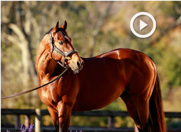
Click the photo of Galiway above to watch the video