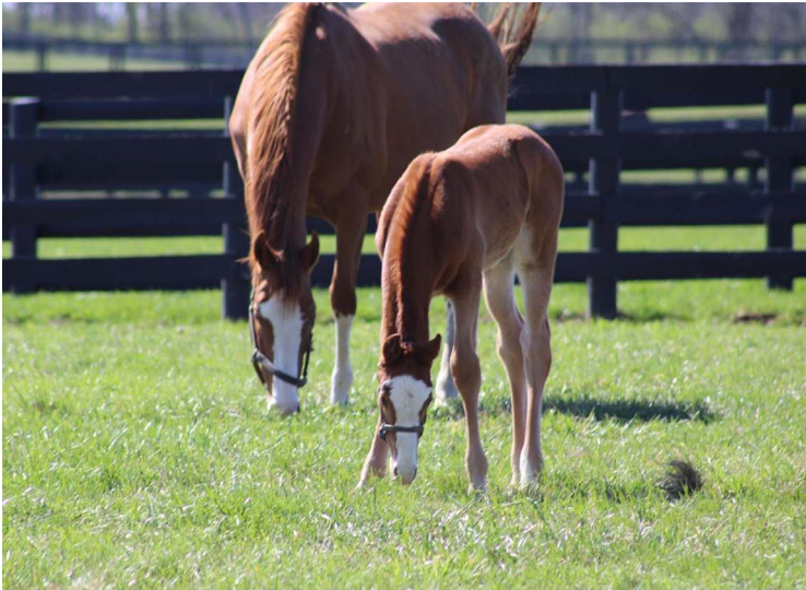
Dawn Of Hope with her Lope De Vega colt