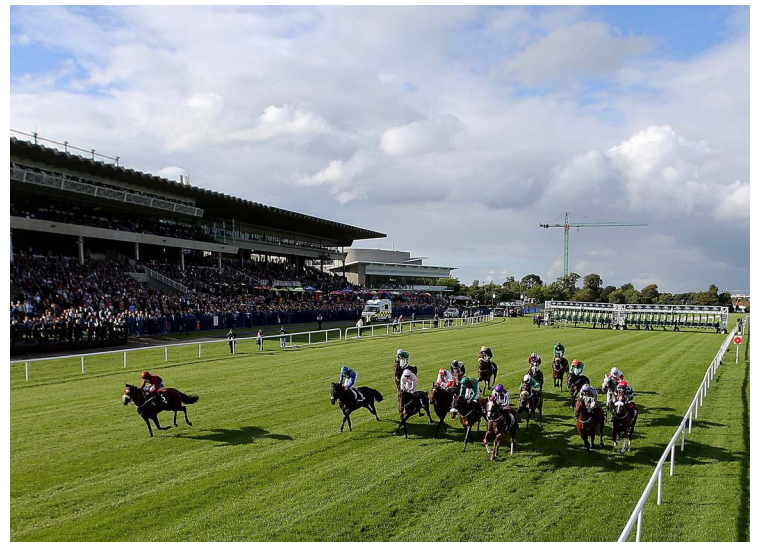
The G3 Derby Trial has a new sponsor | Leopardstown