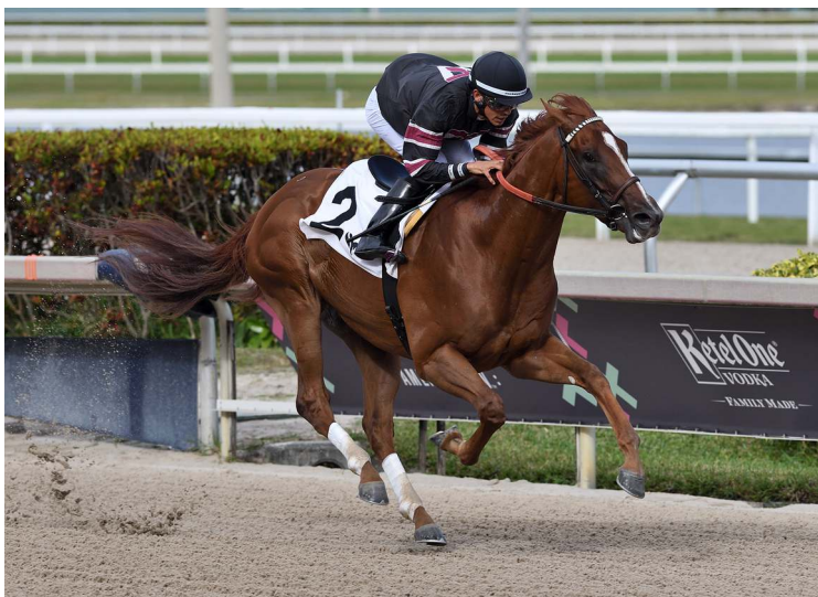
Beeline

The group of sires about to send a third crop of juveniles into the fray is proving a very competitive one, among others featuring Justify , Good Magic and Bolt d'Oro, plus several who appear to be seizing a much narrower chance. The busiest sires in the intake, studmates Mendelssohn and Justify , have so far had 262 and 216 starters, respectively, whereas Army Mule , Girvin and Oscar Performance have muscled into the top 10 (by cumulative earnings) with between 112 and 115 starters apiece. But not even these can match the ratio of stakes winners quietly assembled by Bee Jersey , whose son Beeline became his sixth black-type scorer from just 48 starters in the Hutcheson S. last weekend.