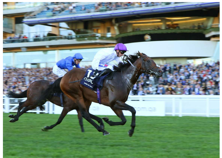
Sands Of Mali has first juveniles this year