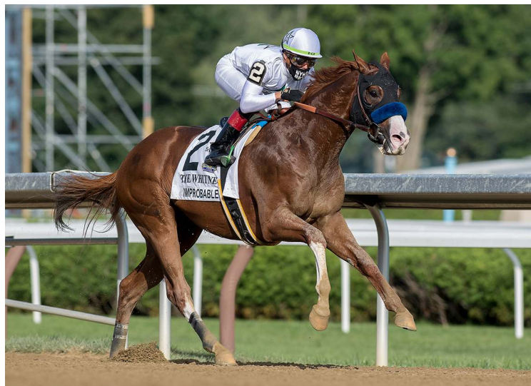
Improbable wins the Whitney | Sarah Andrew

In a horrible shock, last weekend also reduced a young stallion to a legacy only marginally beyond that available to the gelding whose more cheerful headlines we've just been celebrating. And the loss of Improbable felt all the more poignant because he, too, represented a family loaded with just the kind of genetic assets that the modern breed most requires.