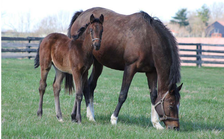
I'm Wonderful and a colt foal by Blame