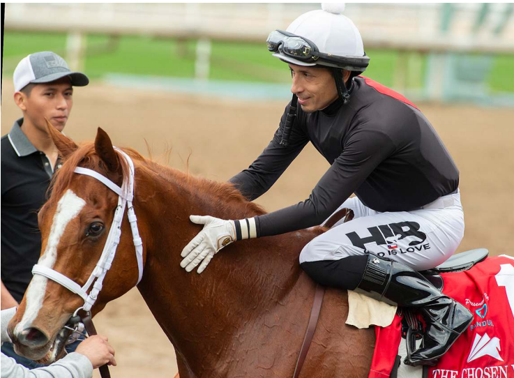
The Chosen Vron | Benoit