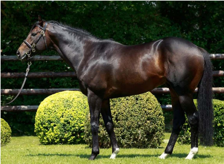
Romanised | Haras de Bouquetot

Yafta (GB) (Dark Angel {Ire}), Haras de la Haie Neuve 24 foals of racing age/0 winners/0 black-type winners 1-MAR.BORELY, 1000m, Spanish Rose (Fr) €10,000 RNA Osarus September Yearling Sale 2023