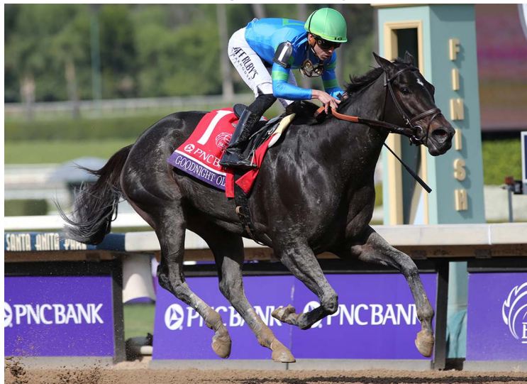
Goodnight Olive, the back-to-back winner of the Breeders' Cup Filly and Mare Sprint, was bred to Not This Time in 2024