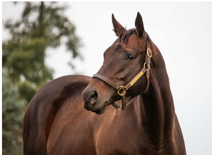
Queen Caroline, the dam of champion Forte, will be bred to Tapit in 2024

Purchased for $500,000 at 2023 Fasig-Tipton November