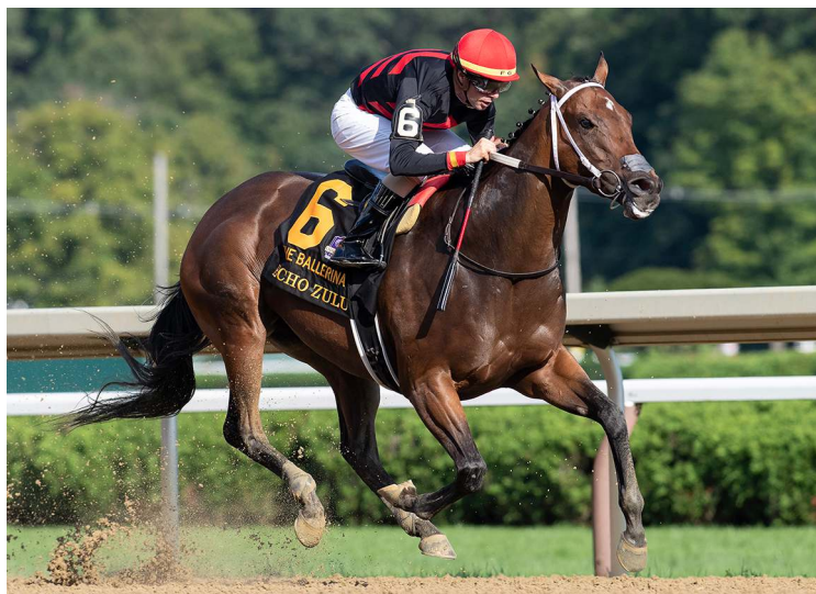
Echo Zulu