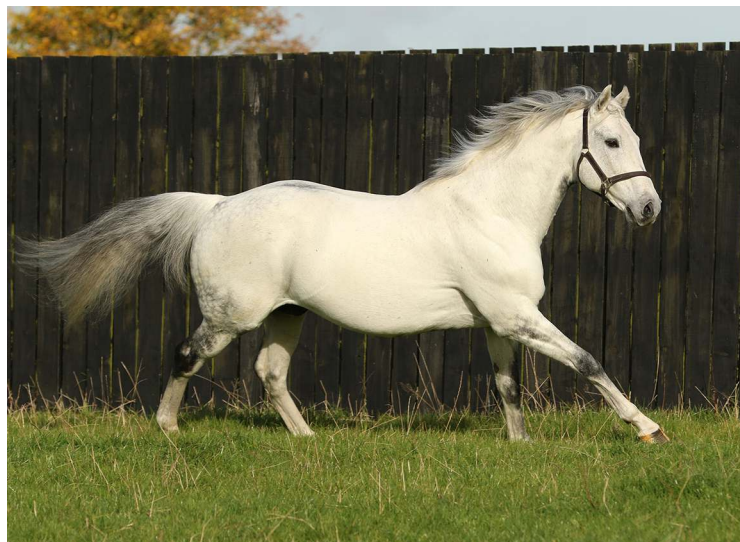
Dark Angel | Yeomanstown Stud