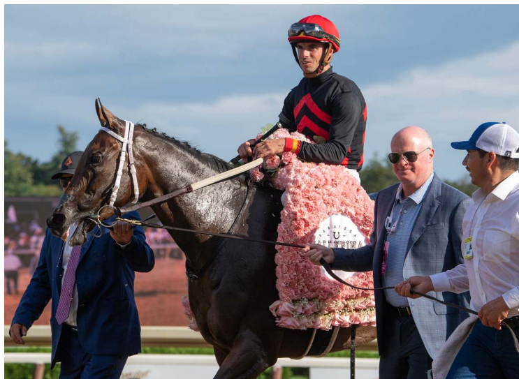
Echo Zulu following the Ballerina

Kept around two turns for the first half of her sophomore season, the bay wired the GII Fair Grounds Oaks, but didn't see out the nine-furlong trip of the GI Kentucky Oaks and finished a close third. Returned to sprint trips for the rest of the season--and her career--she posted a towering victory in the GIII Dogwood S. that September and ran Goodnight Olive ( Ghostzapper ) to 2 1/2 lengths when runner-up in the GI Breeders' Cup Filly & Mare Sprint.