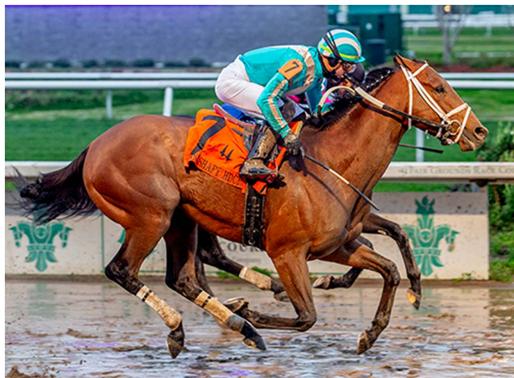
Money Supply became the newest graded stakes winner for Coolmore's Practical Joke in the Mineshaft H.

FOR THE WEEK ENDING FEBRUARY 18, 2024 ACTIVE NORTH AMERICAN-BASED STALLIONS