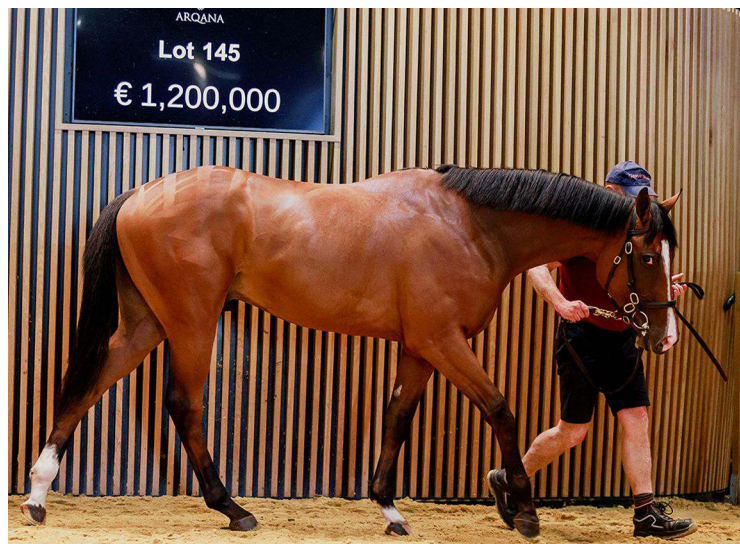
Siyouni's No Retreat topping Arqana's Breeze Up Sale last May Zuzanna Lupa