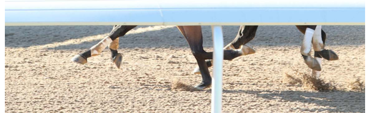
Miracle Worker (pink silks) gets the bob

8th-Sam Houston Race, $33,000, Msw, 2-19, 4/5yo, f/m, 5fT, :58.68, fm, 3/4 length.