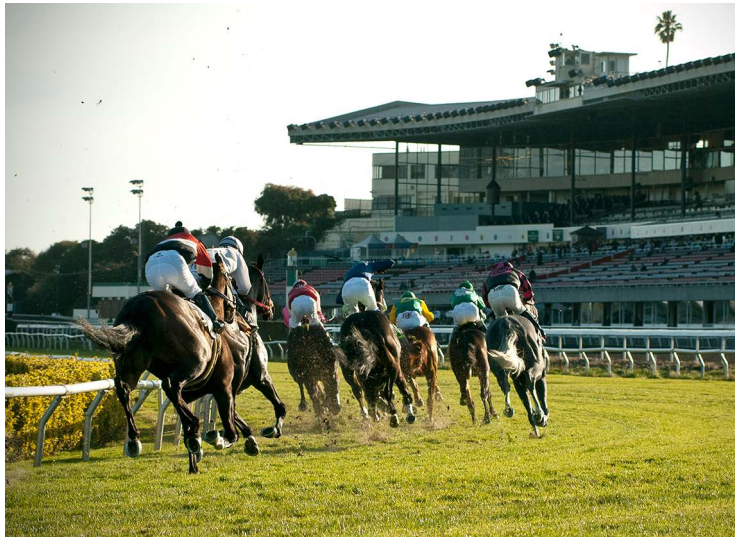
Golden Gate Fields