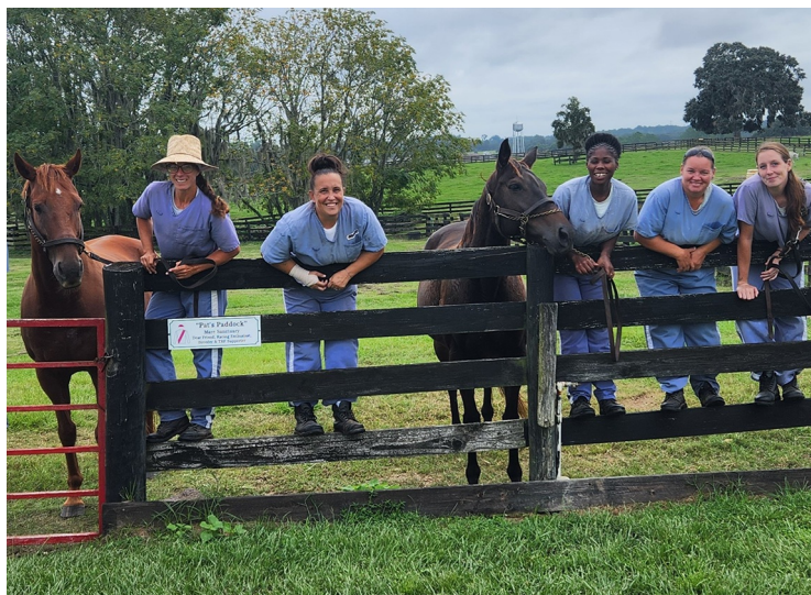
Women in the TRF's Second Chances program at the Lowell Correctional Institute in Ocala, Fl.

didn’t understand the economics of that. Most horse people would have had that same attitude. She explained to me their true value and what these horses do for the inmates.” Cont.