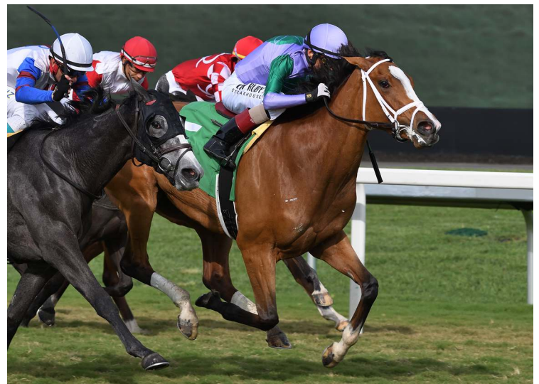
Lady Madonna