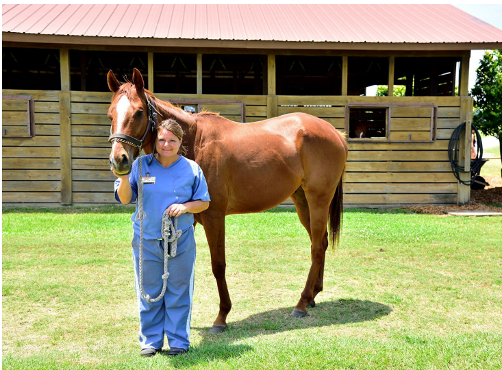
An inmate-caretaker at TRF’s Lowell facility

that the graduates of his program could easily find job at local farms if taught the right skills. The easiest way to find a job would be for them to learn how to prep weanlings and yearlings for the sales.