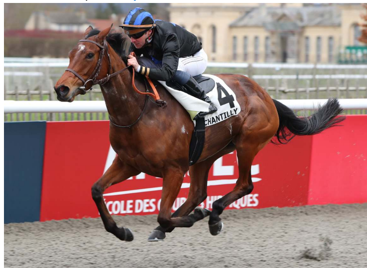
Goa | Scoop Dyga

3rd-Chantilly, €27,000, Mdn, 2-16, 3yo, f, 8f (AWT), 1:37.96, st. GOA (IRE) (f, 3, No Nay Never --Music In My Heart {GB}, by Galileo {Ire}), fifth at Deauville last month, tracked the leading trio early. Sent to the front with 1 1/2 furlongs remaining, the 7-2 second favourite drew away to score by four lengths from Avenue Montaigne (Fr) ( Zarak {Fr} ). The unraced dam, whose first foal was the G2 Wakeful S.-placed Muzyka (Aus) (Danehill Dancer {Ire}), is a full-sister to the G3 Queen's Vase-winning sire Mahler (GB) who was also placed in the G1 St Leger and G1 Melbourne Cup. Cont. p8