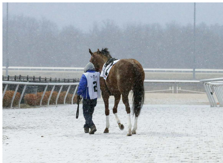
Racing at Turfway Park got rolling Friday night under a blanket of snow

War Front , Lady Madonna, f, 3, o/o Rosalind, by Broken Vow. MSW, 2-16, Gulfstream