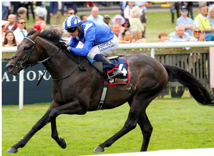
Israr winning the Princess of Wales's

Officials at the Qatar Racing and Equestrian Club announced in early 2023 that the purse for the country's richest Thoroughbred test, the H.H. The Amir Trophy, would be receiving a boost from an even $1-million to $2.5 million. A strong renewal won by the Hong Kong-based former Ballydoyle galloper Russian Emperor (Ire) (Galileo {Ire}) helped to ensure that the 2400-metre contest would be accorded Group 3 status for the 2024 running, and the Amir Trophy has accordingly attracted the most competitive field in the history of the race.