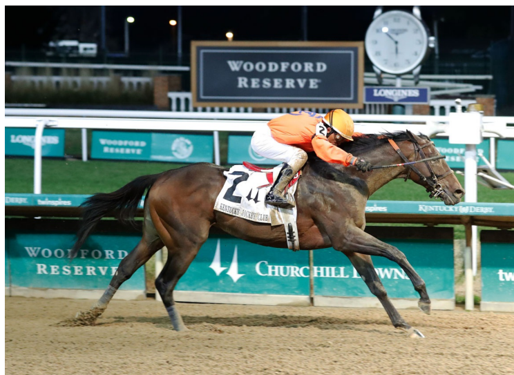
Honor Marie takes down the GII Jockey Club S.