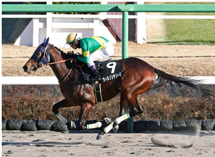
Wilson Tesoro