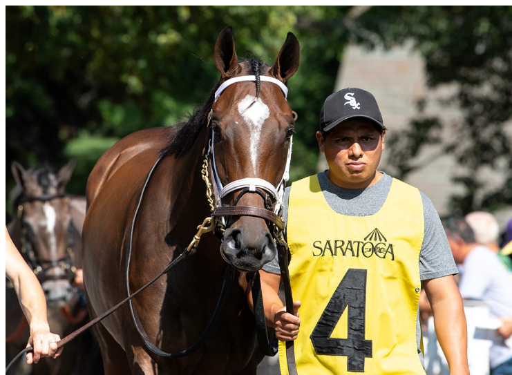
Alpine Princess

The sophomore fillies' counterpart to the Risen Star is named in honor of the romping winner of the 2009 GI Kentucky Oaks and has been an exceptionally productive steppingstone to the first Friday in May. Dating back to 2014, no fewer than four winners of the Rachel Alexandra have gone on to success at Churchill Downs, including ' TDN Rising Star ' Pretty Mischievous (Into Mischief) last year.