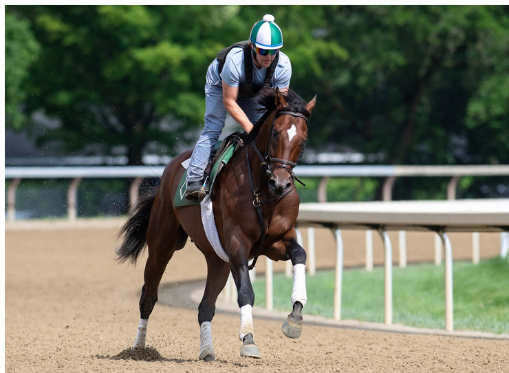
Kentucky-bred Cody's Wish was named 2023 Horse of the Year

The KTBF was implemented in 2005 to ensure the strength of Kentucky’s equine industry by awarding funds to individuals who choose to breed a Thoroughbred mare in Kentucky.