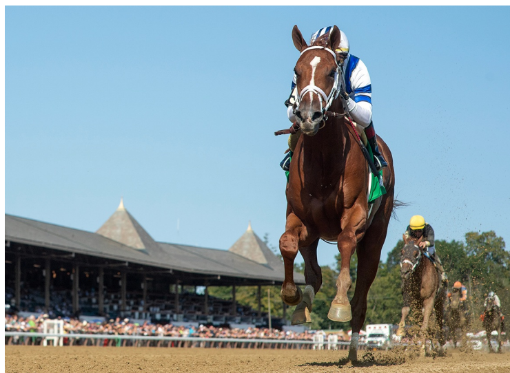
Locked