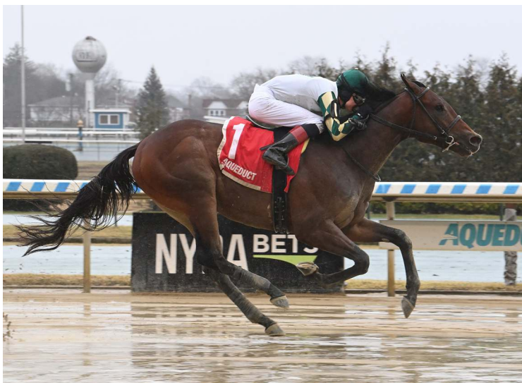
Classic Empire's Capital Idea wins at Aqueduct Sunday Coglianese

West Coast , Sisyphus, g, 3, o/o Back Road Bellamy, by Bellamy Road. MSW, 1-27, Charles Town