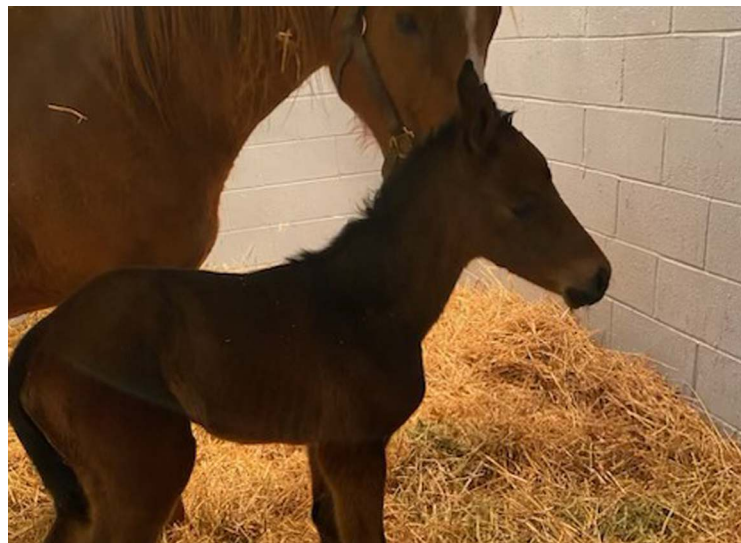
Maxfield --Hot N Hectic filly

Accomplishments: Dam of Carson's Run (Cupid), GISW, $324,529.