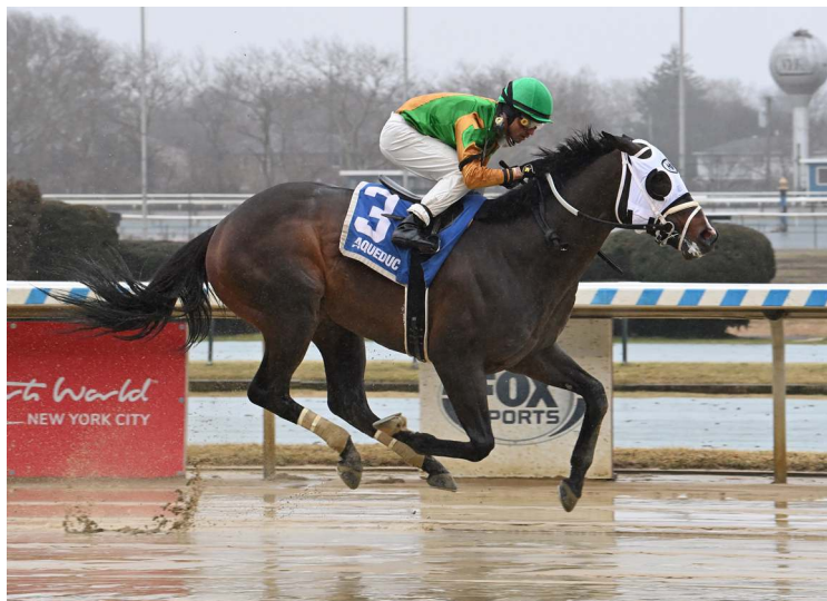
Roknee

Rotknee has proven himself highly effective when facing Empire-bred competition and underscored the point Sunday with an emphatic win in the Big A's Say Florida Sandy S. Taking it to 7-1 chance Disarmed ( Maclean's Music ) through a :23.15 quarter, the 5-year-old poked his head briefly in front but was confronted by Andiamo a Firenze, who held the advantage through a :46.78 half mile.