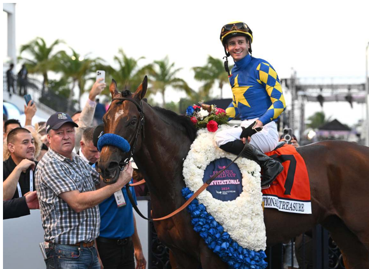
National Treasure | Coglianese