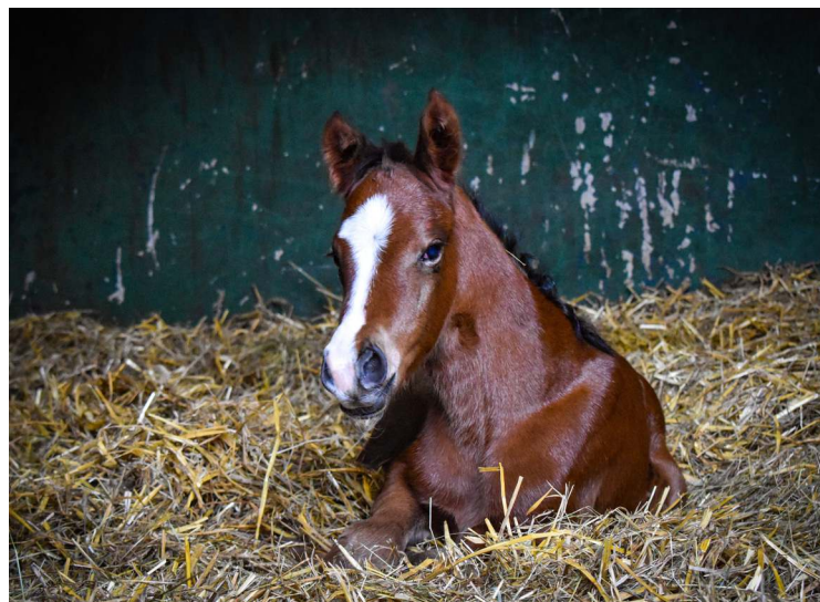
The Thunder Moon filly at Haras de Bourgeauville just hours after her birth