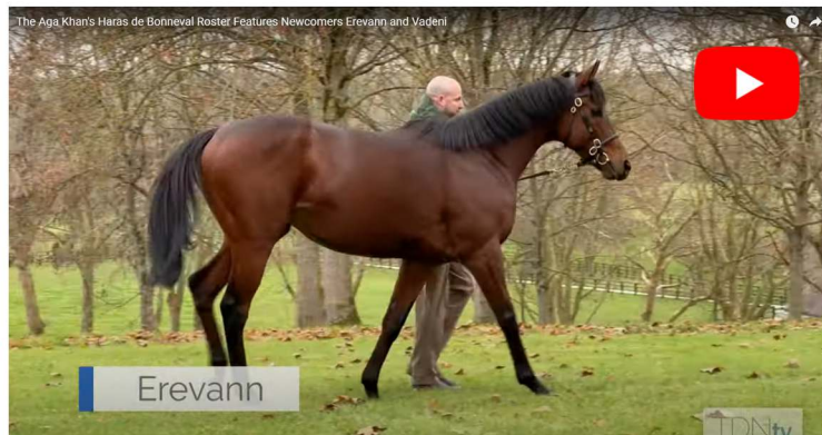
The Aga Khan's Haras de Bonneval Roster Features Newcomers Erevann and Vadeni