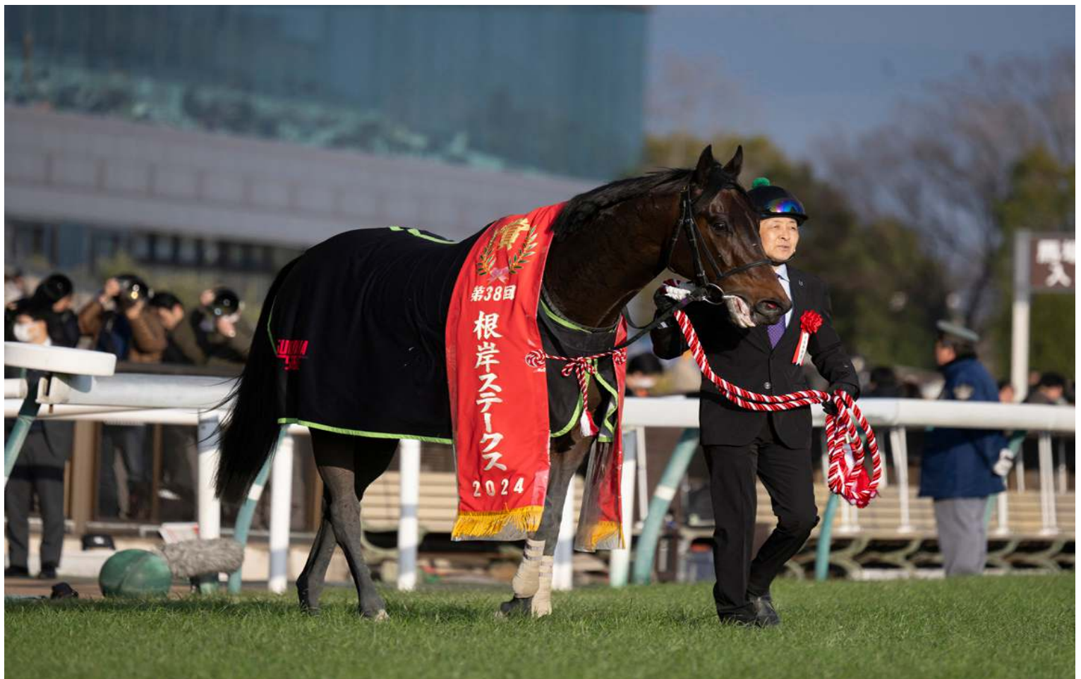
Emperor Wakea has won five of six starts on dirt, and is predicted to be the favorite for the G1 February S.