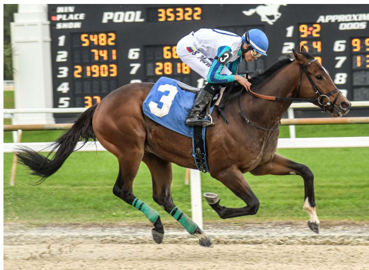
Book'em Danno