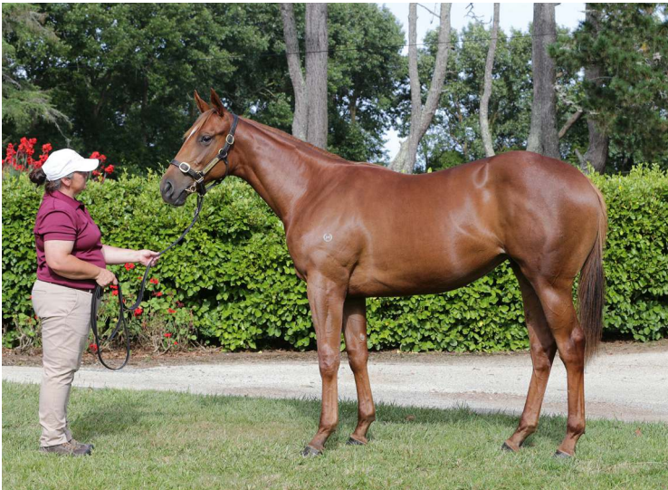
The top lot, a full-sister to champion Prowess