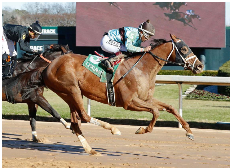
Mr. Keating

5th-Aqueduct, $80,000, Msw, 1-28, 3yo, 1m, 1:40.42, sy, 8 1/4 lengths.