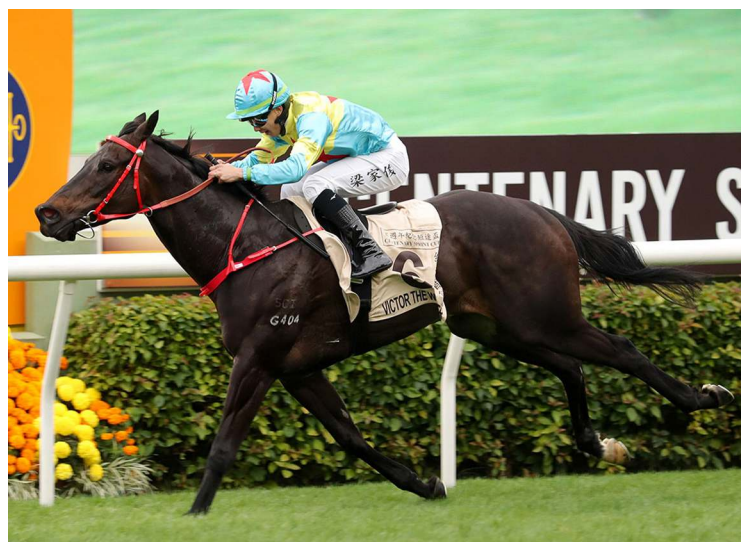
Victor the Winner