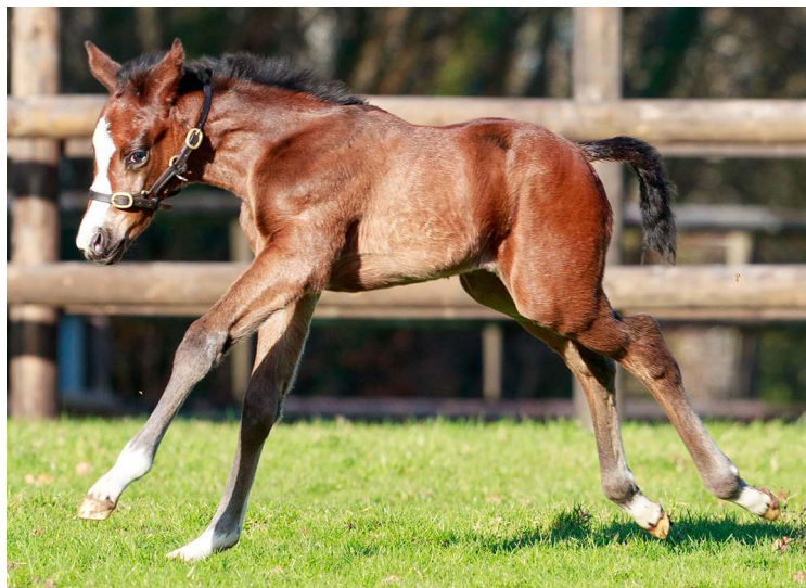
First foal for Baaeed out of Mejthaam