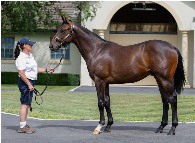
Lot 55 - Zoustar colt | NZ Bloodstock

"I thought it was a good catalogue and you know when you come here the horses have been well raised and I think that's a big benefit for the young horses going forward into their racing careers."