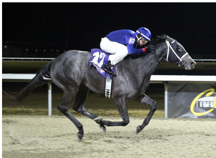
Musical Note