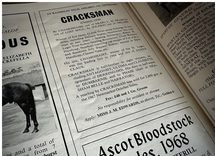
Cracksmán was available for £48 in 1968 according to this Stud And Stable advert