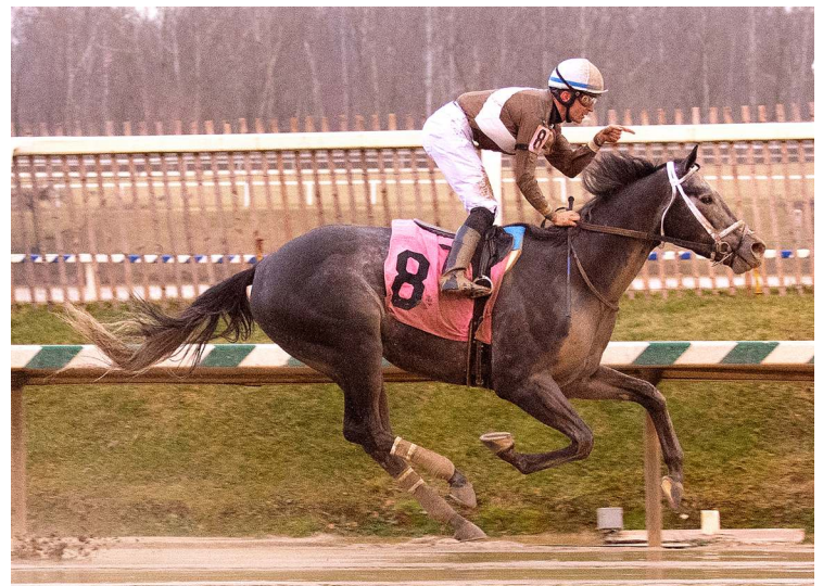
Post Time

Vielsalm has a 2-year-old McKinzie filly and, with no reported foal in 2023, was bred by to Nyquist . Click for the Equibase.com chart or VIDEO , sponsored by FanDuel TV .