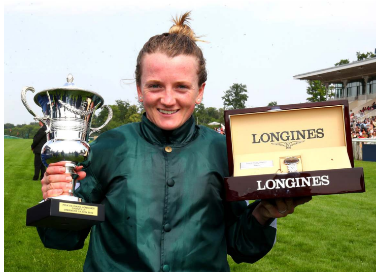
Hollie Doyle after winning the Diane