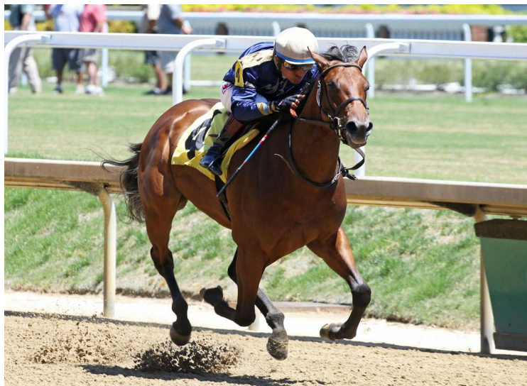
Shoplifter | Coady

Hip 417 - Sells at F-T July HOAA with Paramount Sales Hidden Brook Foaled, Raised & Sold