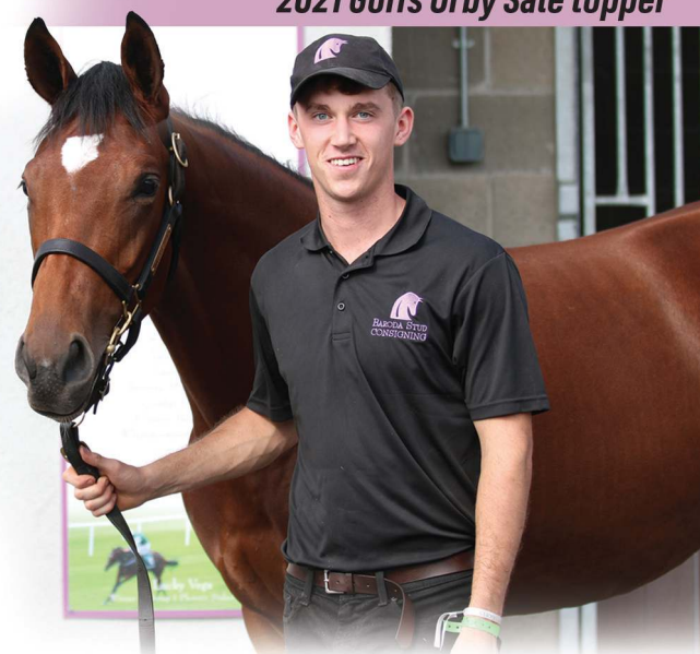
2021 Goffs Orby Sale topper

Yearling graduates include Group 1 winners Lucky Vega, Cloth Of Stars and Marcel