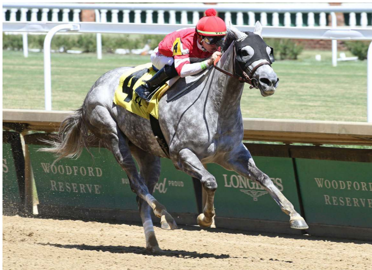
Travel Column

7th-Churchill Downs, $137,337, Alw (NW3$X), Opt. Clm ($80,000), 6-29, 3yo/up, f/m, 7f, 1:21.84, ft, 2 1/2 lengths. TRAVEL COLUMN (f, 4, Frosted --Swingit {MSW, $345,353}, by Victory Gallop) made the first start of her 4-year-old season Wednesday following a successful 3-year-old campaign that saw her just miss by a neck to MGISW Clairiere ( Curlin ) in the GII Rachel Alexandra S. before turning the tables on that rival in the GII Fair Grounds Oaks next time. Using Lasix for the first time, the 3-2 second choice, a $850,000 FTSAUG yearling purchase, tucked in behind favorite Lovemesomeme ( Paynter ) up the backstretch before making a bid around the far turn. She held on to a narrow lead into the final sixteenth and had enough left to hold off a closing Thundering Creed (Jimmy Creed) and win by 2 1/2 lengths. A half-sister to Neolithic (Harlan's Holiday), GISP-UAE, MGISP-USA, $2,278,028, Travel Column has a 2-year-old half-brother by City of Light and a foal half-sister by Uncle Mo . Sales History: $850,000 Ylg '19 FTSAUG. Lifetime Record: MGSW, 8-4-1-1, $640,028. Click for the Equibase.com chart or VIDEO, sponsored by TVG.