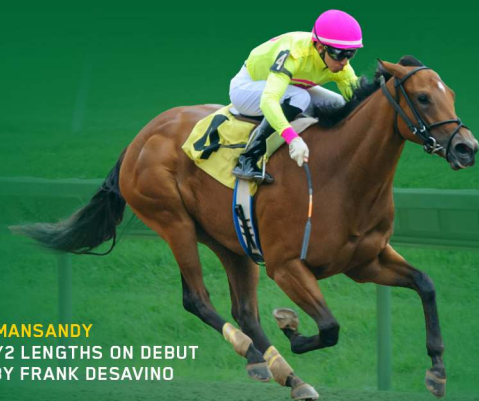
MUSICMANSANDY BY 4 1/2 LENGTHS ON DEBUT BRED BY FRANK DESAVINO