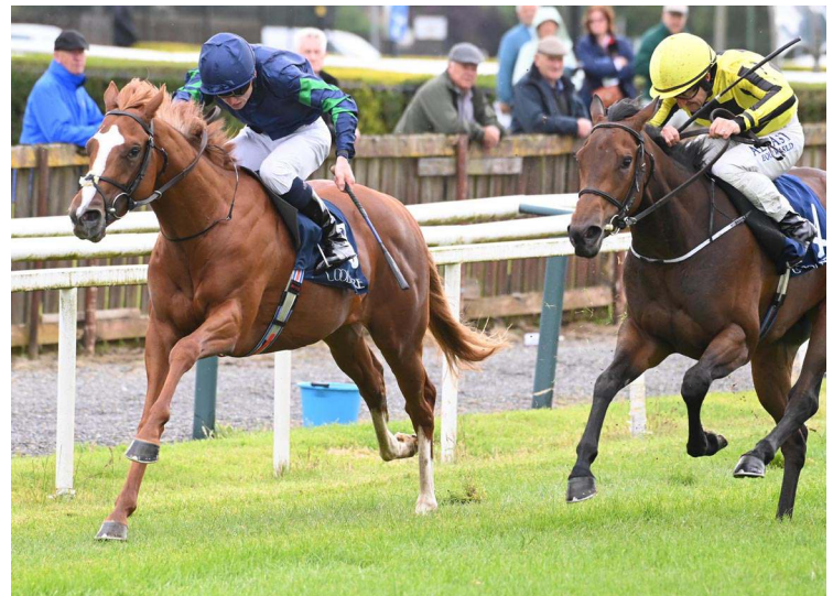
Wodao (I)