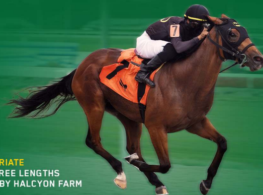
TALTARIATE BY THREE LENGTHS BRED BY HALCYON FARM