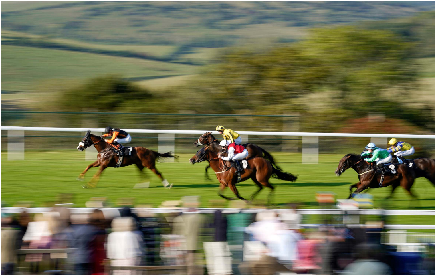
Raasel, with Adam Farragher aboard, wins at Goodwood last September

CD: Well-handicapped horses that we think can progress; horses that we believe have an upside, to whatever level we think that will be. Cont. p6