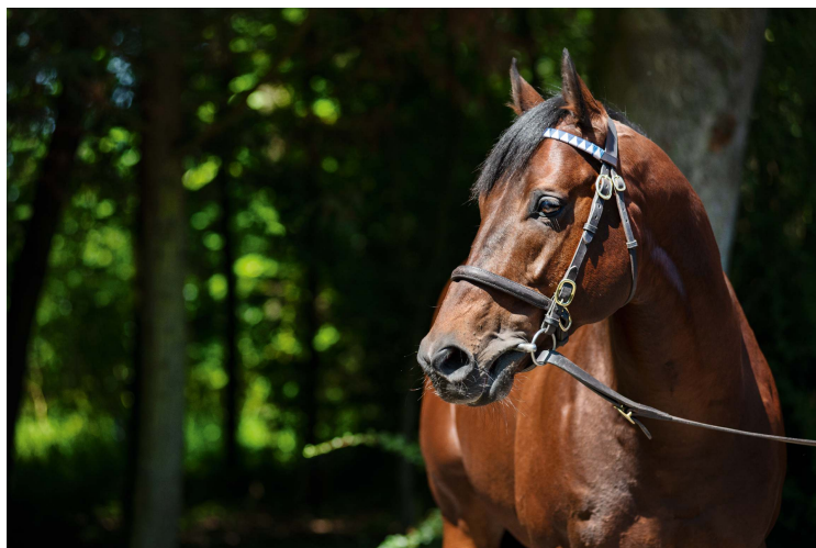
Harry Angel | Darley

Sioux Nation (Scat Daddy), Coolmore Stud 163 foals of racing age/14 winners/0 black-type winners 1-BELLEWSTOWN, 8f, All Things Nice (Ire) €55,000 Goffs Orby Yearling Sale 2021