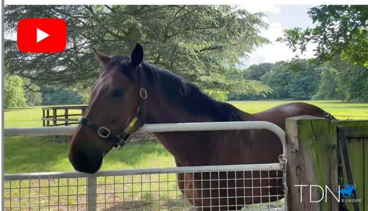
Battaash Loving Life In A Slower Lane