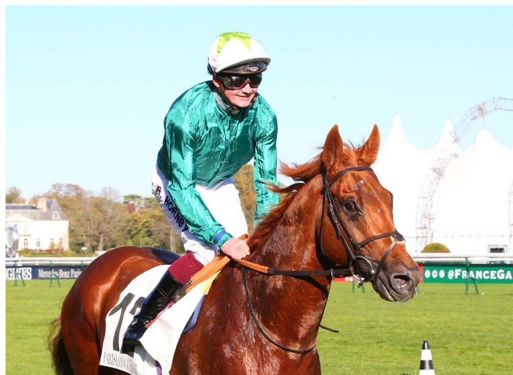
Scope | Scoop Dyga