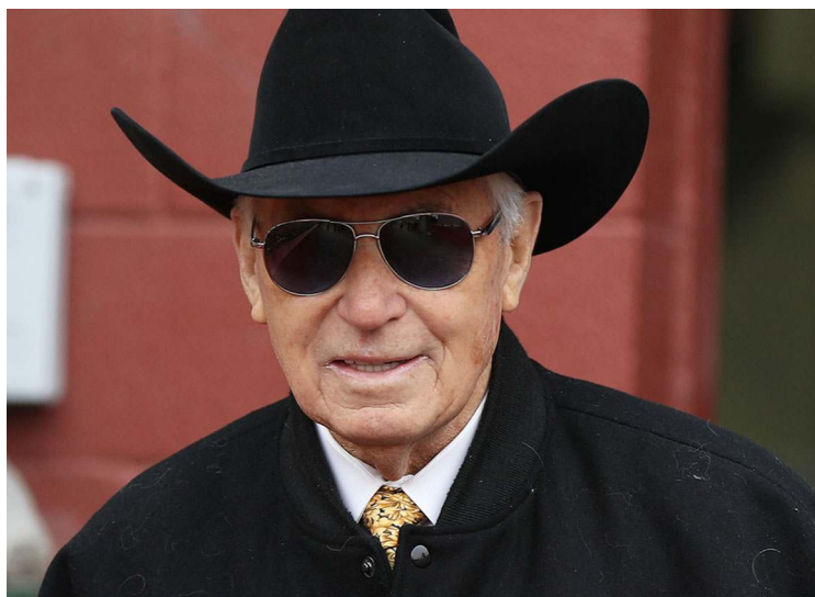
D. Wayne Lukas