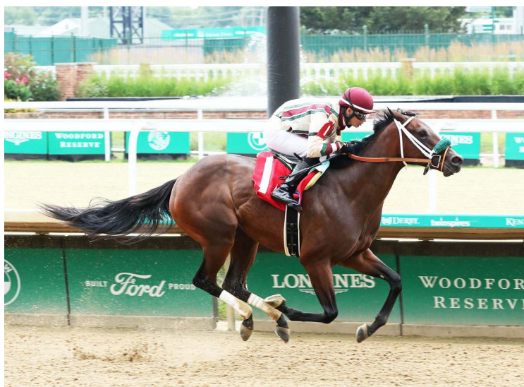
Summer Promise | Coady