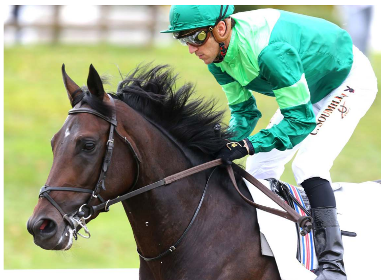
Stone Age

O'Brien, who won his sixth Eclipse with St Mark's Basilica (Fr) ( Siyouni {Fr} ) 12 months ago, will not be represented in this year's renewal.