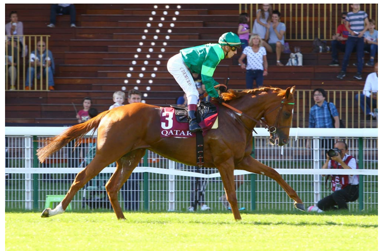
Sottsass returns in the Prix d'Harcourt on Monday