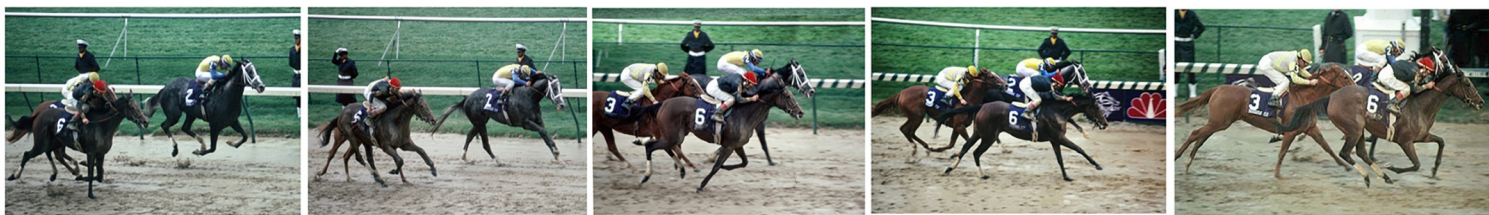
Personal Ensign catches Winning Colors at the wire in the 1988 Breeders' Cup Distaff.