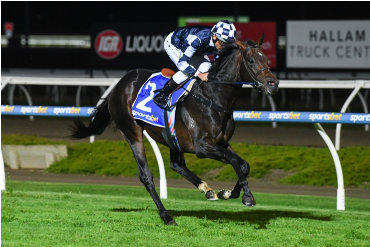
Russian Camelot winning on Apr. 9