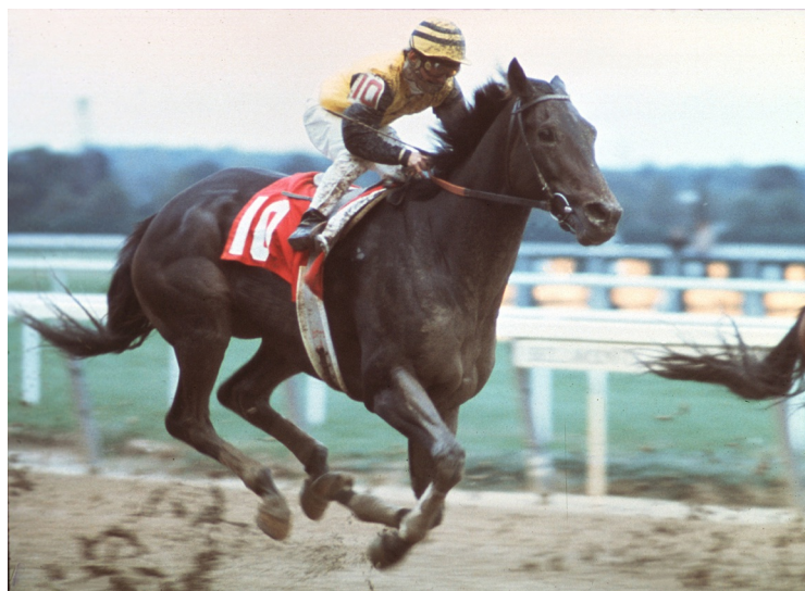
Forego drifts wide and hits the wire just in time to win the 1976 Marlboro Cup, shot with a single frame manual focus Minolta

HR: The changing of the technology from manual focus to auto-focus, and from manual advancing of the film one frame at a time to automatic, rapid advancing, were very big in the 1970s. In the 1971 Belmont S., Canonero II was going for the Triple Crown and Pass Catcher beat him. But the jockey of Pass Catcher dropped his whip and somebody got a shot. That was an award-winning photo. He was only able to get that by either getting lucky or by being able to advance the camera rapidly enough to take multiple shots. If you don't have to manage the technology because the technology manages itself due to the automation, that is an advancement that I am all for. The craft has nothing to do with technology. Real craft has to do with vision.