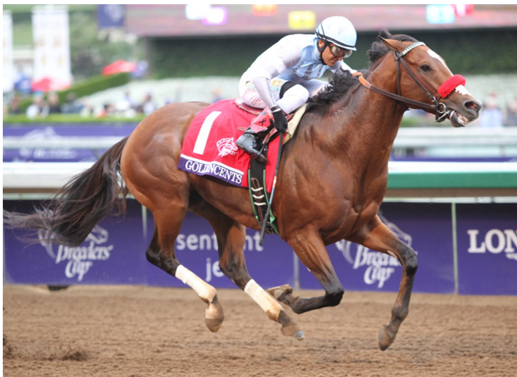
Goldcents | Horsephotos