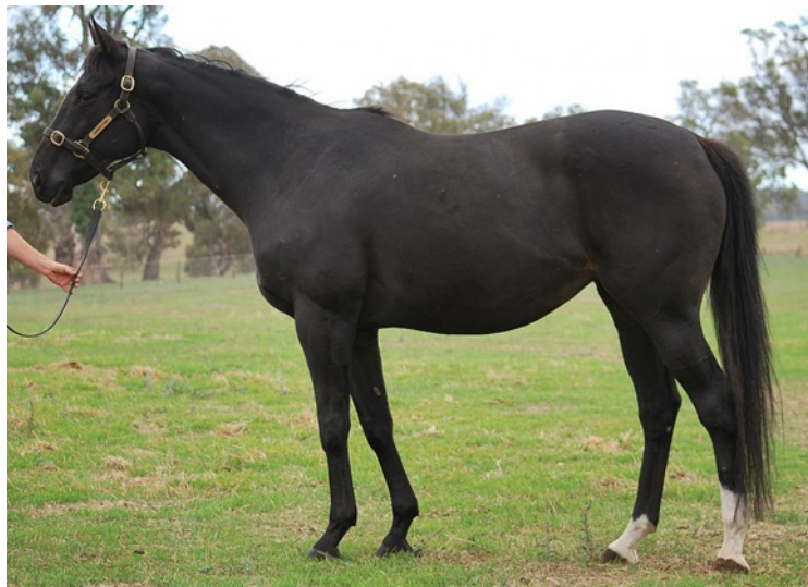
Empress Ali