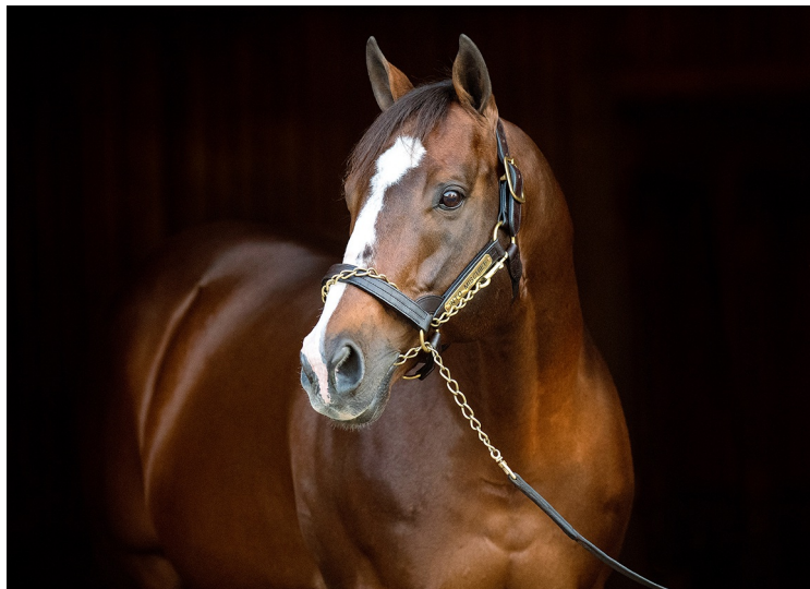
Into Mischief

Into Mischief was still available at $35,000 when Goldencents joined him at Spendthrift, but his giddy elevation since—to $175,000 this year—has quickly vindicated the farm's commitment to his first star. For those of their clients left behind by Into Mischief, there would still be an affordable alternative. Initially offered at $15,000, Goldencents had eased to $12,500 by the time his first crop reached the track in 2018. By My Standards was not among the 29 more precocious animals who advertised their sire in the winner's circle that year—putting Goldencents clear top of the intake, by winners; and by earnings behind only studmate Cross Traffic, who was boosted by GI Breeders' Cup Fillies' Juvenile winner Jaywalk.