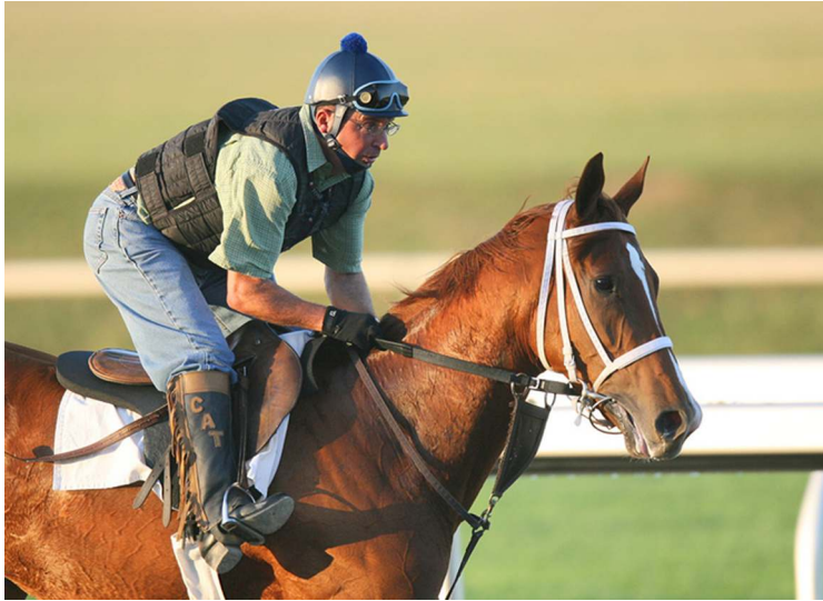
Dreaming of Anna