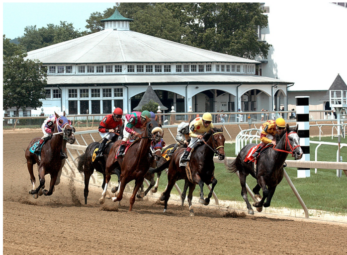
Laurel Park | Maryland Jockey Club

stages after racing begins again, only Maryland-based horses will be allowed to run. No ship-ins will be permitted from out of state and jockeys who are not Maryland regulars will not be permitted to ride. With claiming horses making their first starts since the shut down began at Laurel March 15, owners may waive the claiming price, as long as the horse isn't dropping in class. Should a horse start in a $20,000 claimer after last racing in a $20,000 claimer, they will be eligible for the waiver rule. Bonus payments for Maryland-breds may be temporarily discontinued once the meet resumes.