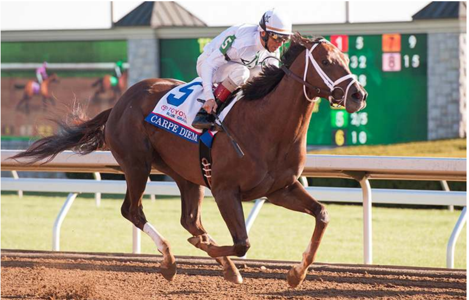
Carpe Diem, sire of new 'TDN Rising Star' Scolding at Oaklawn Saturday, will be represented by Gogo Shoes at Tampa Bay Downs Wednesday

ORATORY , Speaker Van, g, 4, o/o Embers Glowing, by Woodman. ALW, 5-5, Will Rogers