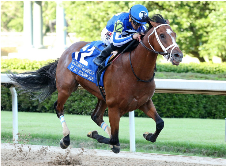
By My Standards | Coady