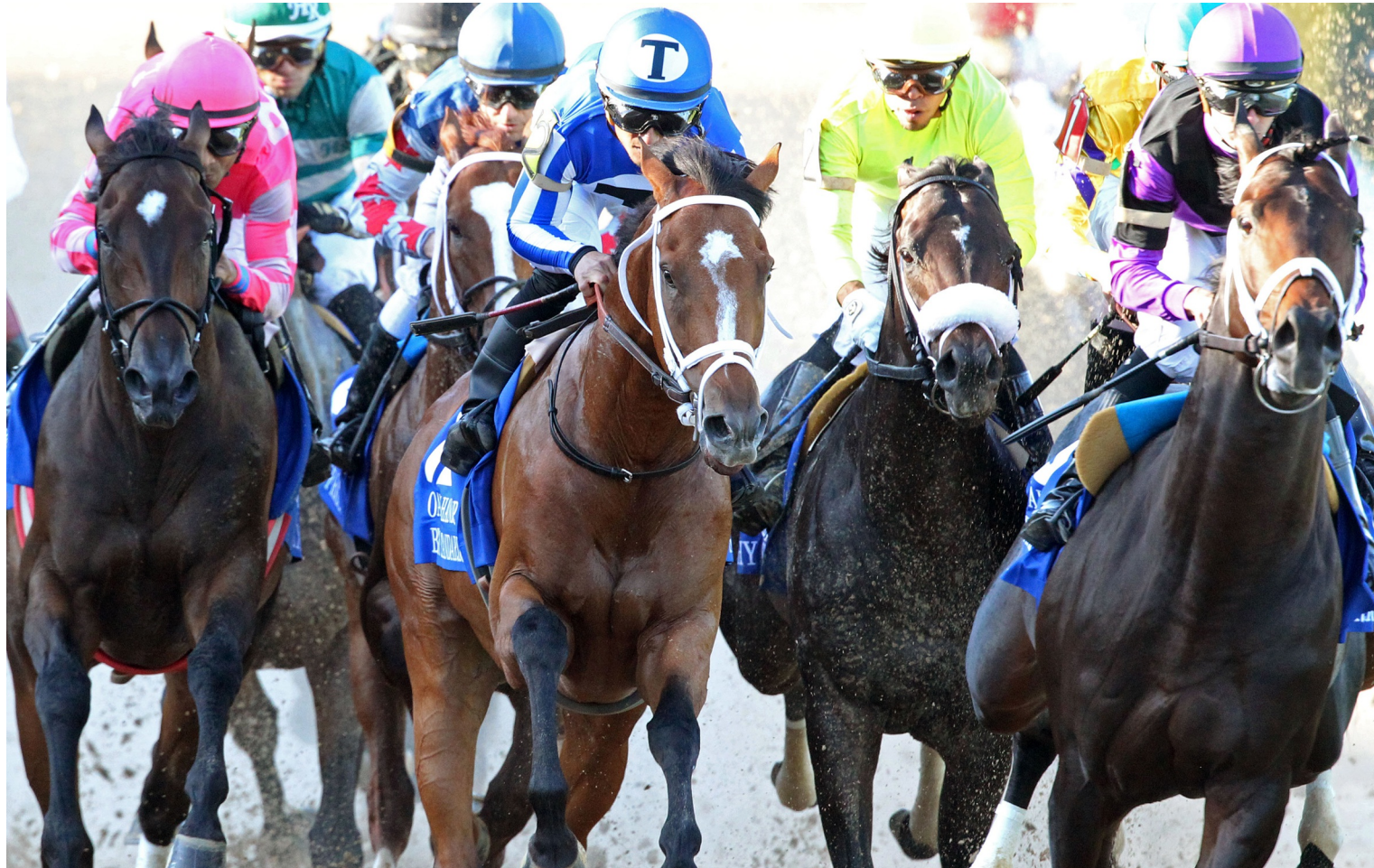
By My Standards (center)

This turned out to be Mr. Money, who went on that lucrative streak for the Calhoun barn last summer, winning four consecutive Grade IIIs and only foiled by a neck in the GI Pennsylvania Derby. His endeavors helped Goldencents see off Cairo Prince as leading second-crop sire by both winners and prize money (albeit the Airdrie sire, along with WinStar's underrated Fed Biz, scored higher in black-type winners/performers).