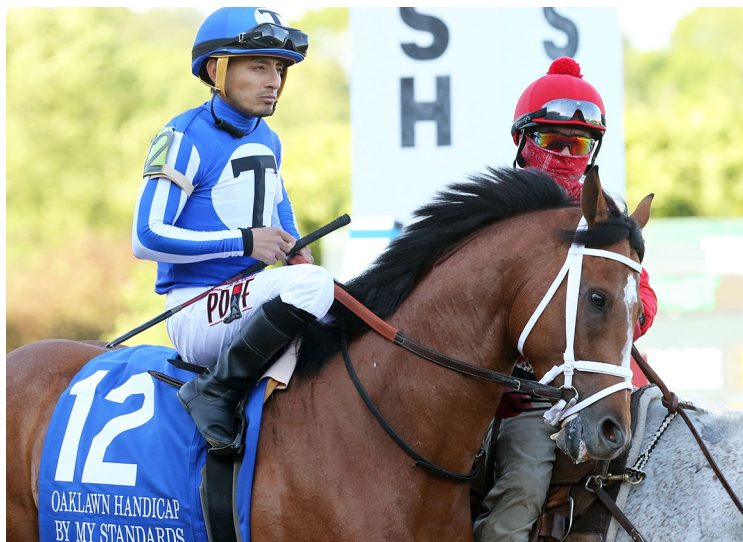
By My Standards

In the meantime, unfortunately, By My Standards himself was derailed just as he began to thrive. He had followed up his maiden success with a breakout score in the GII Louisiana Derby, but then finished midfield in the GI Kentucky Derby and disappeared for the rest of the year with nagging hoof issues. After a stylish return in a Fair Grounds allowance in February, a decisive success in the GII New Orleans Classic set him up for last--where he clocked a career-best Beyer of 102 (fastest time for the race since Medaglia d'Oro in 2003) and sealed millionaire status.