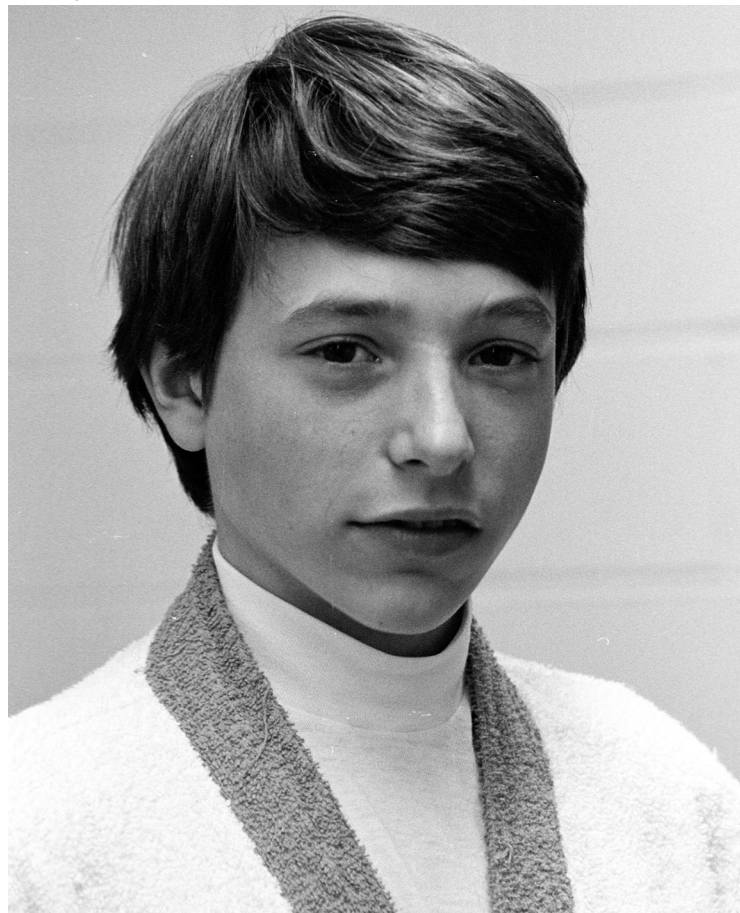
Steve Cauthen at Aqueduct in 1978