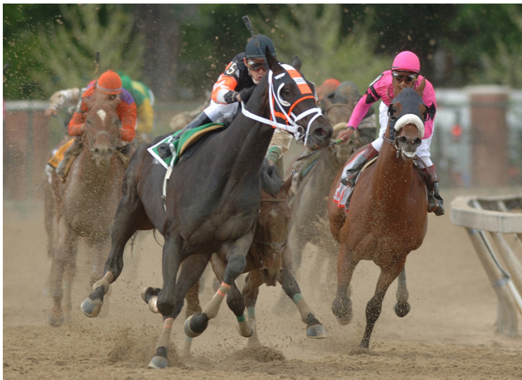
After colliding with Scrappy T at the top of the stretch, Afleet Alex goes on to win the 2005 Preakness.