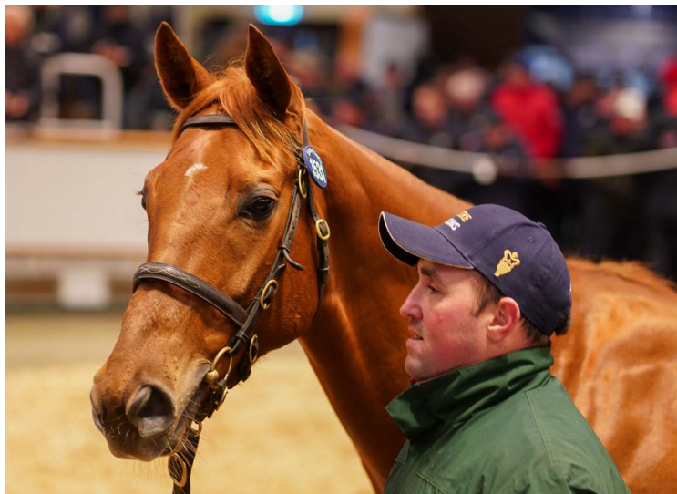
Lot 1531 | Tattersalls

That great family has been a cornerstone of the Wildenstein family's breeding operation for generations. Auhoritaire's dam is the champion racemare Aquarelliste (Fr) (Danehill), whose Group 1 wins include the Prix de Diane, while her offspring include the stakes winners Ame Bleue (GB) (Dubawi {Ire}) and Any Time Soon (Ire) (Camelot {GB}).