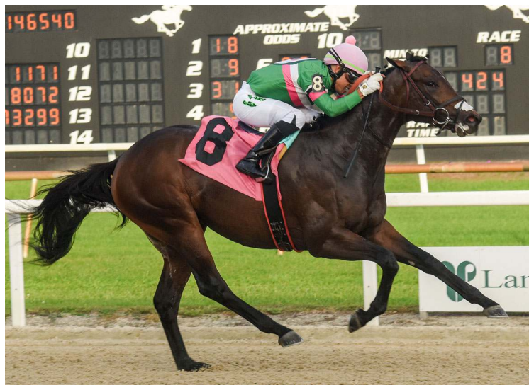
Patriot Spirit became the newest stakes winner for WinStar's Constitution in the Inaugural S.

FOR THE WEEK ENDING DECEMBER 3, 2023 ACTIVE NORTH AMERICAN-BASED STALLIONS