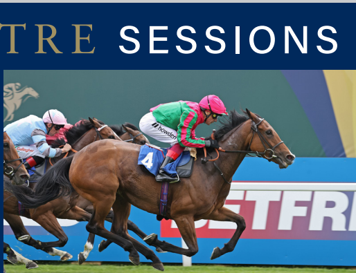
LOT 1776 PROSPEROUS VOYAGE 2022 Winner: Falmouth Stakes, Gr. 1, 2nd 1000 Guineas, Gr. 1