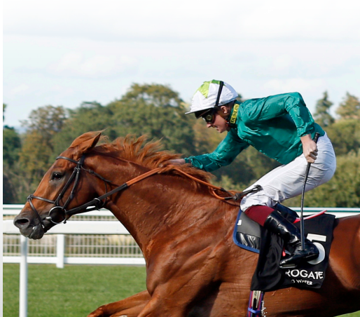
SCOPE 2021 Winner: Prix Royal Oak, Gr. 1