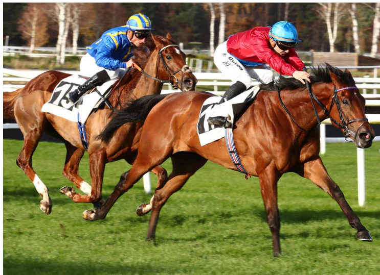
Run Zarak Run was a latest second in the Listed Prix Ceres