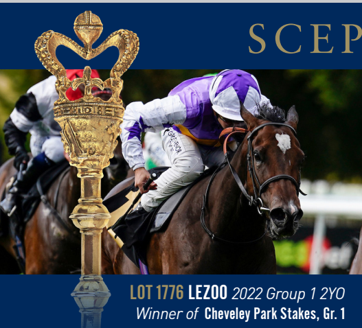
LOT 1776 LEZOO 2022 Group 1 2YO Winner of Cheveley Park Stakes, Gr. 1