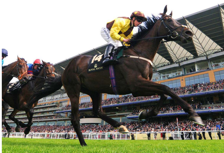
Missunited in the 2014 Gold Cup

Wholeness (Ire) , f, 3, Lope de Vega (Ire) --Missunited (Ire) (Hwt. Older Mare-Ire at 14f+, GSW & G1SP-Eng, MSW-Ire, G1SP-Fr, $698,672), by Golan (Ire). Chukyo, 12-2, Cond., 2000mT, 2:00. Lifetime Record: 3-2-1-0, $111,449. O-Godolphin; B-Mrs V B Hutch & Lope de Vega Syndicate; T-Hideaki Fujiwara. *1/2 to Eagles By Day (Ire) ( Sea The Stars {Ire} ), GSW-Eng, $123,959. **200,000gns Wlg '20 TATDEF.