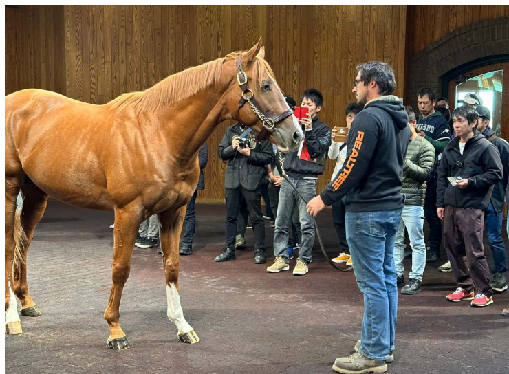
JRA representatives inspect Two Phil's at WinStar

The son of Hard Spun came on WinStar's radar after his dominating score in the GIII Jeff Ruby Steaks, where his 5 1/2 Ragozin figure ranked him at the top of the list of Kentucky Derby contenders.