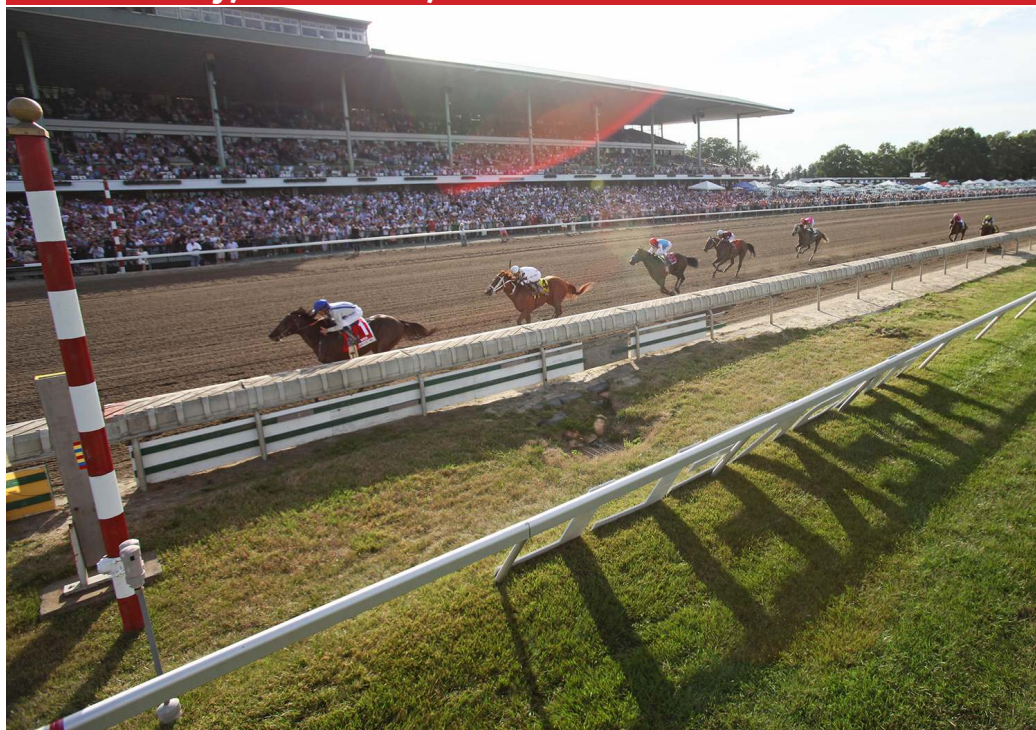
2023 in photos: July 22. Geaux Rocket Ride (Candy Ride {Arg}) wins the GI Haskell S. at Monmouth Park.