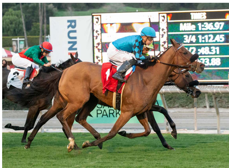
Callisto Star's Grade I-winning daughter Rhea Moon