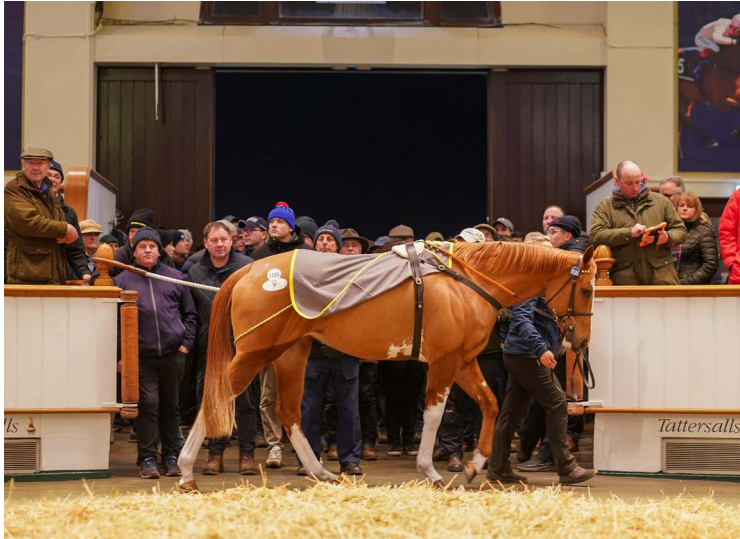
Lot 1535 | Tattersalls