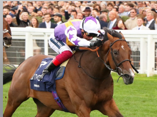
KINROSS 2022 Winner: Prix De La Foret, Gr. 1, British Champions Sprint Stakes, Gr. 1

Saracen are incredibly proud to have supported Ralph Beckett and his team at Kimpton Down Stables since 2003.