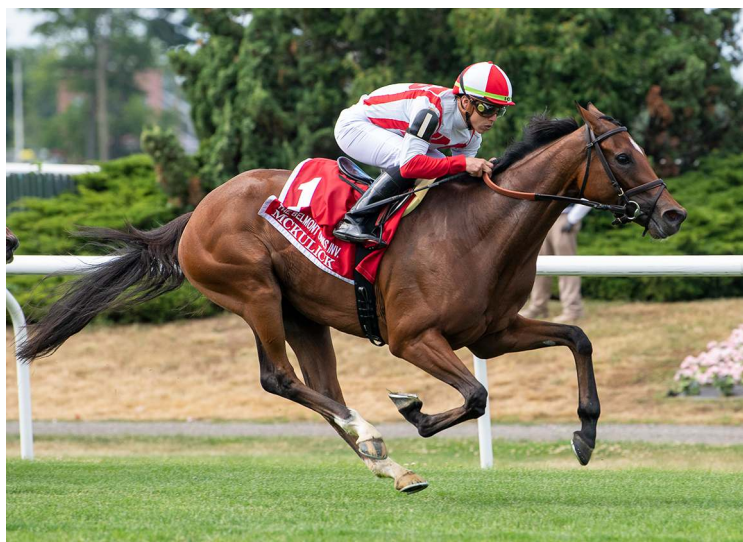
McKulick winning the GI Belmont Oaks