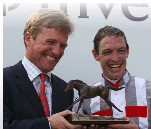
TALENT and SECRET GESTURE 2013 Historic 1 - 2: Epsom Oaks, Gr.1