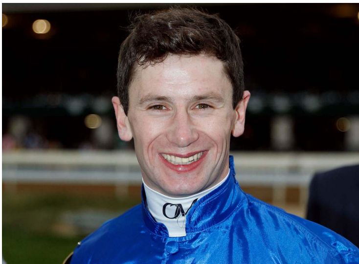
Oisín Murphy

"At Gulfstream, most of the important races are on dirt. There will be ample opportunities to get plenty of rides and ride over what is an important surface. It's important for me to show that I can win races over all surfaces."