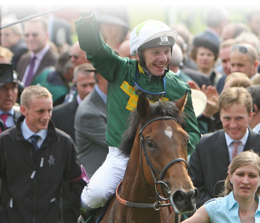
LOOK HERE 2008 Winner: Epsom Oaks, Gr. 1