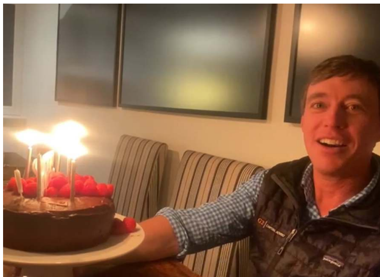
Case Clay celebrating his "birthday" on April 8...not August 4.

As 2023 draws to a close, the TDN is asking industry members what their favorite moment of the year was. Send your favorite moment to suefinley@thetdn.com