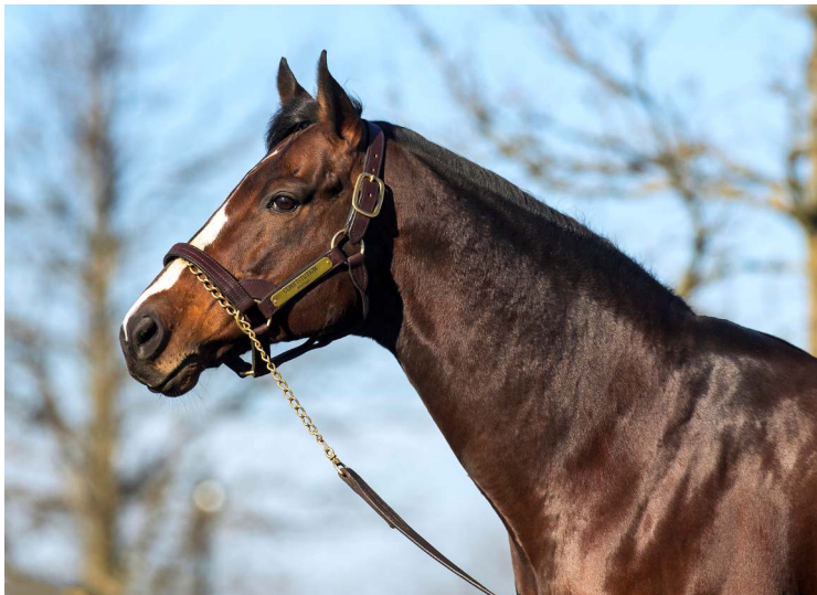
Constitution's Miranda Rights won Sunday at Del Mar

10th-Zia, $55,000, Alw, 12-4, (NW2X), 3yo/up, f/m, 5 1/2f, 1:01.99, ft, nose.