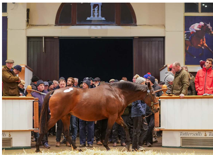
Callisto Star: shot the lights out on 675,000gns for Ballybin Stud | Tattersalls