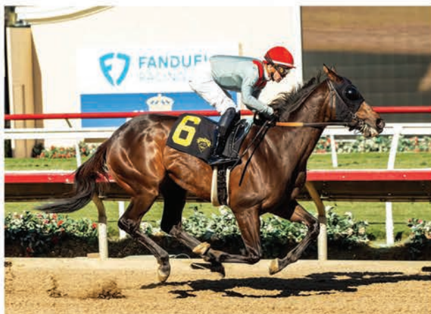
Llorona | Benoit