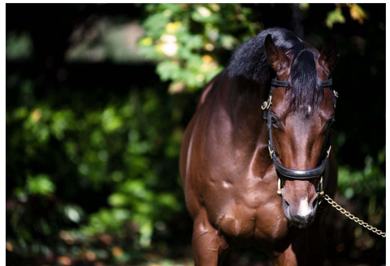
Calyx has a runner in France | Coolmore

€18,000 Tattersalls Ireland Goresbridge Breeze Up 2023