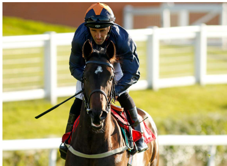
Blue Storm is one of 124 lots set to sell

Listed winner Iconic Moment (Ire) (Harry Angel {Ire}) (lot 112) is one of 124 horses catalogued for the Tattersalls November Sale on Thursday, Nov. 9.