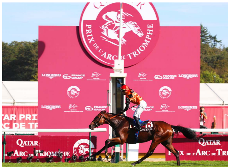
Ace Impact | Scoop Dyga

Beaumont is also home to the dual Group 1 winner Sealiway (Fr) whose pedigree received a further boost over the weekend when his full-brother Sunway (Fr) (Galiway {GB}) won the G1 Critérium International (Gr1). Sealiway was the busiest stallion in France this year, covering 166 mares in his first book, and will remain at the same fee of €12,000 in 2024.