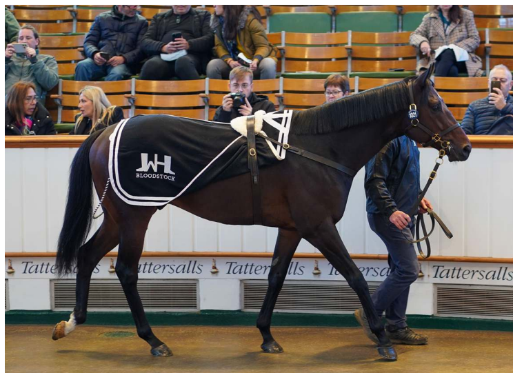
Royal Patronage | Tattersalls