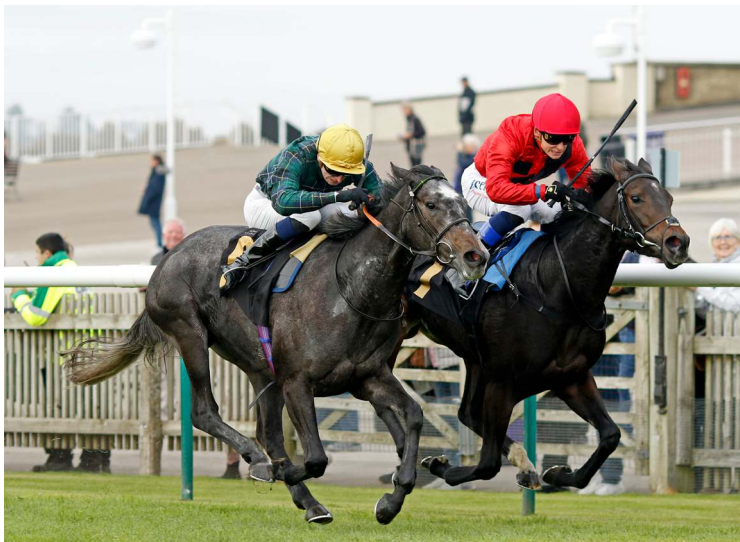
Shemozzle (left)