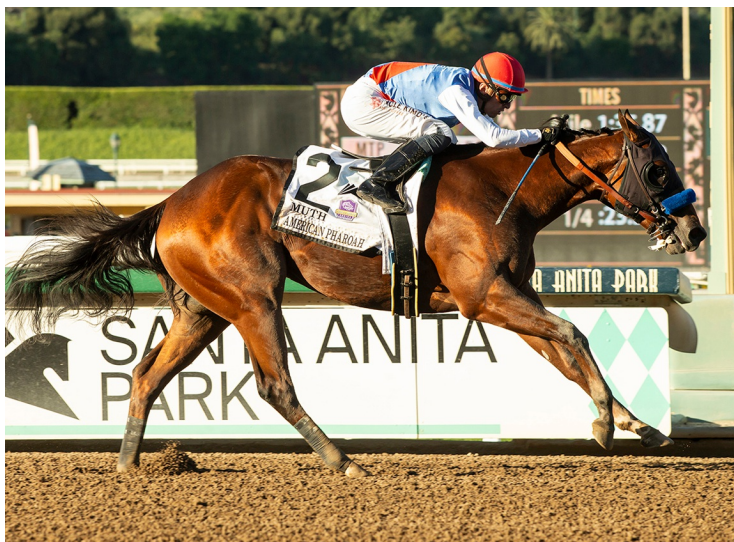
Muth | Benoit

Friday's finale, the GI Prevagen Breeders' Juvenile Turf, has drawn 17 pre-entries, including 'TDN Rising Star' Agate Road (Quality Road) and GISW Carson's Run (Cupid). Cont.