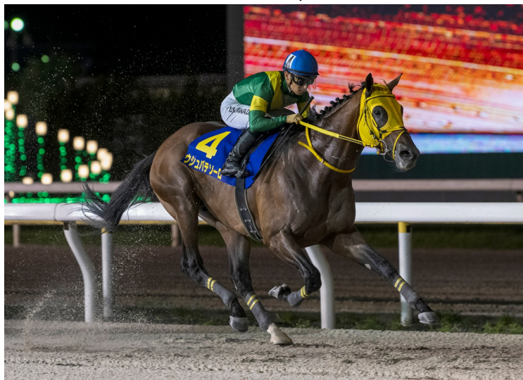
Ushba Tesoro