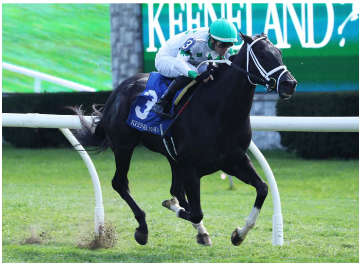
Just Say When

6th-Keeneland, $110,000, Alw, 10-25, (NW2L), 2yo, f, 1 1/16mT, 1:45.51, fm, 2 1/4 lengths.