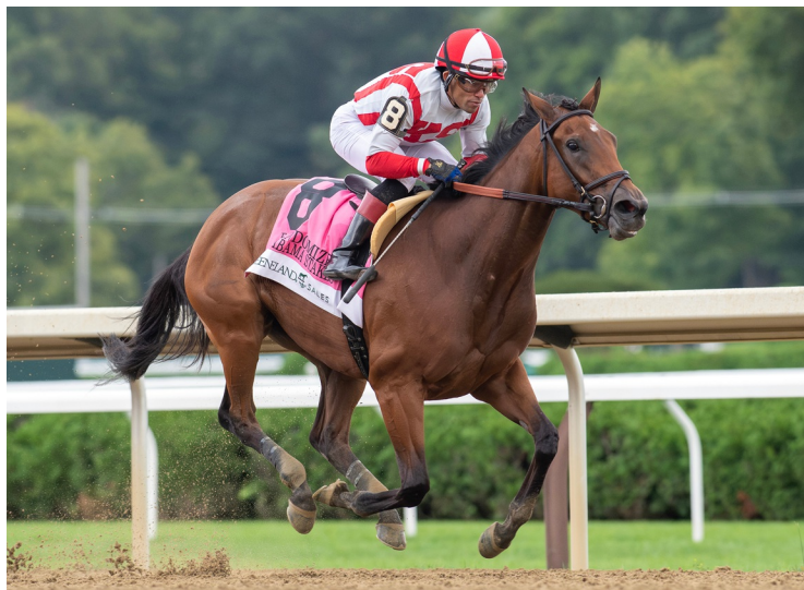
Randomized