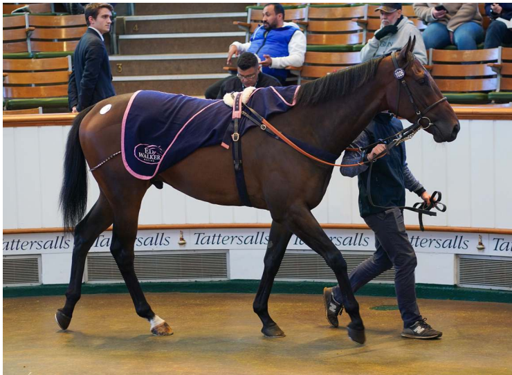
Wednesday's topper: Dark Trooper