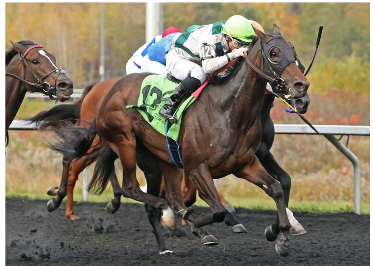
Viareggio

From the family of G1SW Wannabe Grand (Ire) (Danehill), Viareggio is a half-sister to the 3-year-old gelding Just Bring It (Ire) (Harry Angel {Ire}), a handicap winner at Salisbury last month, a yearling filly by Footstepsinthesand (GB) and a Space Blues (Ire) filly that is cataloged as lot 658 at the upcoming Tattersalls December Foal Sale. Click for the Equibase.com chart or VIDEO, sponsored by FanDuel TV.