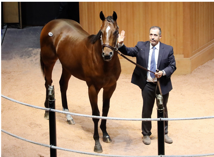
Hip 1194 | Fasig-Tipton

The mare's first foal, a filly by Speightstown , sold for $160,000 at the 2021 Fasig-Tipton October sale. She also produced a colt by Munnings who sold for $130,000 as a weanling at the 2021 Keeneland November sale.