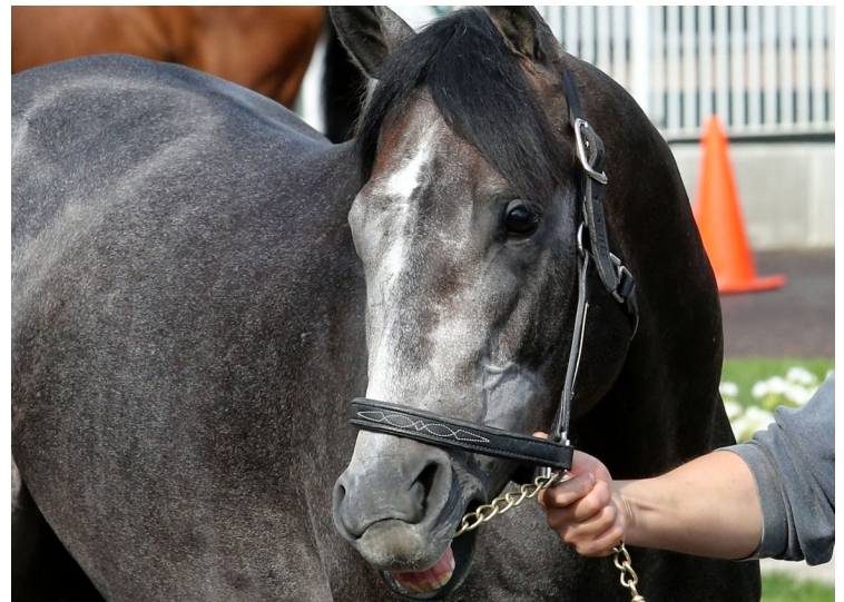
Roadster

Ocala Stud released their 2024 stud fees for its roster of nine stallions for the upcoming breeding season, led by GI Santa Anita Derby winner Roadster ( Quality Road ), who will stand his second season at stud for $7,500 S&N, the farm said in a release early Wednesday morning.