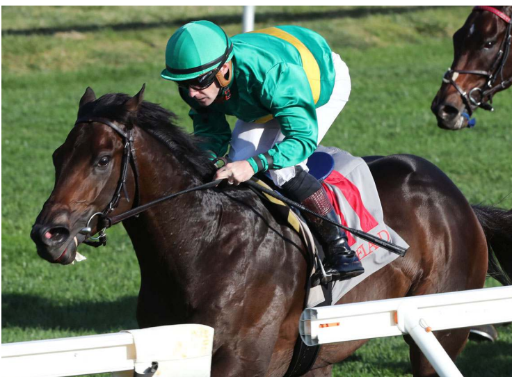
Weyhill Road | Coady

6th-Horseshoe Indianapolis, $34,000, Msw, 10-25, 2yo, 1m, 1:39.05, ft, 3/4 length.