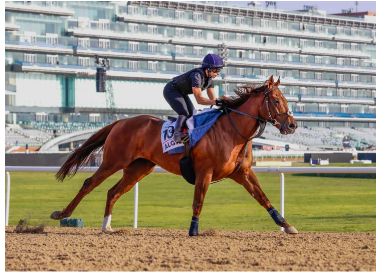
Algiers

Algiers (Ire) (Shamardal), runner-up in the G1 Dubai World Cup last March, will contest the GI Breeders' Cup Mile rather than the 10-furlong GI Classic, according to the gelding's connections.