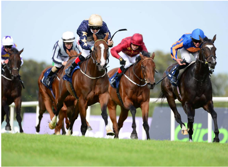
Champers Elysees | Tattersalls Ireland

The 224-lot catalogue for the Nov. 17 Sapphire Sale has been released and is currently online . Comprised of flat yearlings, foals and mares, the sale begins at 10:30 a.m. A hard copy of the sale will be released in the coming days.