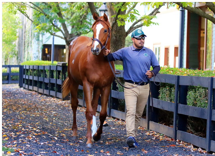
Hip 1023, the Justify topper