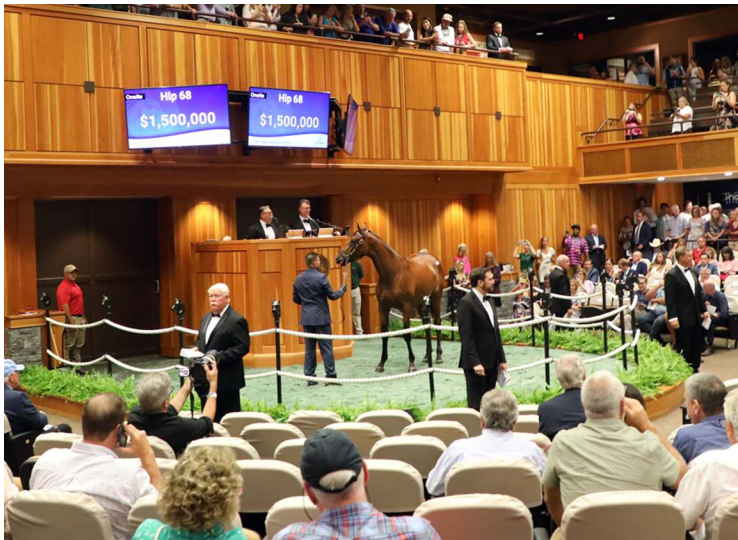
Stop the Press (Hip 68) | Fasig-Tipton