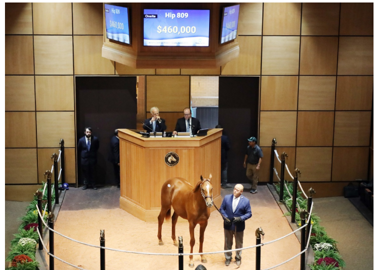
Hip 809