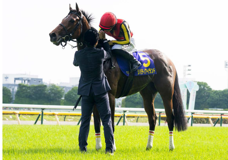
Liberty Island is one of 68 Japanese entries for the HKIR

Aidan O'Brien has 13 horses under his care that are among the HKIR entries, including G1 St Leger hero Continuous (Jpn) (Heart's Cry {Jpn}), who is also penciled in for a start in the Japan Cup and has entries for both the Cup and the Vase. Luxembourg (Ire) ( Camelot {GB} ) and Cox Plate entrant Victoria Road (Ire) ( Saxon Warrior {Jpn} ) are also possible for the Cup, while Paddington (GB) ( Siyouni {Fr} ) may try to regroup in the G1 Longines Hong Kong Mile after struggling in the bottomless ground on Champion Day at Ascot Oct. 21.