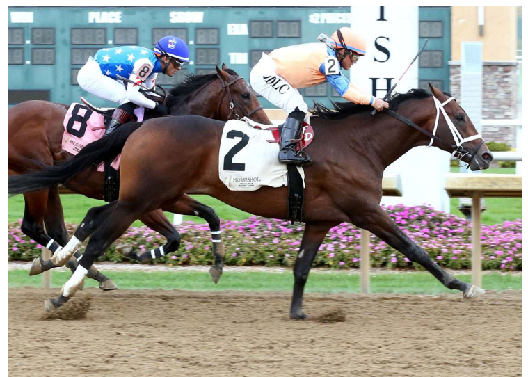
Blown Cover | Coady

FIND US ON FACEBOOK www.facebook.com/thoroughbreddailynews