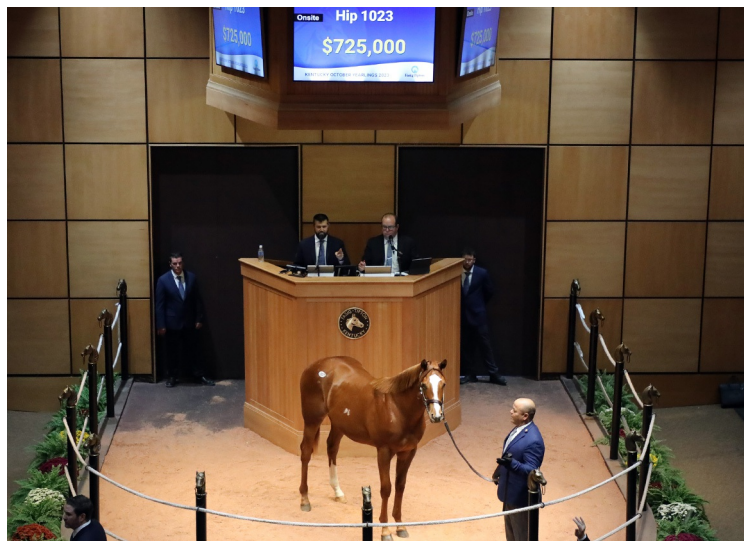
Hip 1023 | Fasig-Tipton

Browning continued: "It is very encouraging to be in the same neighborhood. It's a healthy marketplace in terms of people wanting to own horses, but they demand quality."