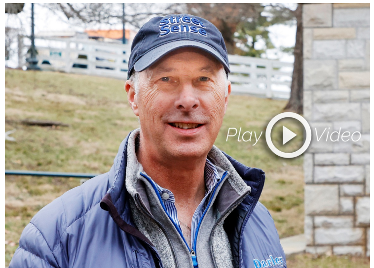
Click to watch the podcast