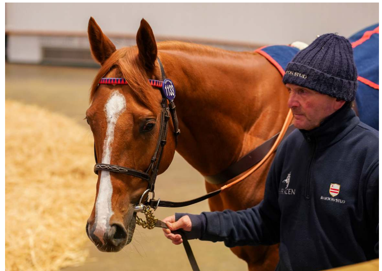
Sea The Casper | Tattersalls

Najd Stud also went to 170,000gns to secure Bresson (GB) (Dubawi {Ire}) (Lot 1066) from Juddmonte and paid 155,000gns for Godolphin's Parchemin (Ire) (Lope De Vega {Ire}) (Lot 1106) earlier in the session. The leading Saudi buyers have added 12 horses to their haul this week to the tune of 1,483,000gns.