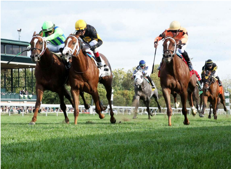
Committee of One (outside)

The fifth stakes winner for Mendelssohn , Committee of One is out of a half-sister to MGSP Saint Vigeur (Smart Strike) and GSP Victory Way ( City of Light ). This is also the family of champion 2-year-old filly Sweet Catomine (Storm Cat) and MGISW Life Is Sweet (Storm Cat). The winner has a yearling Mastery half-sister and a weanling half-sister by American Pharoah . Sweetest Sound visited Girvin for 2024. Click for the Equibase.com chart or VIDEO, sponsored by FanDuel TV.