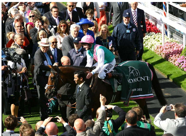
A life in the spotlight: Frankel is led in after winning the Juddmonte International