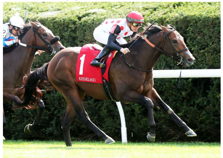
Souper Quest

O/B-Live Oak Stud (FL); T-Mark E. Casse.