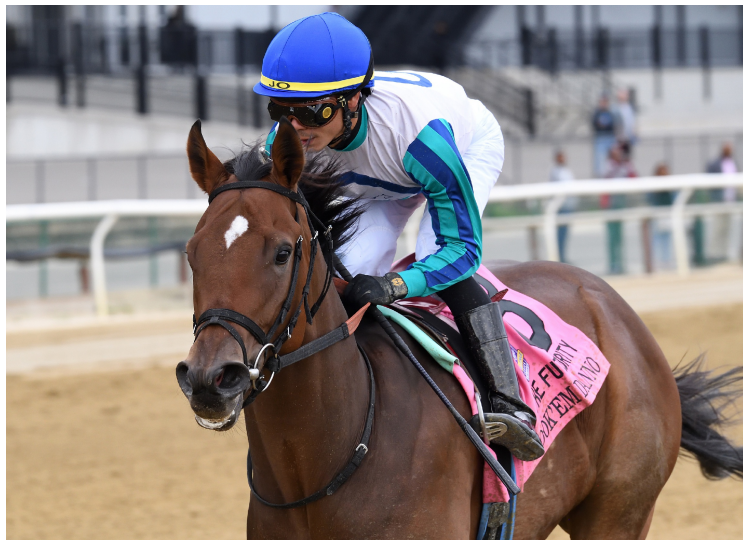
Book'em Danno

Away a touch awkwardly from his outside draw, Book'em Danno sat perched out wide and within striking distance as Works for Me posted splits of :22.09 and :45.27. The chalk ranged up ominously entering the straight, leveled off and widened at will.