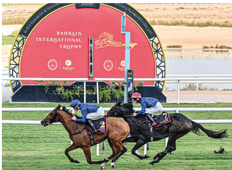
Dubai Future en route to winning in 2022 | Bahrain Turf Club

"The Bahrain International Trophy is our showpiece event and we are looking forward to staging the most competitive and valuable running of the race to date and welcoming runners and their connections from all over the world to Bahrain."