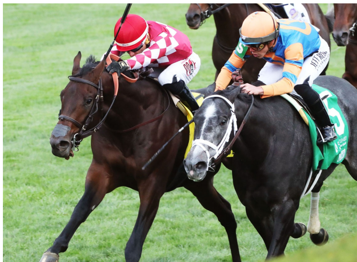
Can Group (outside) gets up

his career before breaking through in visually impressive fashion going seven panels on the Kentucky Downs sod Sept. 2. Cont.