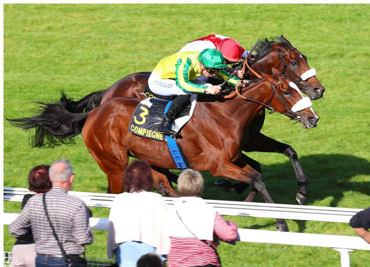
Zarica wins at Compiègne to equal the record for the most wins in a season in France