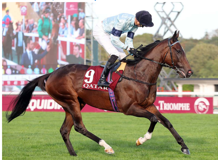
Cachet