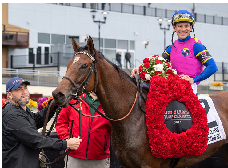
War Like Goddess Saturday