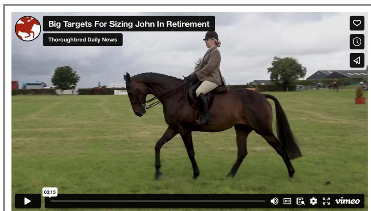
Big Targets For Sizing John In Retirement