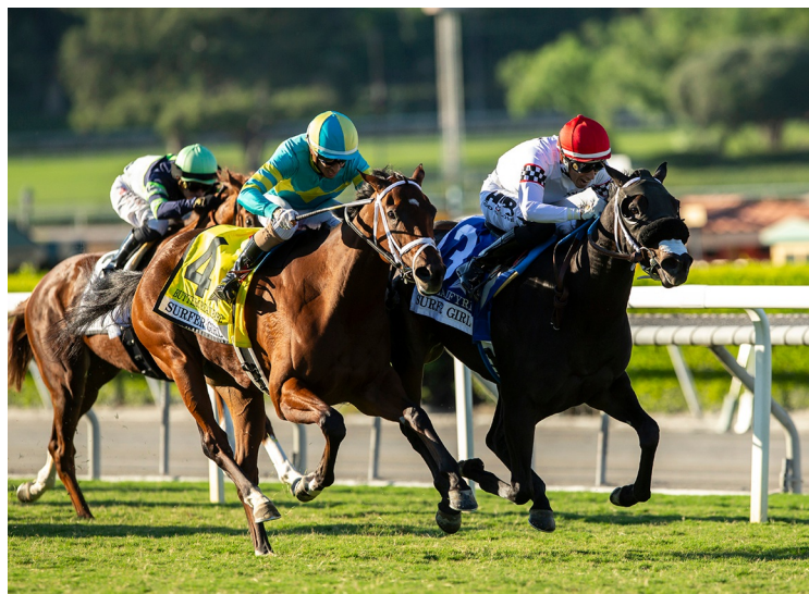
Dreamfyre (right)

They left Soho behind and battled nip and tuck to the wire with Dreamfyre holding on by a neck, but a lengthy stewards' inquiry and rider's claim of foul against the winner for making contact ensued. In the end, there was no change to the order of finish. Del Mar Juvenile Fillies Turf S. winner and $625,000 Keeneland September purchase Flattery, who raced in third for the first half, lost position, and came on again, finished third. Final time for the mile was 1.37.11.