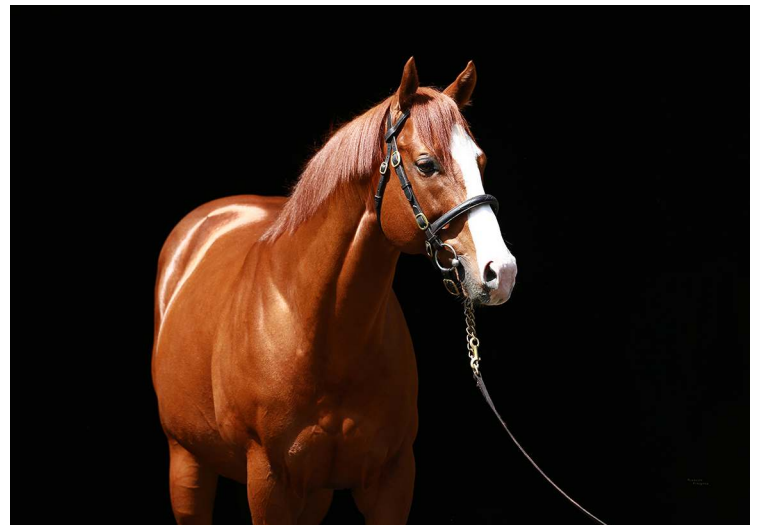
Munnings picked up a pair of winners Sunday

Vronsky , Clovisconnection, g, 3, o/o La Darling, by Perfect Mandate. Harris Farms S., 10-7, Fresno