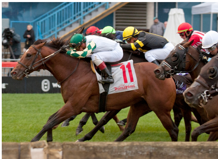
Big Invasion