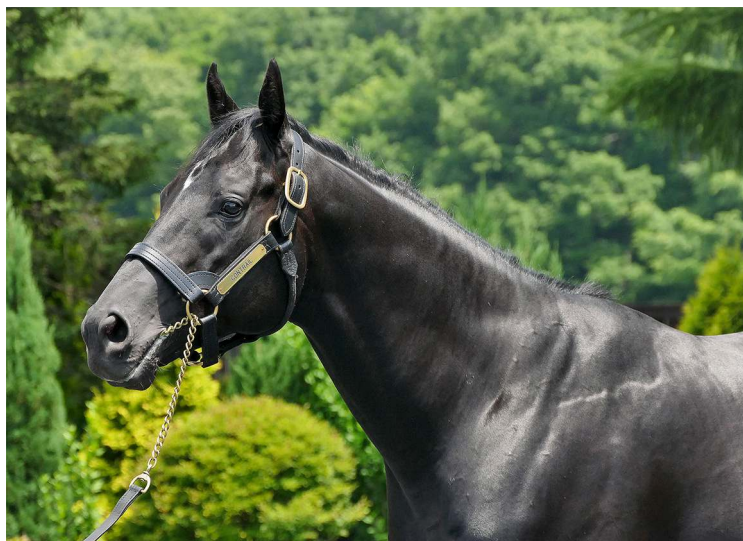
Two of the weanlings catalogued are by Triple Crown winner Contrail

Contrail's sire Kitan Black (Jpn) also has a youngster in the sale, lot 8, a filly out of the Argentinean champion race mare Elvas (Arg) (Catcher In The Rye).