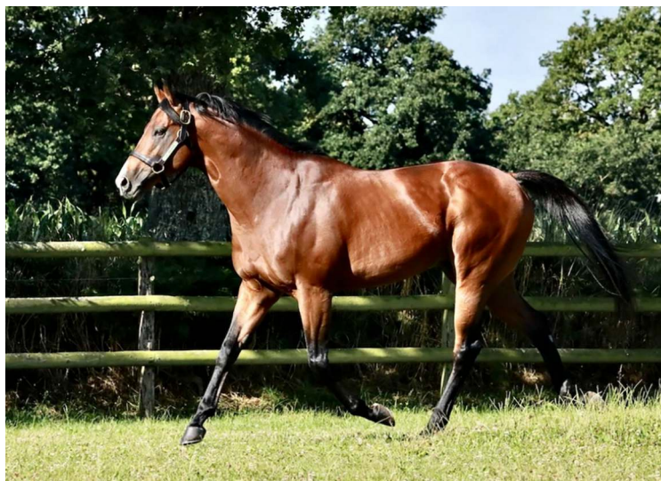
Le Brivido has an entry at Wolverhampton on Monday in the UK

Masar (Ire) (New Approach {Ire}), Dalham Hall Stud 104 foals of racing age 14:20-WINDSOR, 8.25f, Breckenridge (GB) 11,000gns Tattersalls February Sale 2022; 30,000gns Tattersalls December Yearling Sale 2022