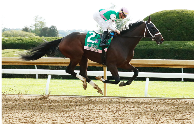
Idiomat

Juddmonte homebred Idiomat ( Curlin ) continued her ascent to the top of the distaff division Sunday with a dominant and fitting front-running tally in the GI Juddmonte Spinster S., a “Win and You’re In” qualifier for next month’s GI Breeders’ Cup Distaff.