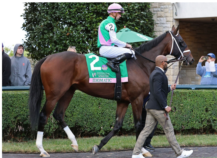
The imposing Idiomatic in the Keeneland paddock