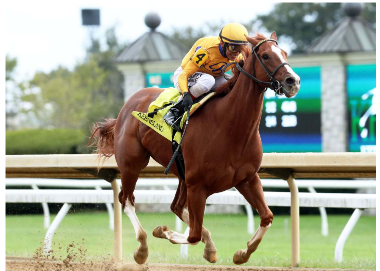
Tunisian Spring

1st-Belmont The Big A, $87,300, Msw, 10-8, 2yo, 7f, 1:23.27, gd, 3 1/4 lengths.