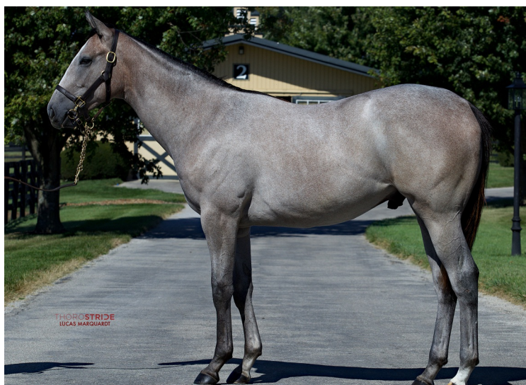
Wednesday's topper by Practical Joke | ThoroStride