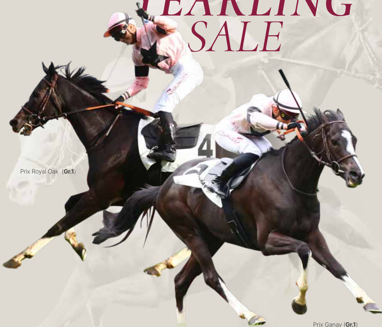
Prix Royal Oak (Gr.1)