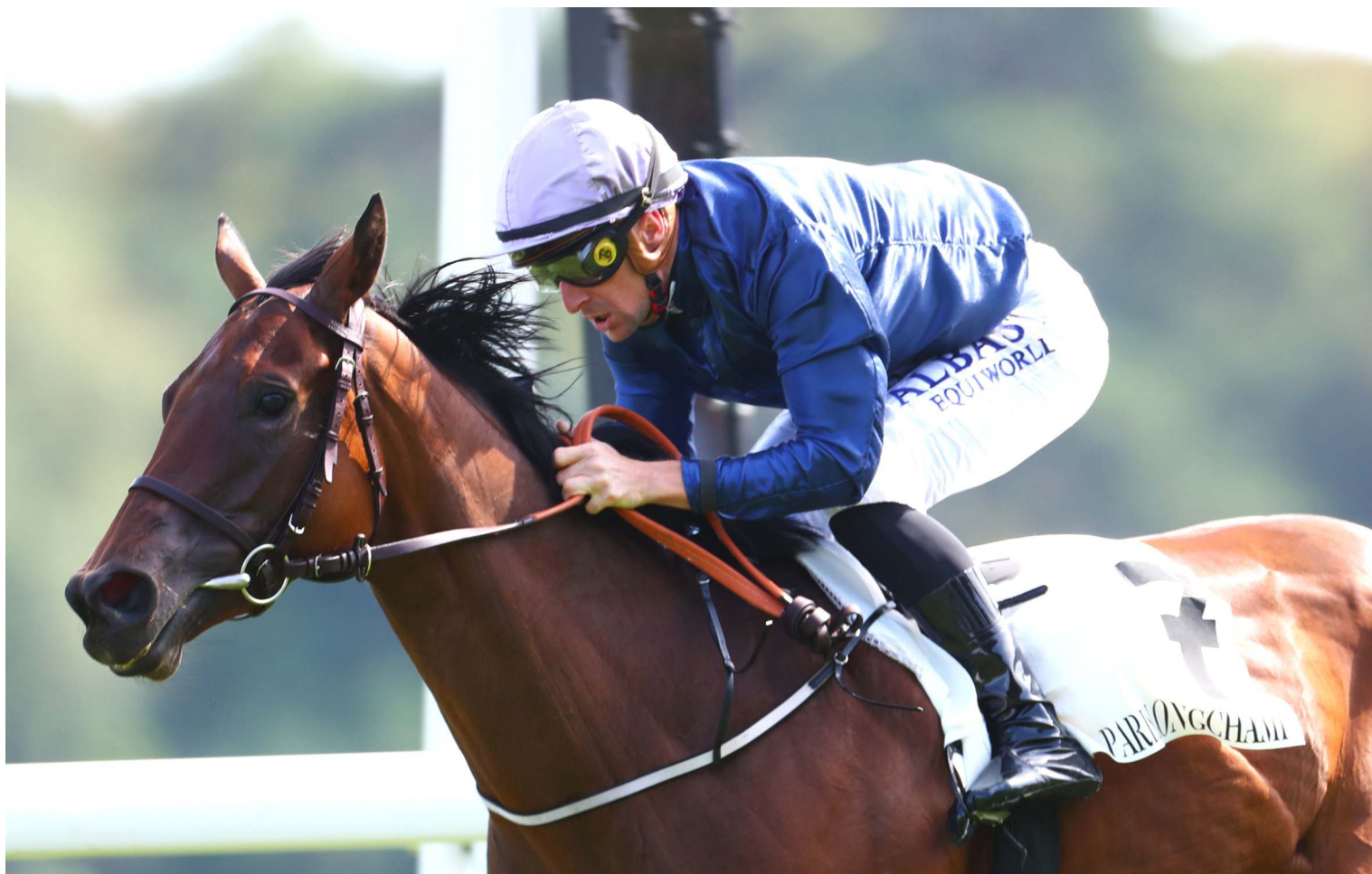
Lastotchka is bound for Australia with the Melbourne Cup on her radar | Scoop Dyga