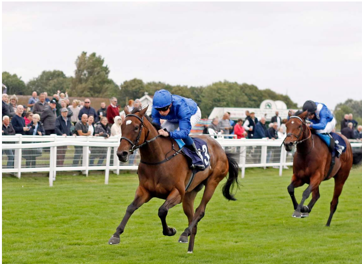
Sapphire Seas is the 131st stakes winner for her sire

Tracking the leaders early, the 9-2 shot travelled smoothly to the fore under William Buick approaching two out and had command soon after. Pushed out to assert her superiority, the Charlie Appleby-trained homebred hit the line with 2 1/2 lengths to spare over the smart yardstick Mukaddamah (GB) (New Approach {Ire}), with the returning TDN Rising Star Infinite Cosmos (Ire) ( Sea The Stars {Ire} ) 3/4 of a length away in third. The 10-11 favourite Al Asifah (GB) ( Frankel {GB} ), who had so impressed earlier in the season, was only seventh.