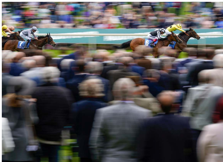
Fonteyn (yellow) wins the 2022 Sun Chariot