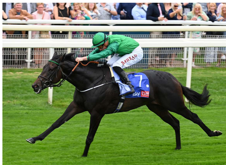
Relief Rally