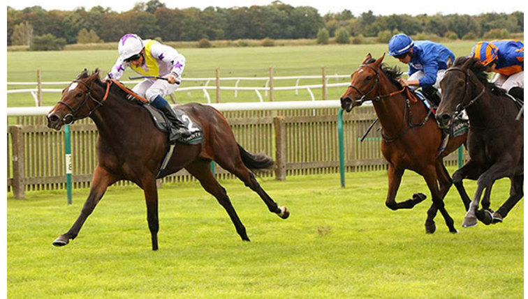
Lezoo | Tattersalls