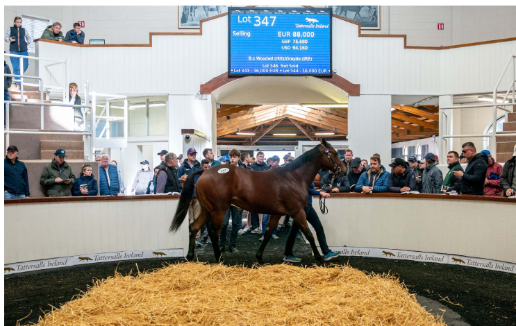
A Wooded colt led the way on day two at the Tattersalls Ireland September Yearling Sale | Tattersalls