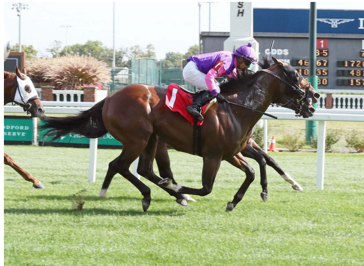
Coppola (1) | Coady