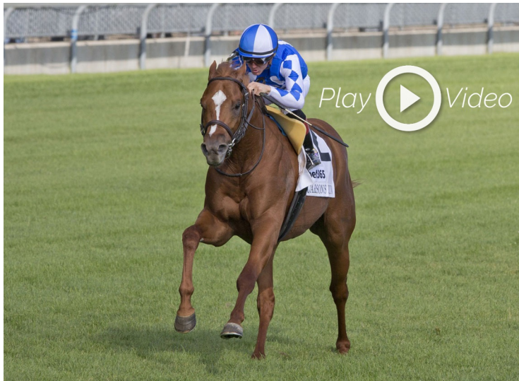
Click to watch the podcast