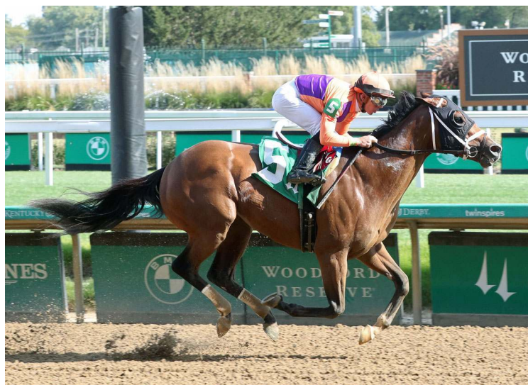
Giant Mischief | Coady

7th-Churchill Downs, $125,775, Alw (NW3$X), Opt. Clm ($100,000), 9-20, 3yo/up, 5fT, :57.04, fm, head.