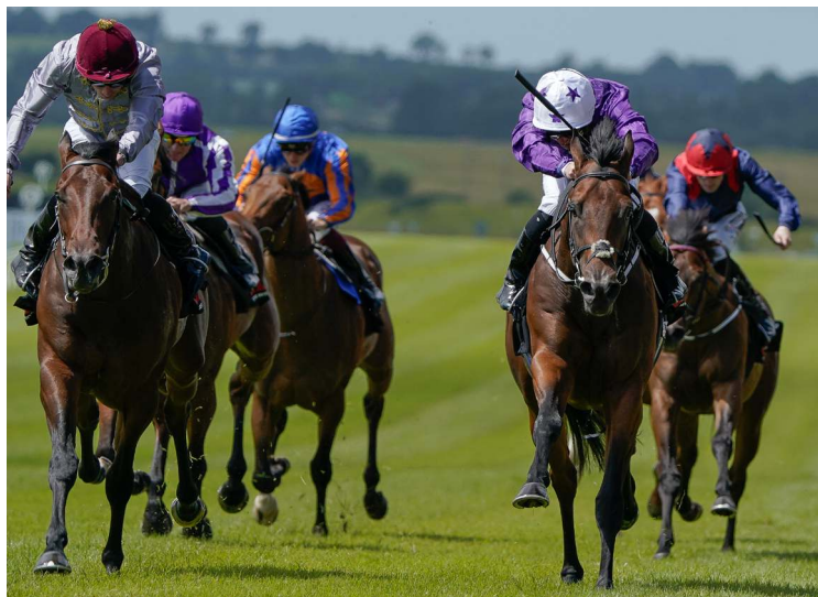
Bucanero Fuerte (right)