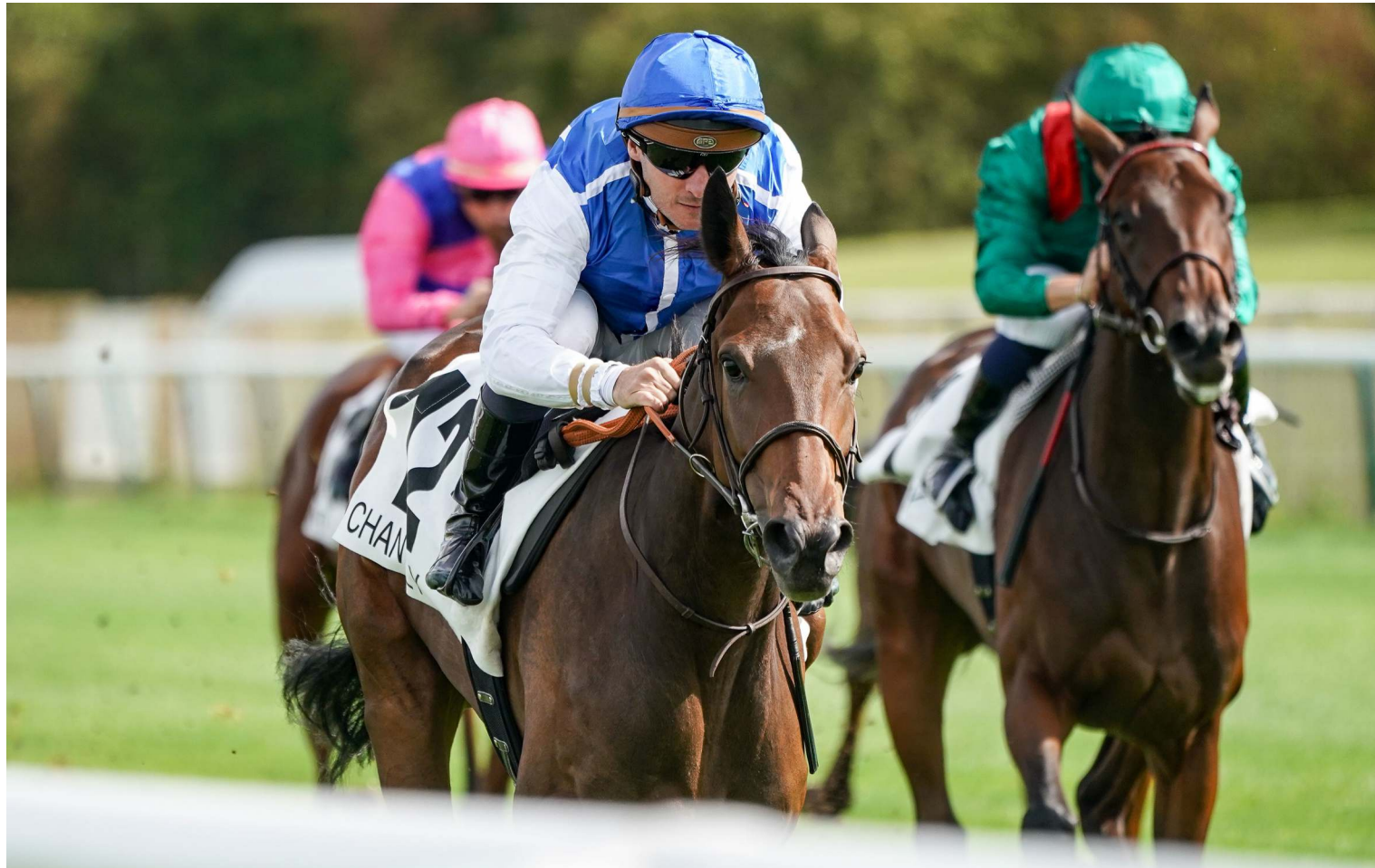
Aventure is the 18th 'TDN Rising Star' for her sire.

Aventure is the 10th foal out of the G2 Prix de Royallieu winner Balladeuse, whose aforementioned daughter Left Hand also took the G3 Prix de Psyche and was runner-up in the G1 Prix de Diane before producing the Listed Prix Melisande-winning fellow TDN Rising Star Left Sea (GB) ( Frankel {GB} ) who was also runner-up in the most recent edition of the Psyche. A winner on debut herself, Balladeuse's second-best progeny at present is Romanciere (Ire) (Dansili {GB}) who was placed in eight black-type contests including the G1 Prix Jean Romanet and her Listed Prix Charles Laffitte-winning full-sister Bilissie (GB). Cont. p7