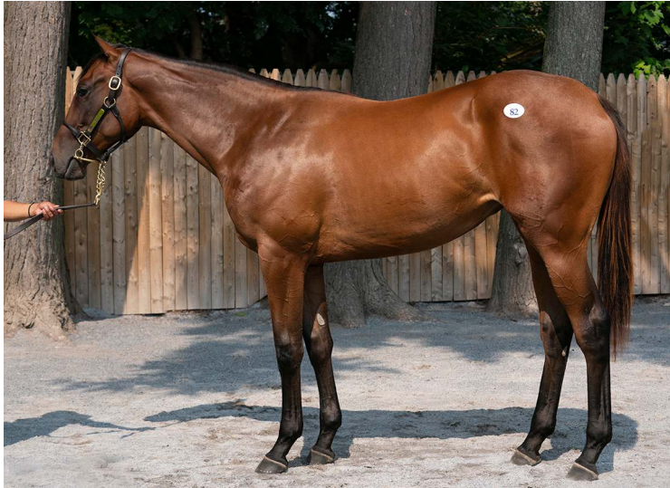
Dreaming of Mo | Fasig-Tipton