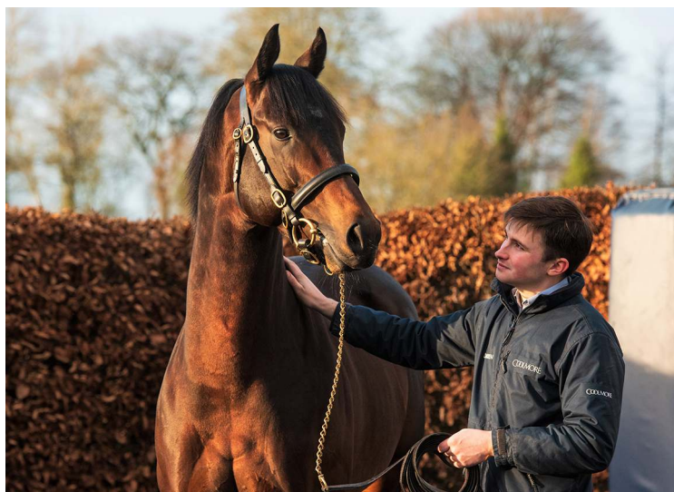
Ten Sovereigns sired a debut winner in Milan on Wednesday

Masar (Ire) (New Approach {Ire}), Dalham Hall Stud 104 foals of racing age 14:45-YARMOUTH, 8f, Adore You (GB) 10,000gns Tattersalls December Foal Sale 2021; 15,000gns Tattersalls October Yearling Sale (Book 3) 2022