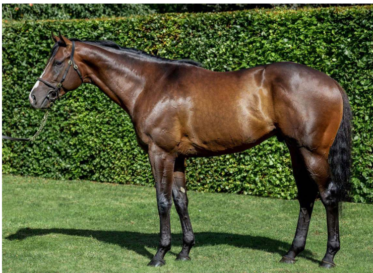
Advertise | Manton Park Stallion

Ten Sovereigns (Ire) (No Nay Never), Coolmore Stud 149 foals of racing age/6 winners/0 black-type winners 2-KILLARNEY, 8.25f, Nor Time Nor Tide (Ire)