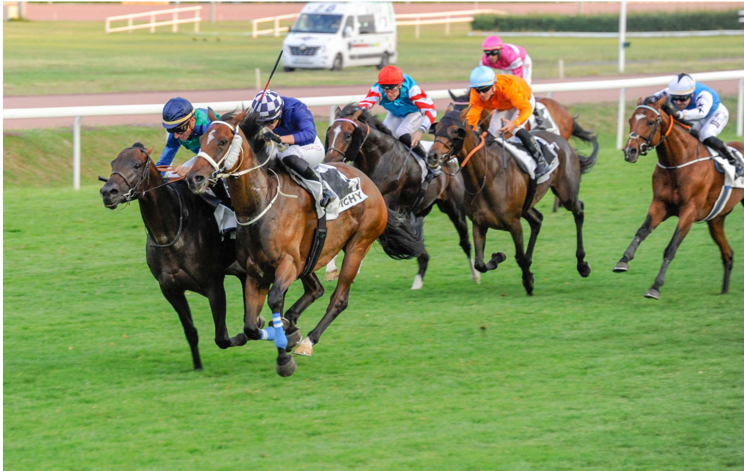
Have Dancer is his late sire's 58th stakes winner after prevailing at Vichy on Tuesday evening.

The winner's dam, who was successful in the Listed Prix Herod and finished third in the GIII Senorita S., also produced the listed-placed pair Luriyya (Fr) (Valanour {Ire}) and Passiflore (Fr) ( Siyouni {Fr} ) and the dam of the G1 Poule d'Essai des Pouliches third Mageva (GB) ( Wootton Bassett {GB} ).