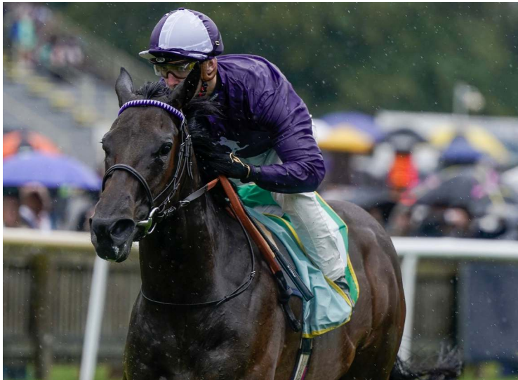
Persian Dreamer | Getty Images