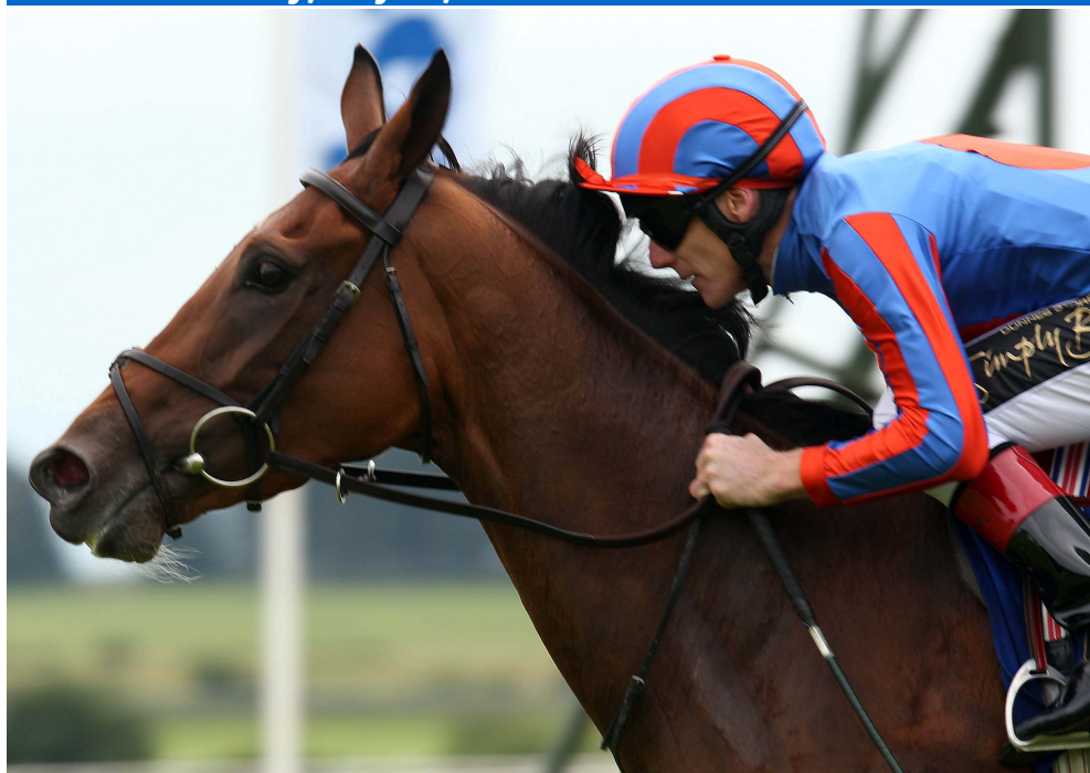
Johnny Murtagh and Peeping Fawn (Danehill) winning the Irish Oaks in 2007.