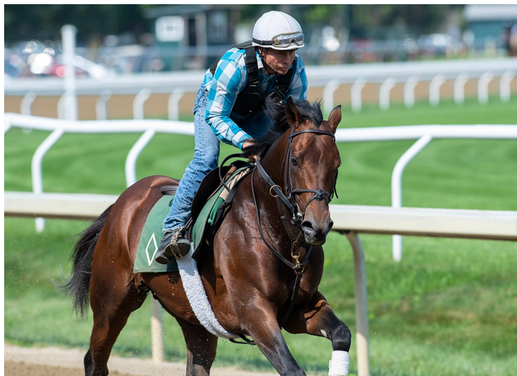
Art Collector last week at Saratoga