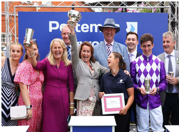
The Shaquille team celebrating in Newmarket