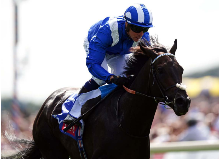
Alflaila