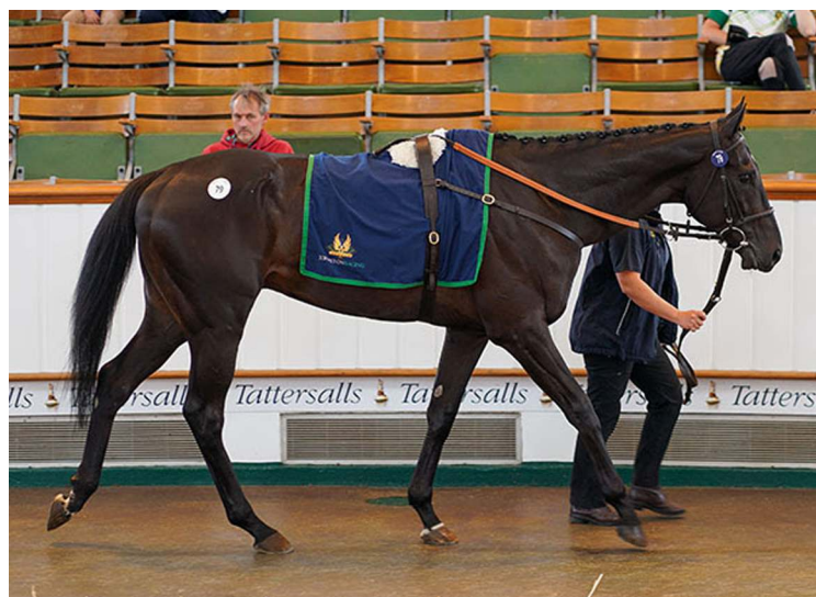
Lot 79, Midnight Lion, topped the Tattersalls Summer Sale

Stephensen Bloodstock went to 72,000gns to secure the second-highest priced lot of the day, the 3-year-old Laafi (Fr) (Cloth of Stars {Ire}) (lot 74). Cont. p5