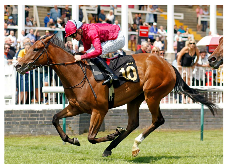
Granny Budgie