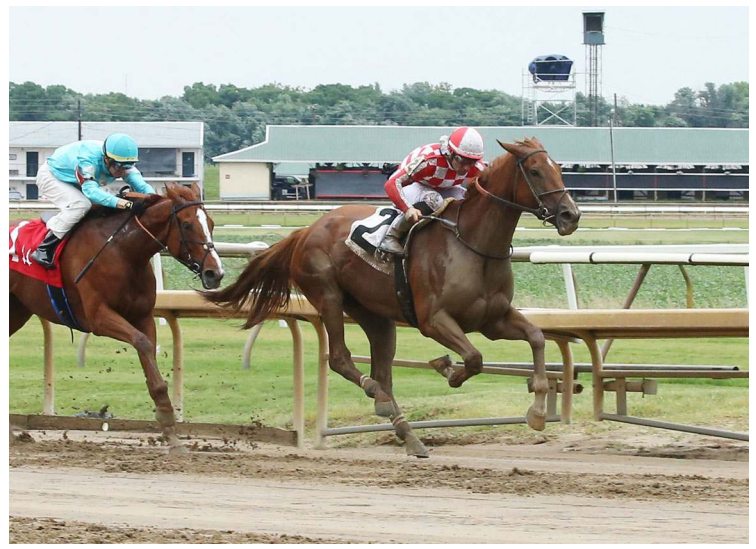
Pretty Provocative