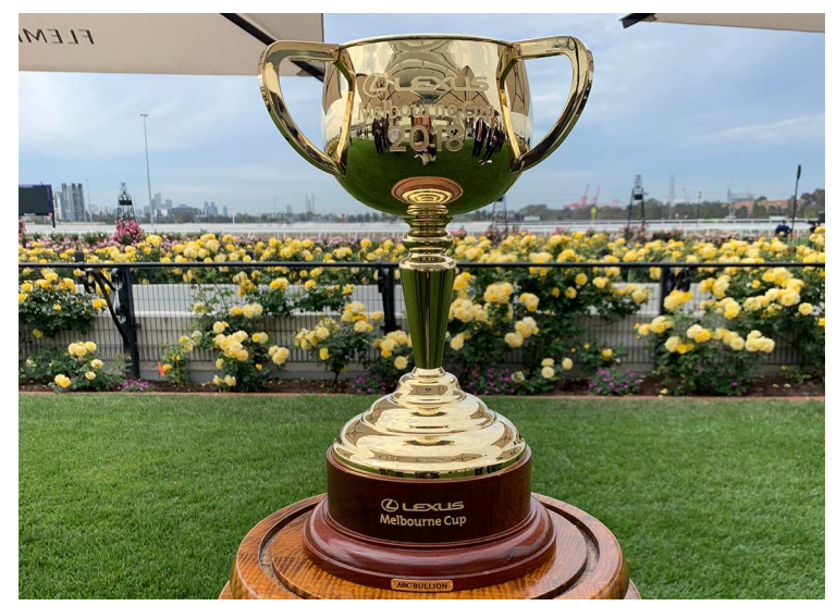
The Melbourne Cup