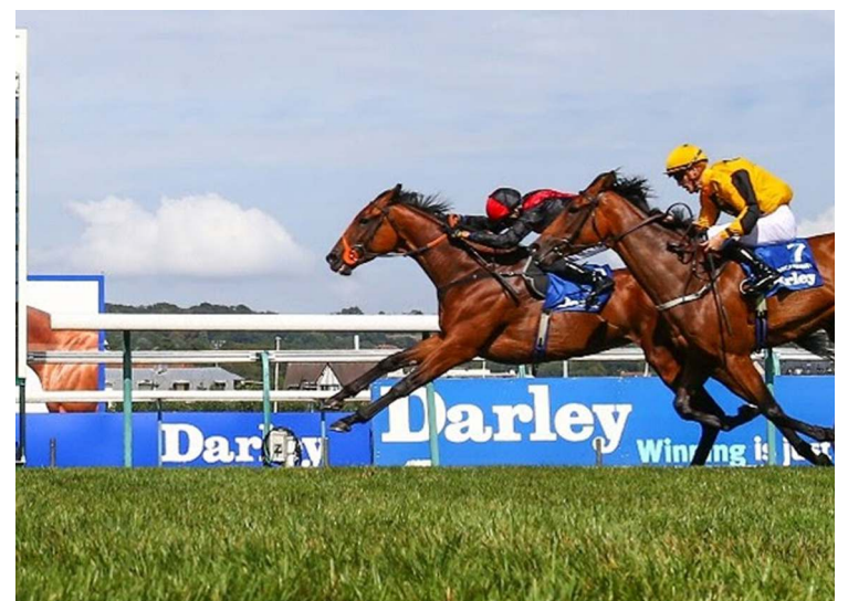
Godolphin: sponsored the initiative

The Godolphin-sponsored Schools Together exchange programme initiative, which involved 16 students, was launched in March this year. The Irish leg of the visit took place from 8-10 March, with a reciprocal Newmarket trip from 17-19 May.