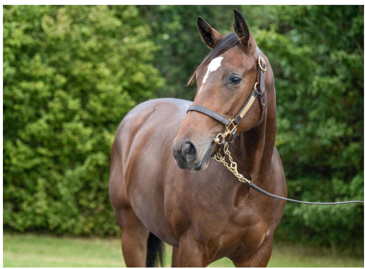
1.5-million gns Tattersalls purchase Ylang