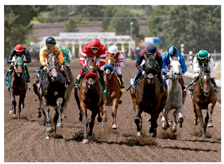
Racing on the California fair circuit

The operators of the Humboldt County Fair in Ferndale, California, are scrambling for a solution after just finding out this week that an earthquake from six months ago so badly damaged the grandstand at the half-mile racetrack that county officials now won't permit the structure to be occupied for the six-day race meet Aug. 18-20 and 25-27.