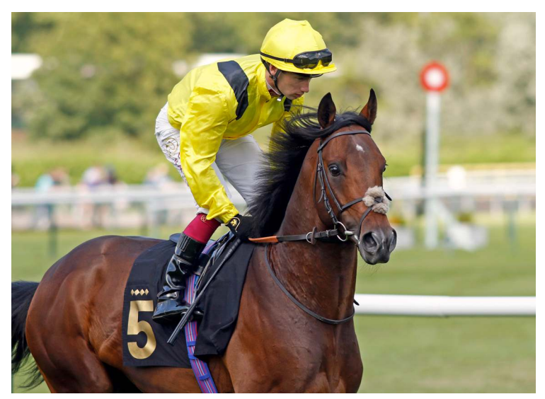
Tamayuz's Terwada

3rd-Newcastle, £9,950, Nov , 6-29, 2yo, 6f (AWT), 1:15.56, st/sl. AMBUSHED (IRE) (c, 2, Soldier's Call {GB}--Rush {GB}, by Compton Place {GB}), who ran unplaced behind the 'TDN Rising Star' performance of Barnwell Boy (GB) (Starspangledbanner {Aus}) in his May 26 debut at Goodwood last time, was squeezed for room at the break and raced fifth through the initial fractions. Taking closer order at halfway, the 15-2 chance was ridden to challenge passing the quarter-mile pole and kept on in resolute fashion to outpoint Ballymount Boy (Ire) (Camacho {GB}) by a neck. Ambushed is the sixth of seven foals and fourth scorer out of a half-sister to G3 Fred Darling S. winner and G1 Cheveley Park S. runner-up Rimth (GB) (Oasis Dream {GB}). The March-foaled chestnut is a half-brother to Listed Marygate S. victrix Sardinia Sunset (Ire) (Gutaifan {Ire}) and a yearling colt by Dark Angel (Ire). Sales history: £105,000 Ylg '22 GOFFUK. Lifetime Record: 2-1-0-0, $6,789. O-Clipper Logistics; B-Golden Farm Tbreds Ltd (IRE); T-A Watson.