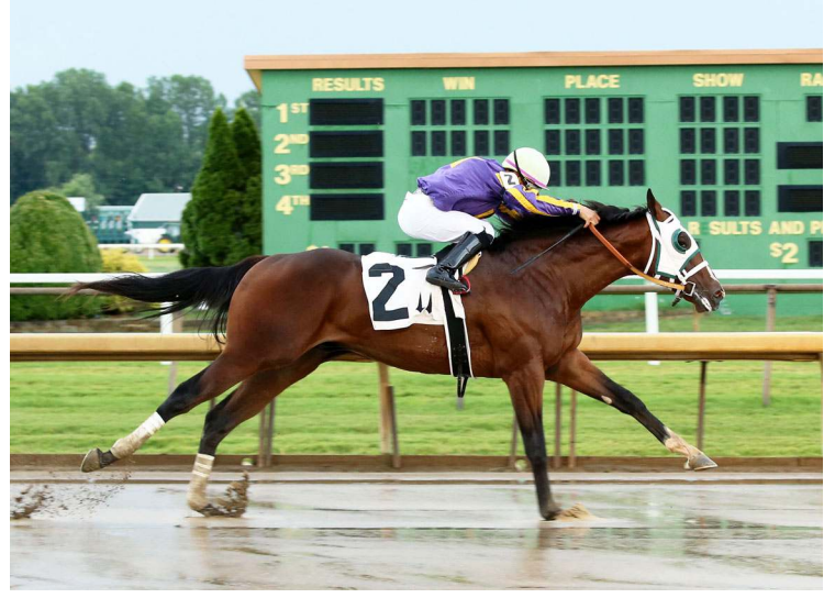
Market Street

O-Tom R. Walters; B-Tom R. Walters (KY); T-Thomas Molloy.