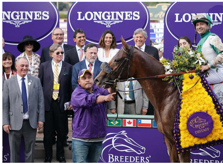
Blue Prize and her connections after her win in the GI Longines Breeders' Cup Distaff