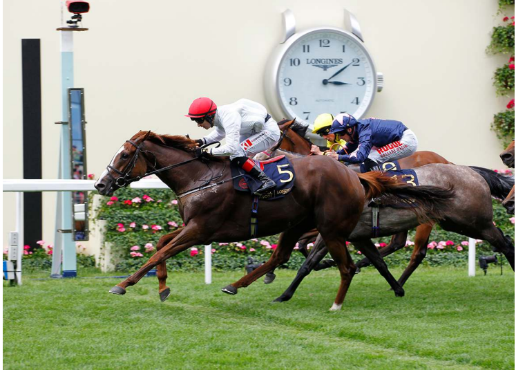
Villanova Queen