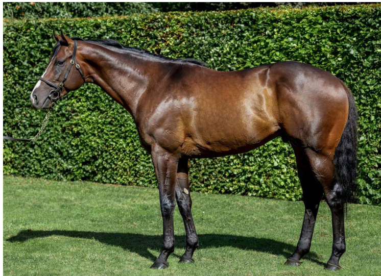
Advertise | Manton Park Stallions