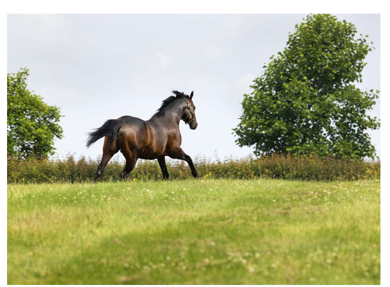
Too Darn Hot has a pair of runners at Yarmouth | Darley

Too Darn Hot (GB) (Dubawi {Ire}), Dalham Hall Stud 120 foals of racing age 15:40-YARMOUTH, 5.25f, Perelle (GB) €22,000 RNA Goffs November Foal Sale 2021; £20,000 Goffs UK Premier & Silver Yearlings 2022 15:40-YARMOUTH, 5.25f, Pickled Pepper (GB)