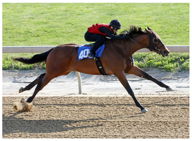
Hip 406 | Fasig Tipton

406 filly Gun Runner Rocky Policy 450,000 Consigned by De Meric Sales, agent Purchased by Flurry Racing Stables Lugamo Racing Stables acquired this filly for $175,000 at last year's Fasig-Tipton Saratoga sale.