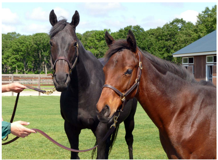
Yankee Rose pictured with her first foal, Romneya (Jpn) (Deep Impact {Jpn})

Sol Oriens's sire Kitasan Black, a son of Deep Impact's full-brother Black Tide (Jpn), is also responsible for the exciting Equinox (Jpn) and was himself an accomplished galloper who didn't race until he was three.