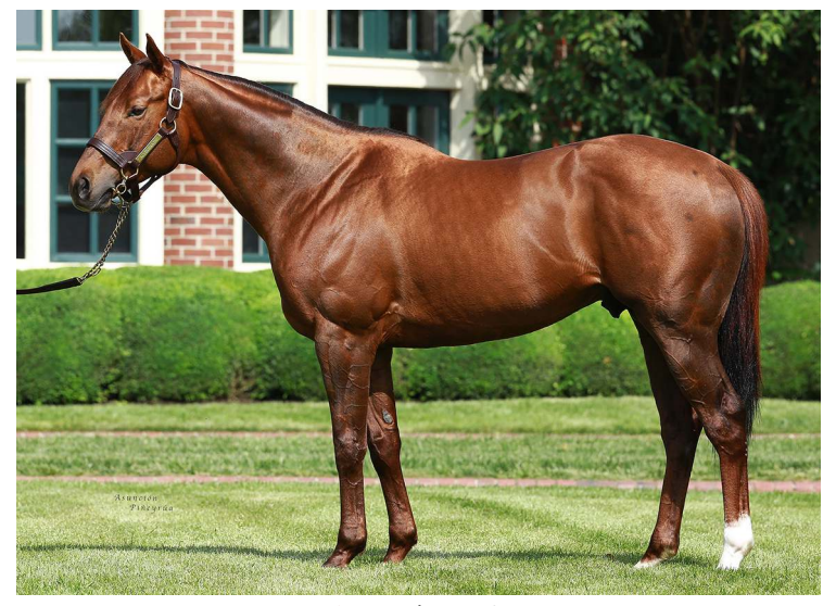
Accelerate | Lane's End

6th-Parx Racing, $50,830, Msw, 5-23, 2yo, f, 4 1/2f, :54.95, ft, 13/4 lengths.