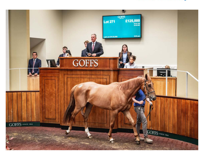
Lot 271: the No Risk At All gelding who led the way on Tuesday Goffs UK