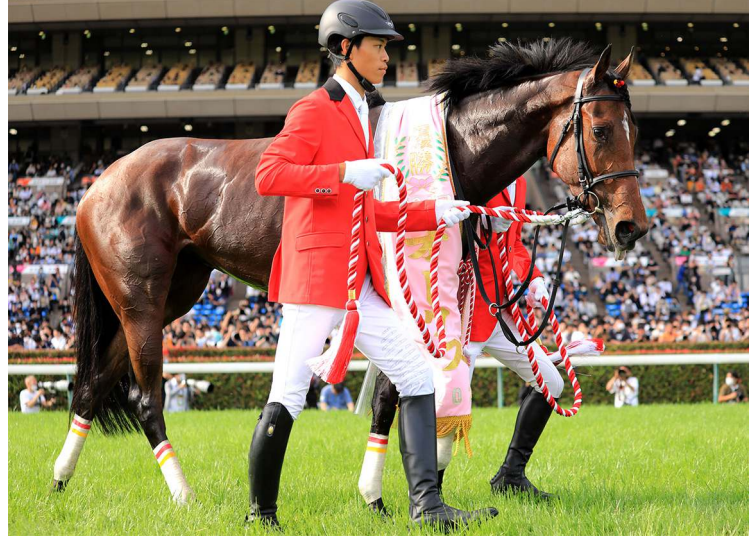
Liberty Island after winning the Japanese Oaks