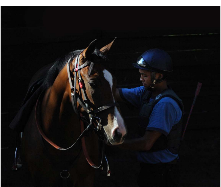
Serving the Thoroughbred Industry Since 1979