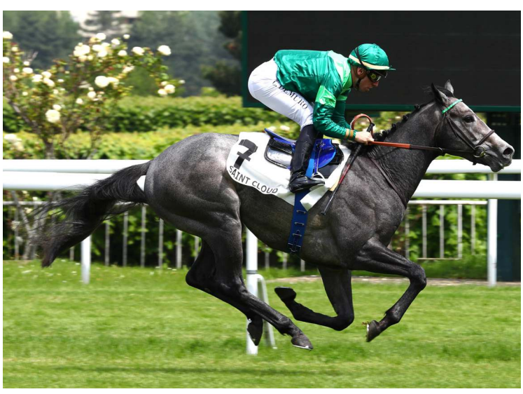
Havana Cigar

HAVANA CIGAR (GB) (c, 2, Havana Grey {GB}--Speculating {Ire}, by Xtension {Ire}) was reined back to race last of six through the initial fractions of this newcomers' heat. Improving one spot at halfway, the 21-10 favourite was coaxed forward off the home turn to go second at the quarter-mile marker and was pushed out in the closing stages to comfortably defeat Stormygo (Fr) (Goken {Fr}) by two lengths. Havana Cigar is the first of two foals produced by an unraced half-sister to G3 Cumberland Lodge S. victor Danehill Kodiac (Ire) (Kodiac {GB}). Cont. p9