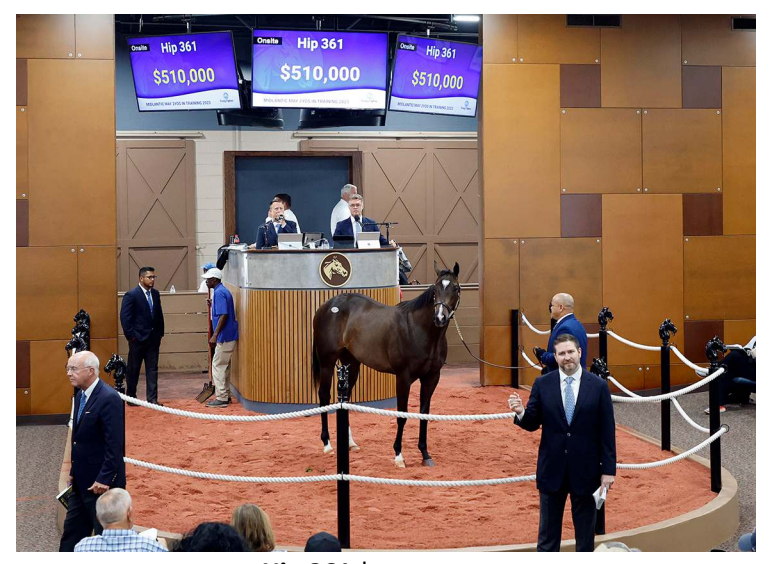
Hip 361 | Fasig-Tipton

"She had a good pedigree and we liked her physical, so we