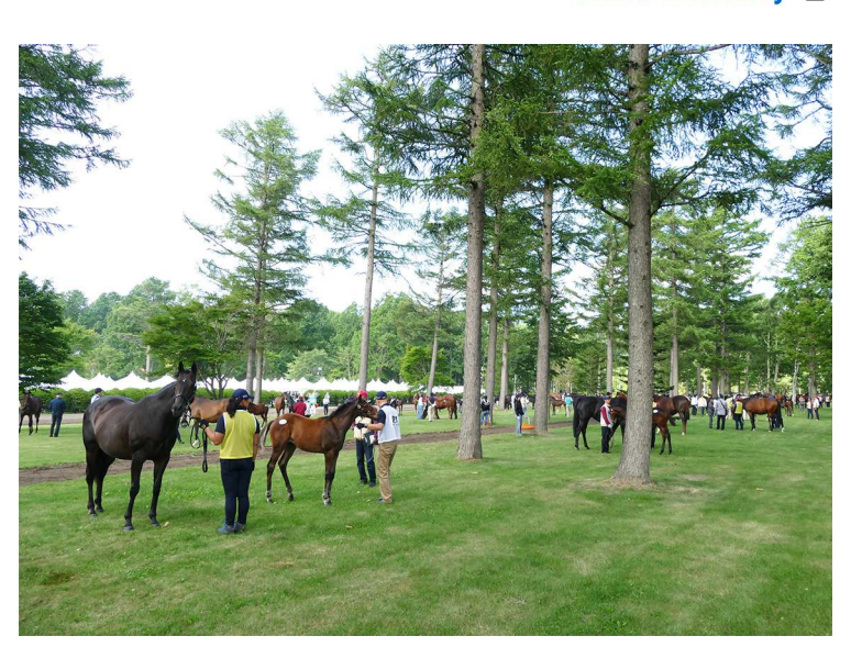
Foal inspections in Northern Horse Park | Emma Berry