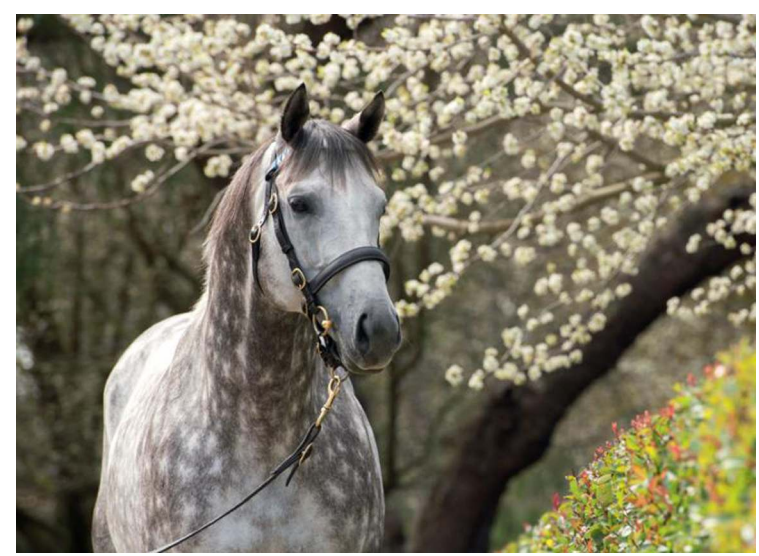
Frosted | Darley