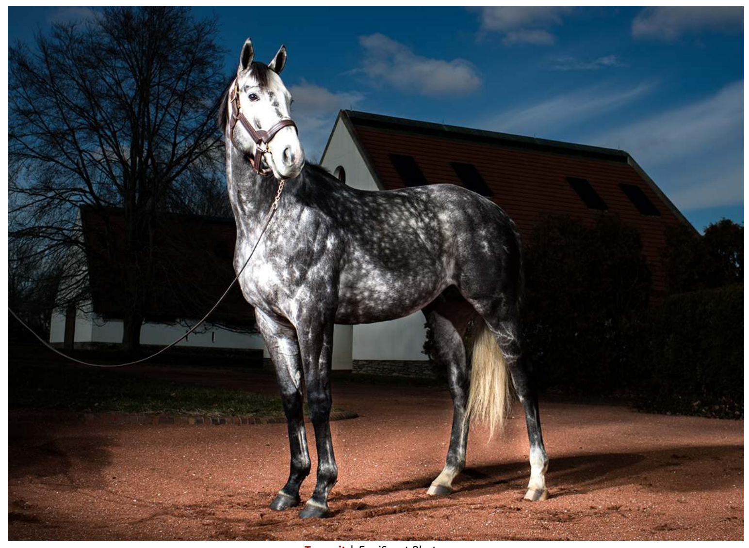
Tapwrit | EquiSport Photos

Tidal Volume , Sure Fire Ready, m, 5, o/o I'm Ready, by More Than Ready. ALW, 5-23, Thistledown