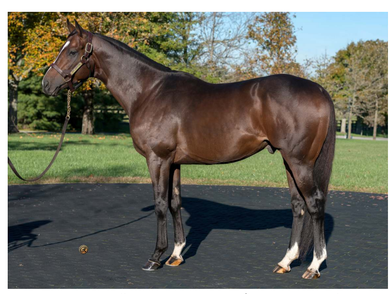
WinStar stallion Good Samaritan

5 foals of racing age/0 winners/0 black-type winners 6-Belterra, 2:55 p.m. EDT, Msw 6f, Whynaughty, 6-1