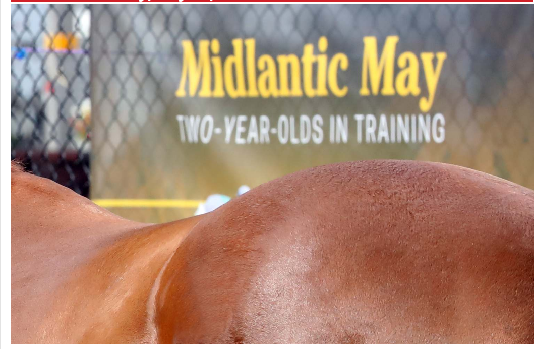
Coverage from the the Fasig-Tipton Midlantic May 2-Year-Olds in Training Sale continues on page 5. | Fasig-Tipton