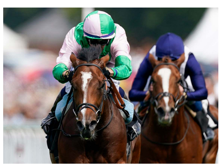
Royal Scotsman