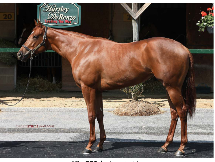
Hip 552 | ThoroStride

A filly by Arrogate (hip 552), the most hyped horse on the sales grounds all week, delivered in the sales ring Tuesday when selling for $1 million to the bid of bloodstock agent Kerri Radcliffe, acting on behalf of an undisclosed London-based