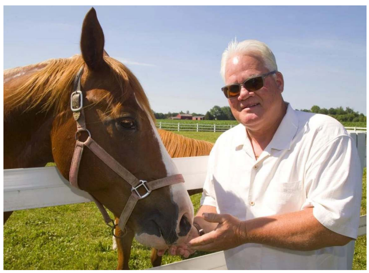
Hugh Mitchell | Courtesy Woodbine Entertainment Group

At Woodbine Entertainment, we own and operate two racetracks: Woodbine Mohawk Park (Standardbred racing) and Woodbine Racetrack (Thoroughbred racing). If you are reading this with interest, it's important to understand that Woodbine