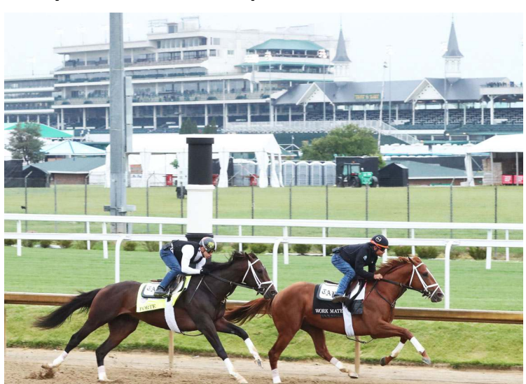
Forte (outside) | Coady

"I'm very pleased," Pletcher said. "They all did what they were supposed to do."