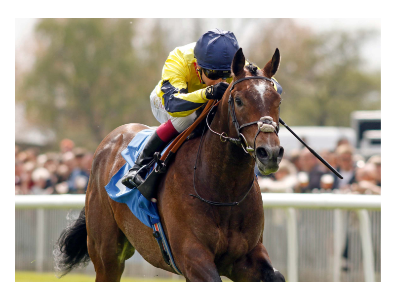
Spanish Phoenix