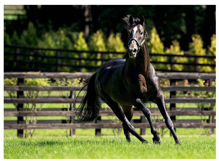
Kitasan Black | Shadai Stallion Station

"He is a Group 1-level horse. His growth was a bit slow compared to other horses but he has matured as he has gained more racing experience. He will be in top condition on Derby day."