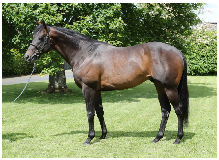
Invincible Army has a runner at Musselburgh | Yeomanstown Stud

Magna Grecia (Ire) (Invincible Spirit {Ire}), Coolmore Stud 109 foals of racing age 16:15-MUSSELBURGH, 5f, Myconian (Ire) €27,000 Tattersalls Ireland September Yearling 2022