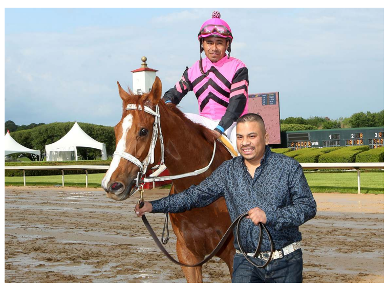
Coastal Charm