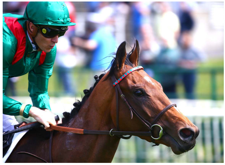
Vadeni | Scoop Dyga