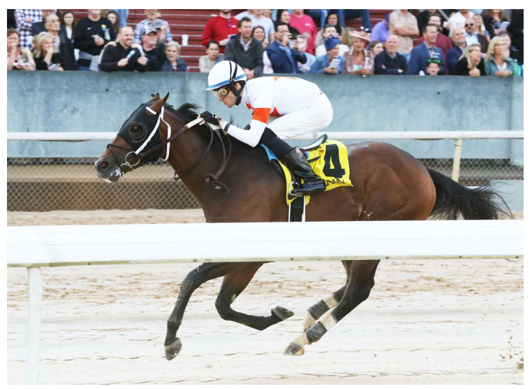
Ryvit

Facing a well-backed favorite in Mo Strike, Ryvit went off at odds of 5-2 and from the outset made his presence known by seizing the lead. Rounding the far turn, he distanced himself from the rest of the field and went to secure the victory by 2 lengths over the late-running chalk. GSW High Dollar Woman (Super Saver) is a half to the winner's dam. This is her first offspring to make the races, but she does have a 2-year-old colt by Collected. Click for the Equibase.com chart or VIDEO , sponsored by TVG .