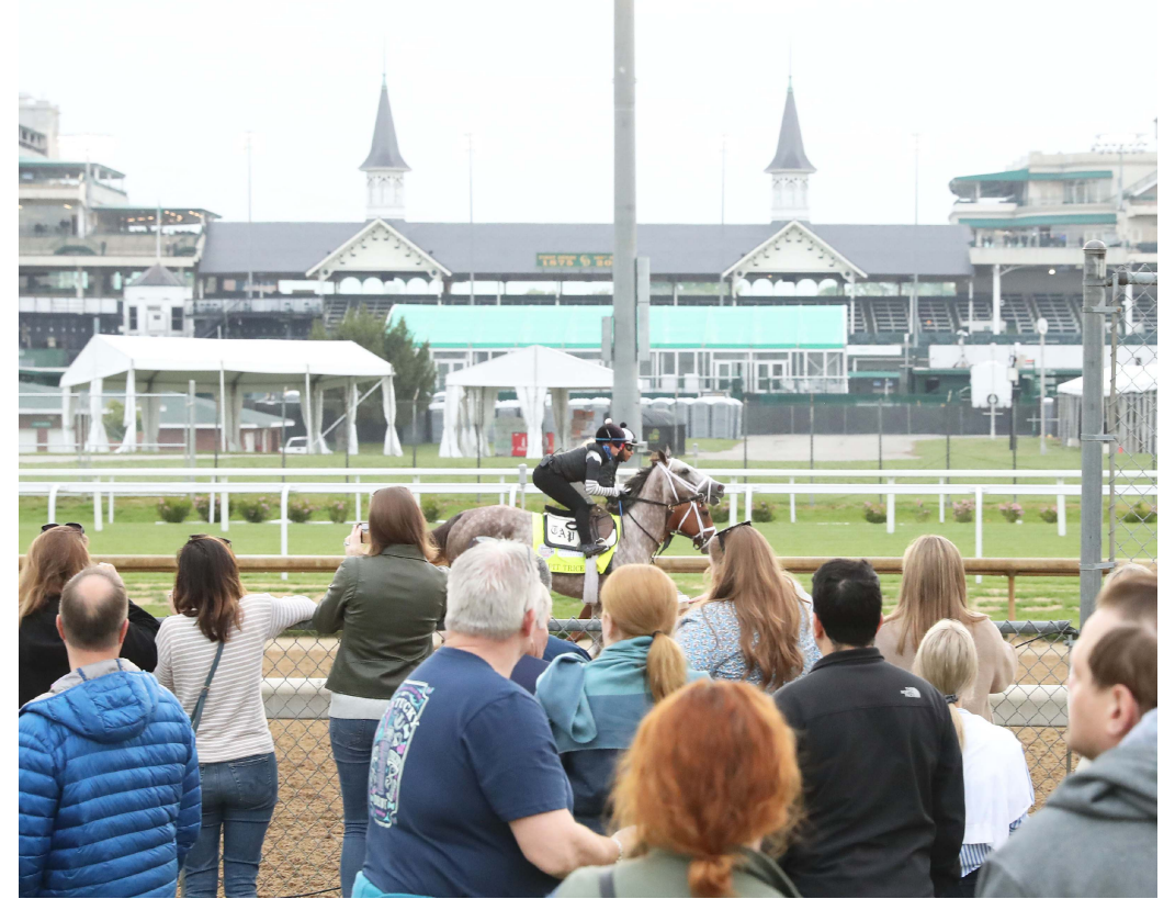
Kentucky Derby contender Tapit Trice ( Tapit ) works beneath the Twin Spires as fans pack the backstretch at Churchill Downs Saturday | Coady