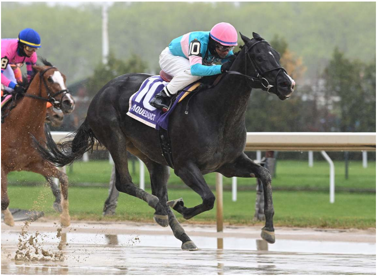
Balpool | Coglianese

CAN'T WAIT TO GET YOUR TDN BREAKING NEWS AND RACE RESULTS?