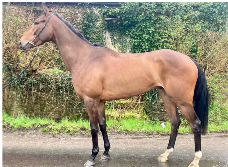
Hypersonic Missile | ThoroughBid