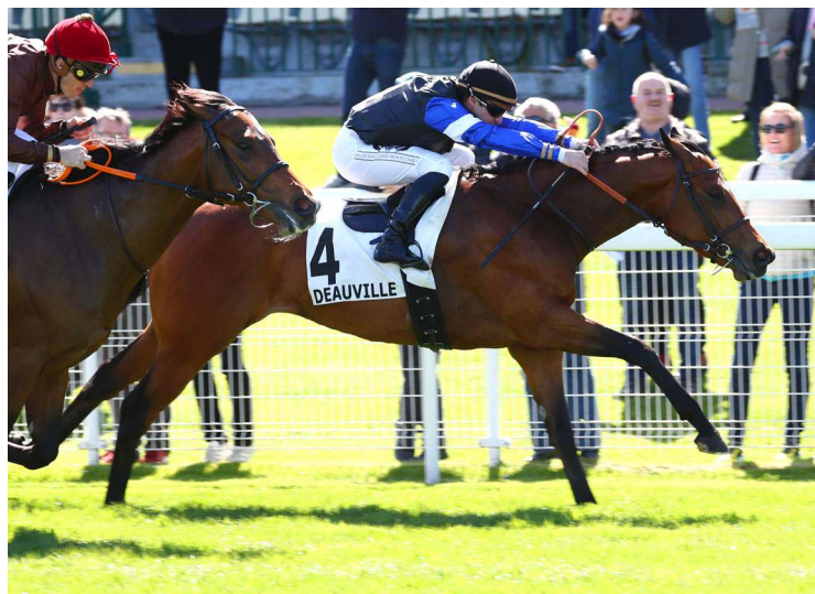
Good Guess upsets Thursday's G3 Prix Djebel

Keeneland's 15-day Spring Meet kicks off with its opening day feature, the GI Central Bank Ashland S.