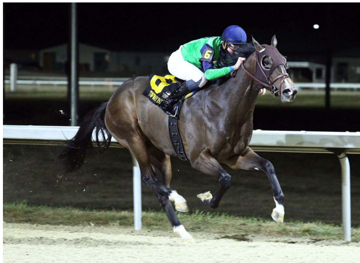
Clear the Air

A maiden winner going six furlongs at Turfway in January, Clear the Air was a troubled fourth in a one-mile optional claimer at Turfway Feb. 11 before his Gotham effort. He worked four furlongs in :48.00 (3/77) at Turfway Saturday.