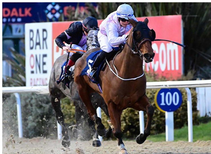
Elzaam Blue at Dundalk | Tattersalls