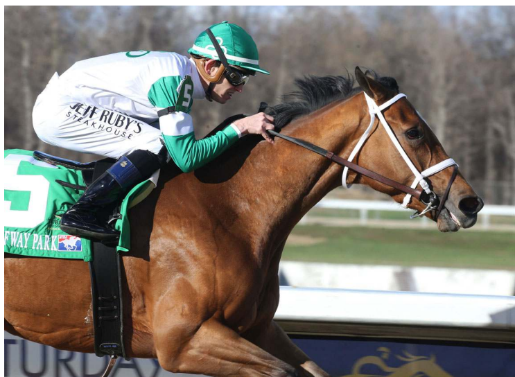
Botanical winning last weekend's Bourbonette S.