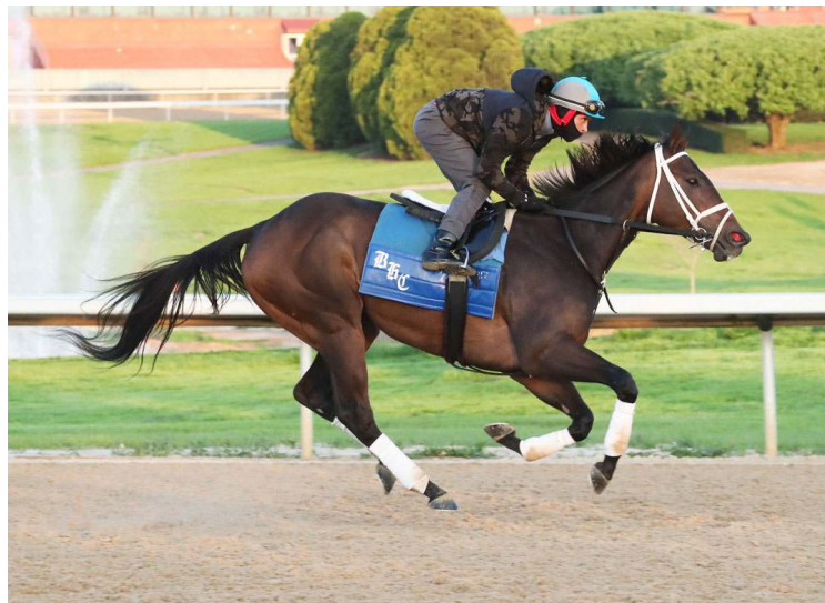
Punchbowl