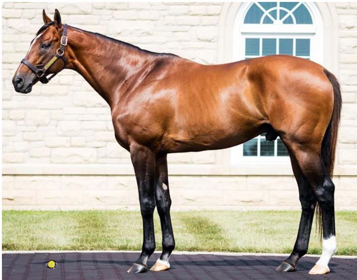
Mucho Macho Man | EquiSport

CONSIGNEE BY N-D NICKY DRION THOROUGHBREDS