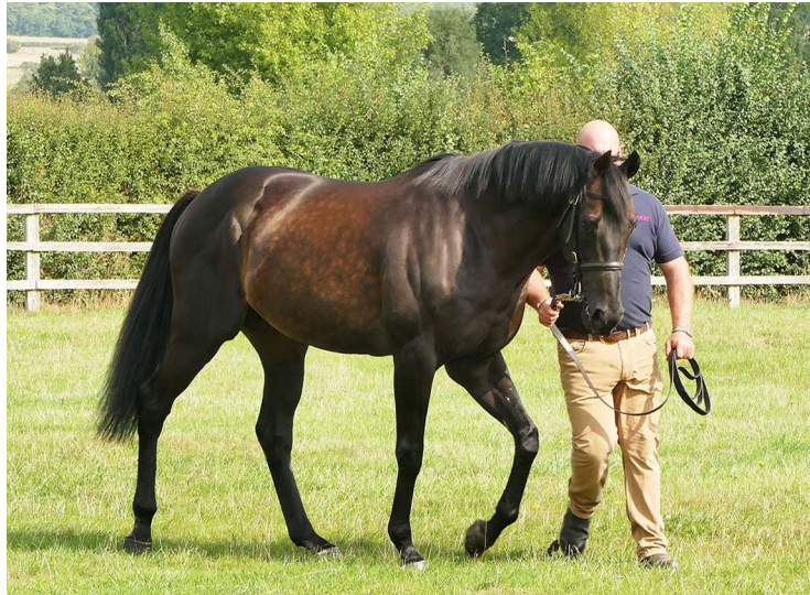
Golden Horn pictured at Overbury Stud

While the two young sprint stallions are clearly going to be kept busy this covering season, busier still will be the Derby and Arc winner Golden Horn. He is listed as having covered 152 mares in his final year at Darley, and his book will be just as full