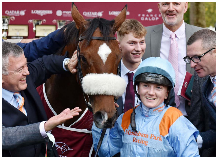
The Platinum Queen