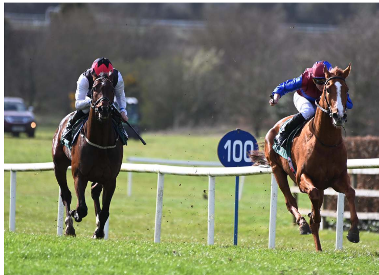
Gooloogong (right)