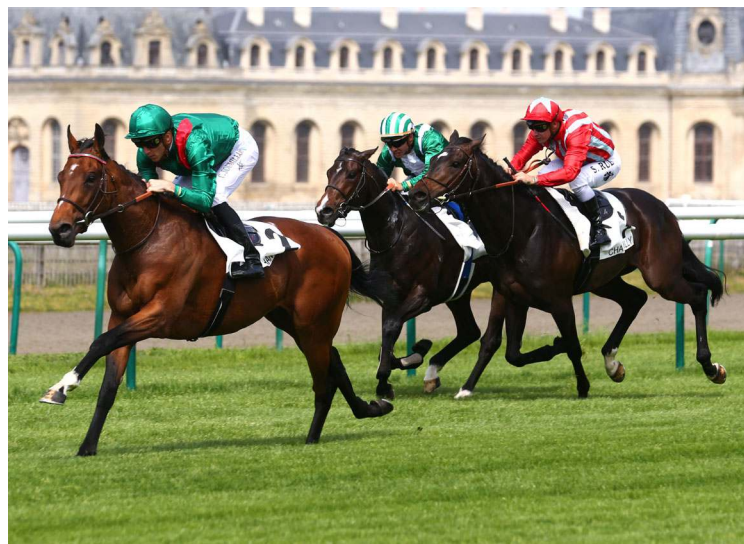
Vadeni

Vadeni (Fr) ( Churchill {Ire} ), the Aga Khan's 2022 G1 Prix de l'Arc de Triomphe runner-up, is likely to renew his rivalry in an early-season rematch with Luxembourg (Ire) ( Camelot {GB} ) in the G1 Prix Ganay after connections confirmed that is his most likely target on Wednesday.