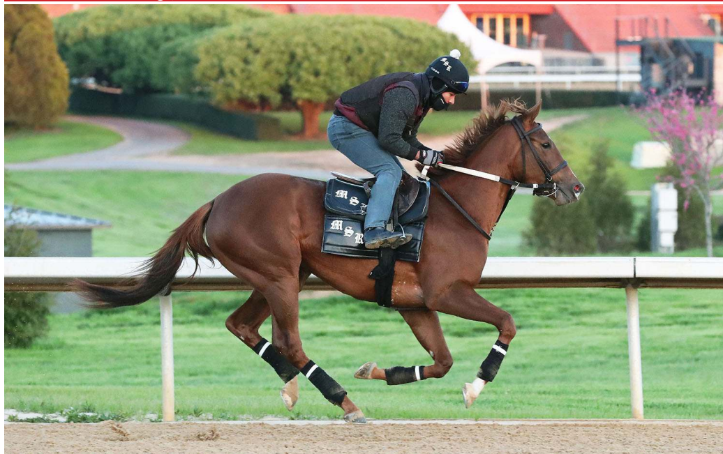
She's Lookin Lucky ( Lookin At Lucky ) gallops at Oaklawn on Wednesday morning in preparation for Saturday's GIII Fantasy S.