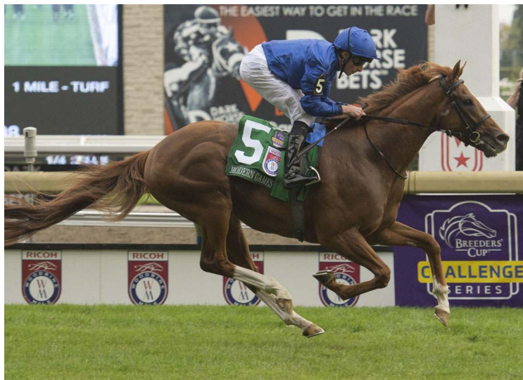
Modern Games

"The team are advancing nicely in preparation for the 2023 season," Godolphin tweeted. "Stable star Modern Games will head straight to the G1 Maker's Mark Mile at Keeneland. With The Moonlight heads to the G1 Jenny Wiley."