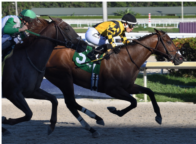
Super Corinto

Jet Set Racing Stable's Chilean Group 1 winner Super Corinto ( Arg ) (Super Saver), originally among a bulky field entered for the G2 Godolphin Mile at Meydan Mar. 25, will instead run in the $12-million G1 Dubai World Cup, it was announced Friday.