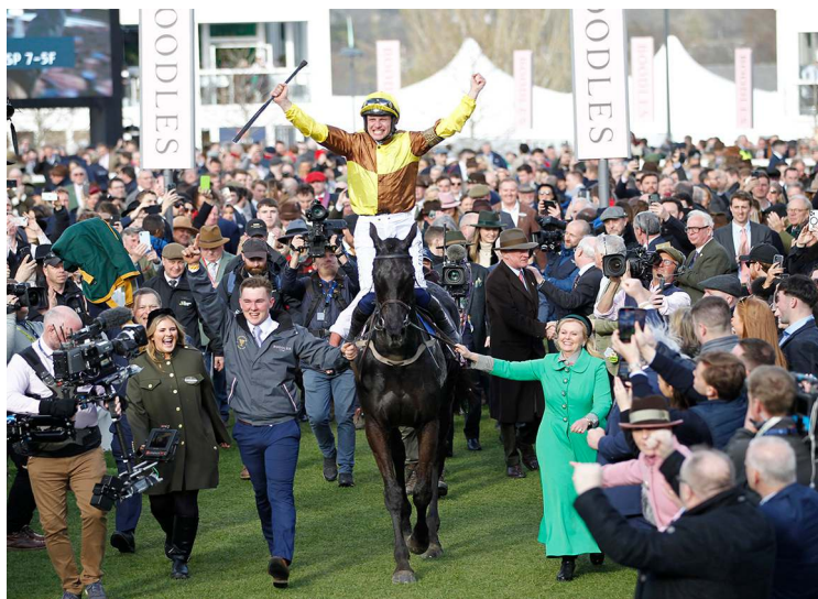
Galopin Des Champs