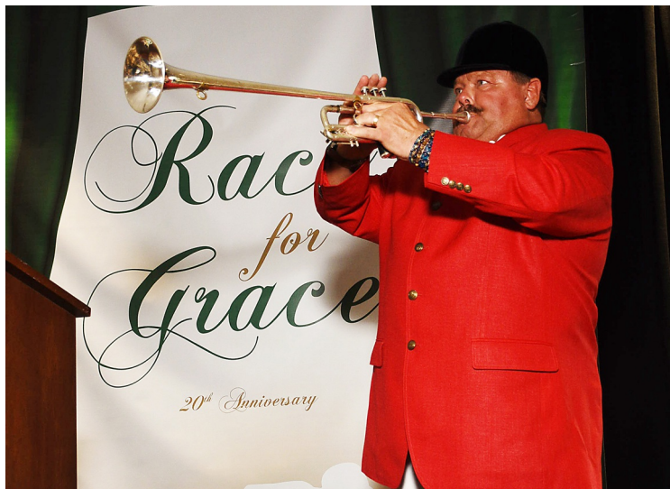
Race For Grace | Kentucky Race Track Chaplaincy

Hall of Fame trainer D. Wayne Lukas will serve as the keynote speaker at this year's 21st annual Race For Grace May 1, which benefits the Kentucky Race Track Chaplaincy.