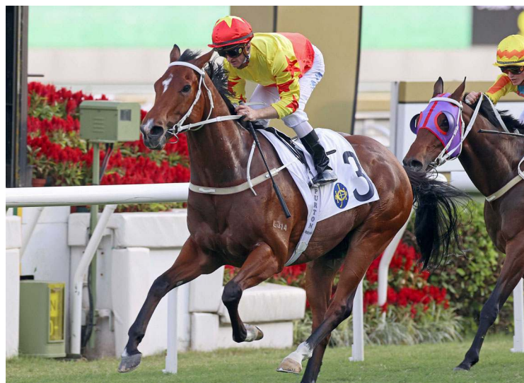
California Spangle | HKJC