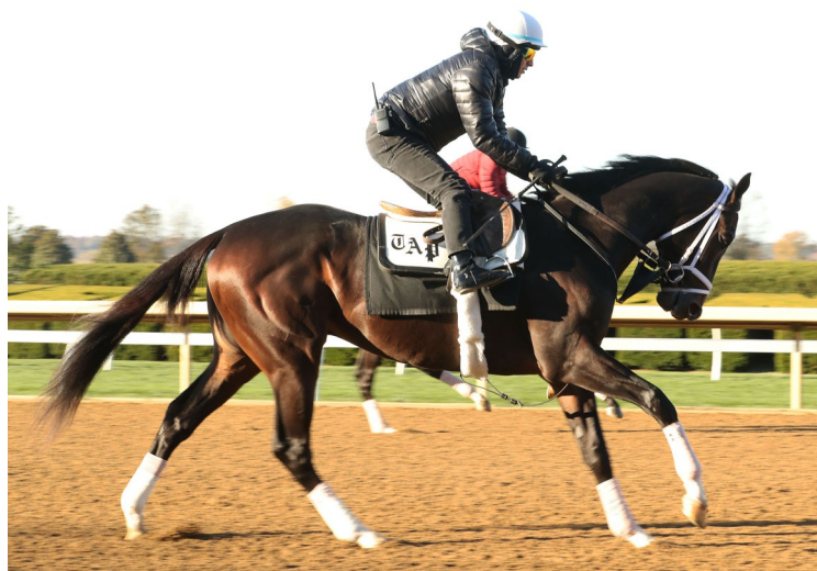
Forte

Repole Stable and St. Elias Stable's 'TDN Rising Star' Forte (Violence) returned to the worktab at Palm Beach Downs Friday in preparation for a scheduled start in the $1-million GI Curlin Florida Derby Apr. 1 at Gulfstream Park.