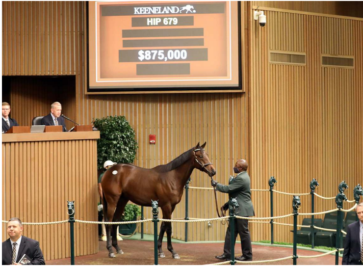
Pursuit of Power sells at Keeneland September