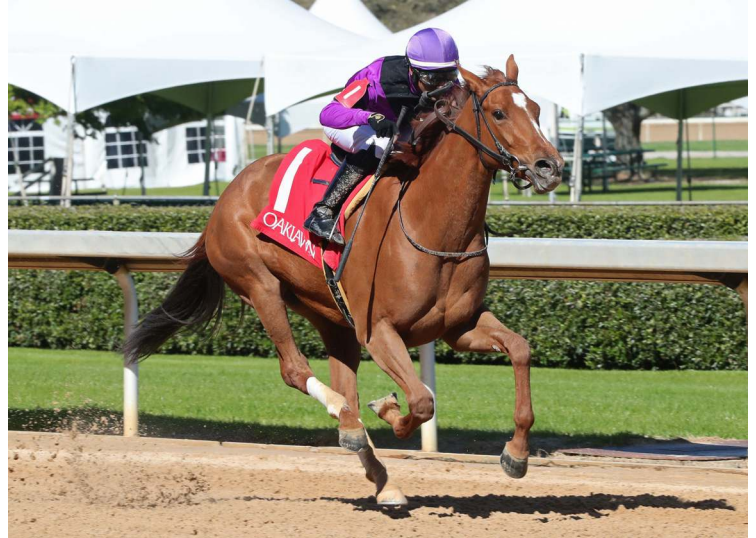
Exponential Star

7th-Oaklawn, $90,000, Msw, 3-17, 3yo, f, 1 1/16m, 1:45.56, ft, 2 1/4 lengths.