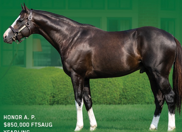
HONOR A. P. $850,000 FTSAUG YEARLING