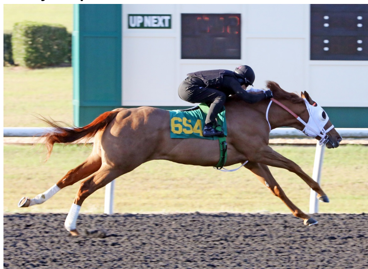
Hip 654