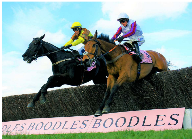
Galopin Des Champs & Bravemansgame

Last year's winner, A Plus Tard (Fr) (Kapgarde {Fr}), representing the resurgent Henry de Bromhead stable, could not match his heroics of 12 months ago, and he too was eased down by Rachael Blackmore as the leaders started to draw away with three left to jump. Most heartbreaking of all was seeing the game Eclipse Award winner Hewick (Ire) (Virtual {GB}) make a bold go from the front after Ahoy Senor's departure, only to fall himself at the second-last fence.