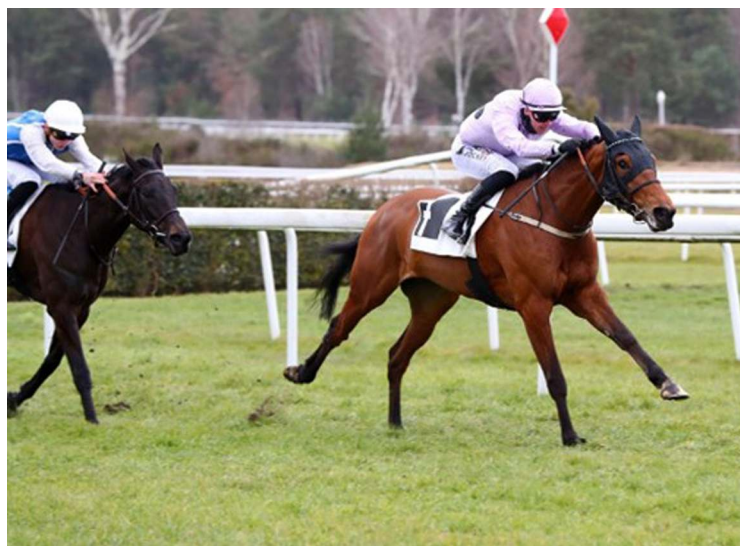
Soleil d'Arizona | Auctav