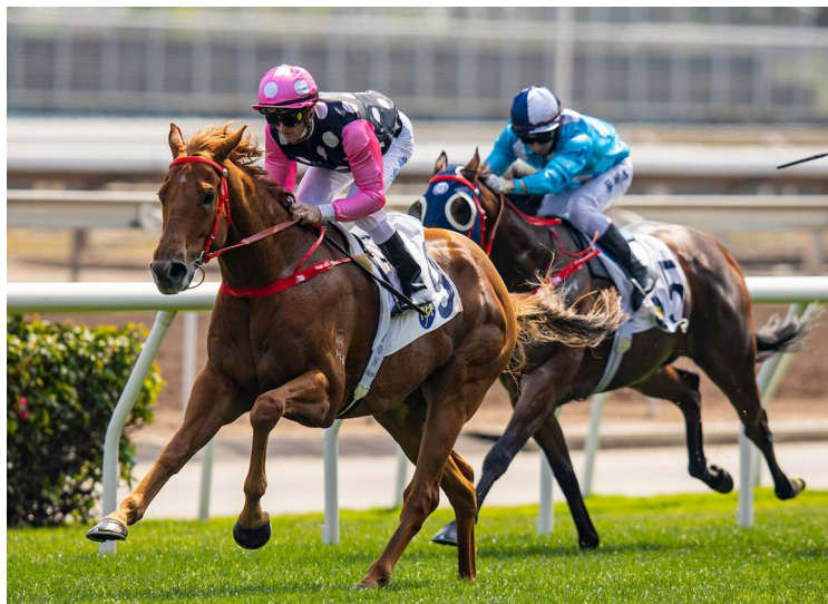
Beauty Eternal has won four of his five starts

Hong Kong's 4-year-old Classic series concludes with the running of the HK$24-million BMW Hong Kong Derby Sunday at Sha Tin Racecourse, and while no one will confuse any of the 14 runners signed on for Horse of the Year Golden Sixty (Aus) (Medaglia d'Oro), who became the second to sweep the series in 2020, or last year's winner Romantic Warrior (Ire) (Acclamation {GB}), who has gone on to multiple Group 1 victories in unrestricted company, it is a race that--in theory--is wide open.