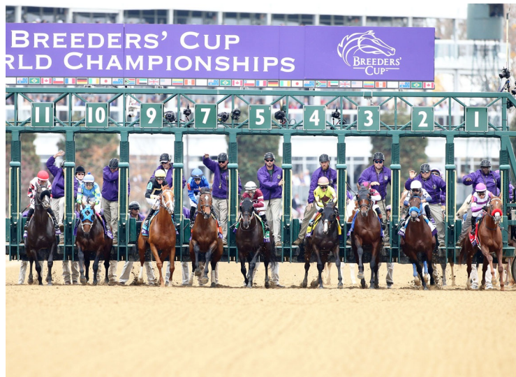
The horses break from the gate in the Dirt Mile

DF: In addition to having the two best days of racing, the Breeders' Cup is a celebration of equestrian life. Like most major sporting events across the globe, it's important to have a festival component so that fans can come and see what a