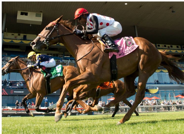
Woodbine Racetrack

Woodbine Entertainment and the Horsemen's Benevolent and Protective Association of Ontario (HBPA) have reached an agreement for a new two-year deal that commits to $62 million in purses for the 2023 and 2024 Thoroughbred racing meets, both released in a statement Friday.