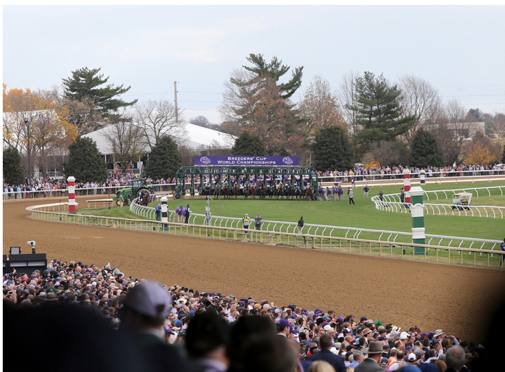
Keeneland Breeders' Cup 2022

Lexington economy by an estimated $17.5 million overall