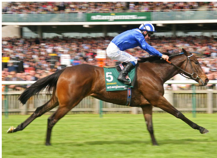
Sarayir's G1 1000 Guineas-winning daughter Ghanaati

Ghanaati would go on to produce G2 Joel S. hero Mutasaabeg (GB) (Invincible Spirit {Ire}) and Wafy (Ire) (Dubawi {Ire}), winner in Dubai of the G3 Mahab Al Shimaal S.