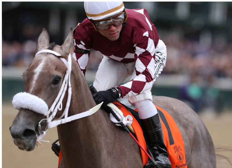
Jaywalk

For this is none other than Jaywalk, whose kinship would generate a stunning yield for Gainesway at Keeneland the following September when they presented Lady Pewitt's daughter by Empire Maker.