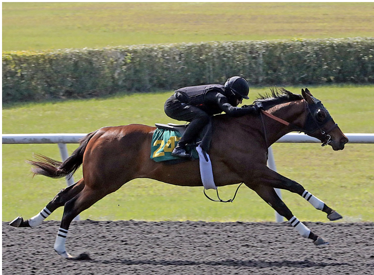
Hip 247