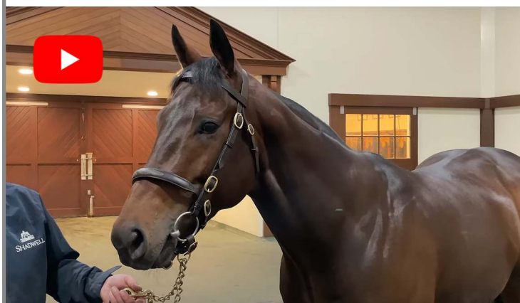
Baaed Proving a Privilege at Nunnery