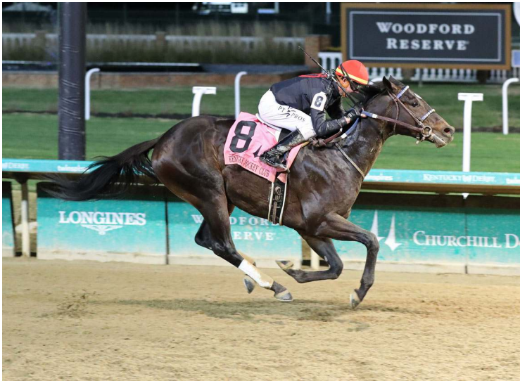
Smile Happy | Coady

8th-OP, $106K, OC 50k/N2X, 4yo/up, 1 1/8m, 5:22 p.m.