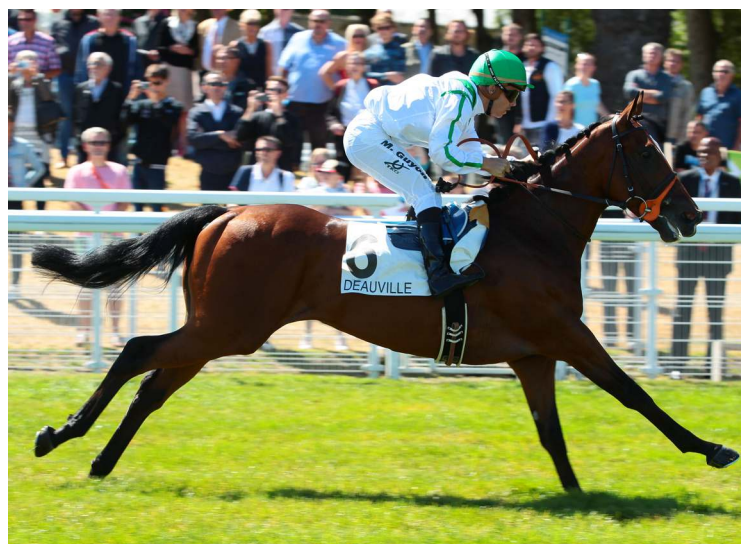
Fas (above) has a runner on Thursday

€10,000 Arqana Deauville September Yearling Sale 2022