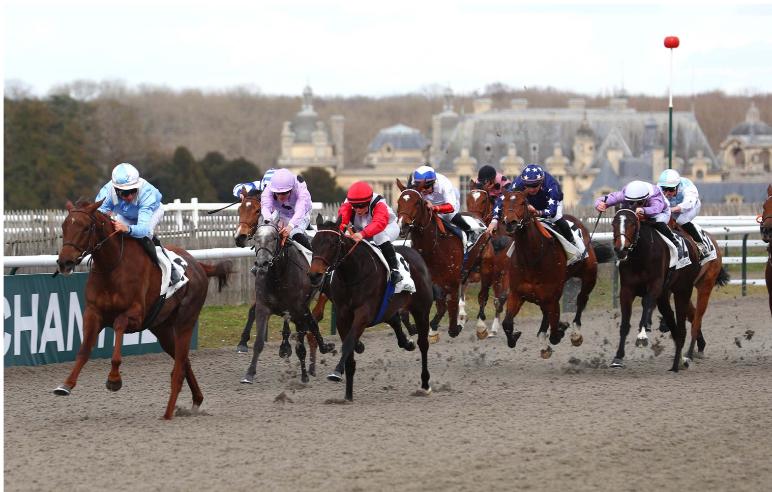
Crown Princesse (Zarak) winning at Chantilly on Wednesday. The filly finished second to TDN Rising Star, and subsequent listed winner, Pensee Du Jour ( Camelot) last month.