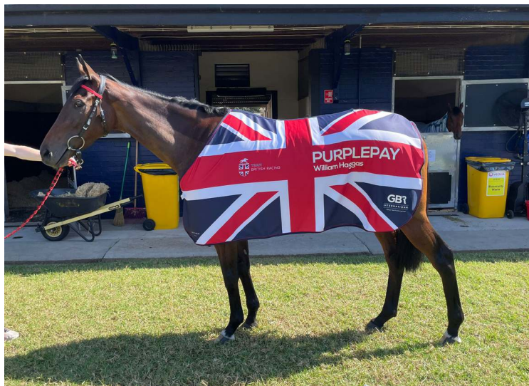
Purplepay | Great British Racing International