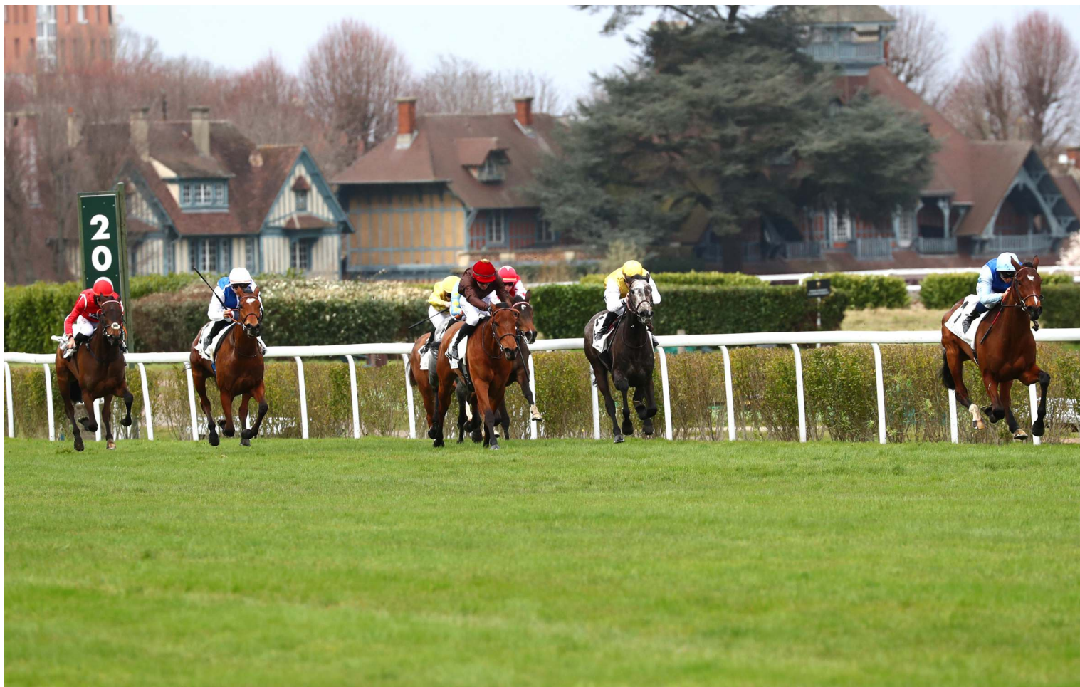
Pensee Du Jour streaks to a seven-length victory at Saint-Cloud on Thursday.