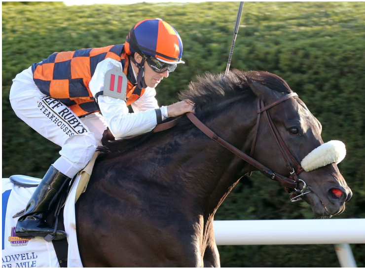
Ivar winning the Shadwell Turf Mile

Ivar (Brz) (Agnes Gold {Jpn}--May Be Now, by Smart Strike), a dual Group 1 winner in Argentina and later winner of the GI Shadwell Turf Mile at Keeneland, has been retired from racing and will enter stud for the upcoming Southern Hemisphere breeding season at Haras Carampangue in Buenos Aires, Argentina. The news was announced jointly on Twitter by Stud RDI and Bonne Chance Farm, who campaigned Ivar in partnership.