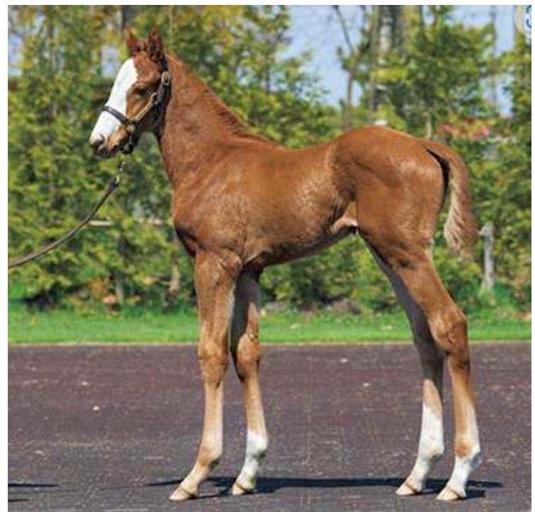
Ange Field as a foal