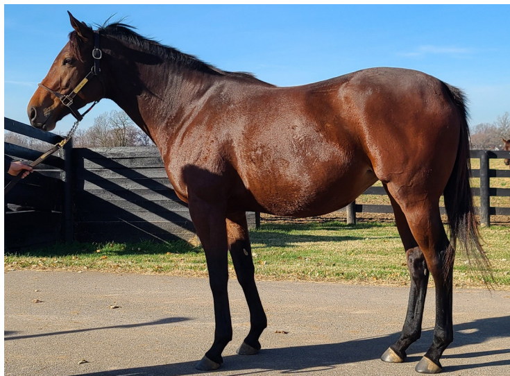
Cedar Hall will visit Woodford-bred Independence Hall in 2023

Woodford bred Independence Hall , sold him as a yearling, bought back into him during his race career and now owns a considerable number of shares in the horse, which means we will support him. His first crop of foals are hitting the ground now and from photos we have seen, they look to be very racey individuals.