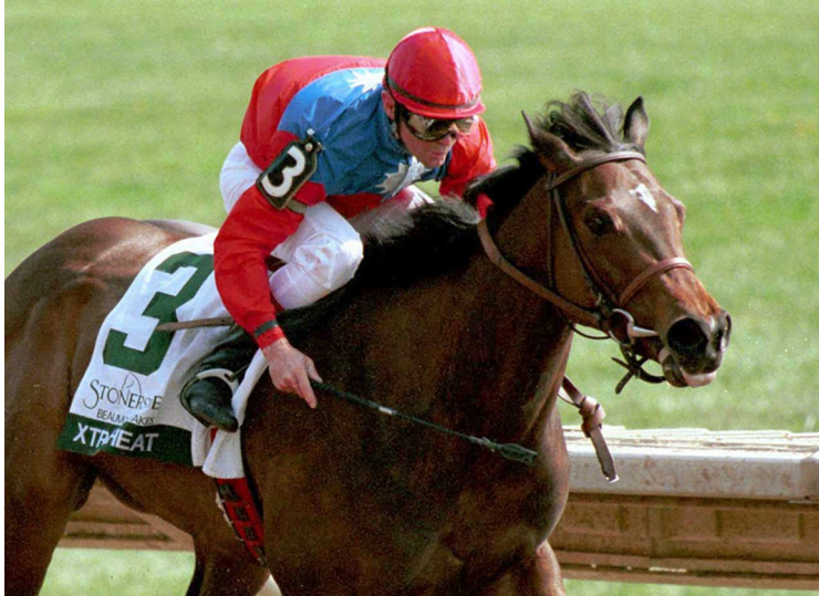
Xtra Heat