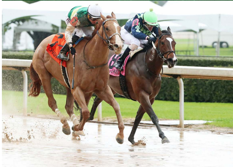
Gunning | Coady

7th-Oaklawn, $103,000, Alw (NW2L)/Opt. Clm ($100,000), 3-9, 3yo, 1 1/16m, 1:45.38, sy, 1 1/2 lengths.