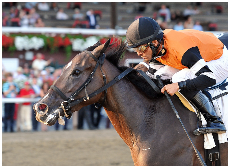
MGSW Lucy N Ethel will visit Life Is Good

We're excited to be breeding to Life Is Good . His speed was his weapon and he was much the best when winning the GI Breeders' Cup Dirt Mile as a 3-year-old. He continued his winning ways with three Grade I races at four.