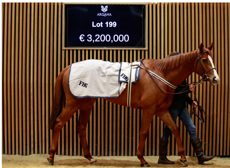
Malavath sold to Moyglare in December