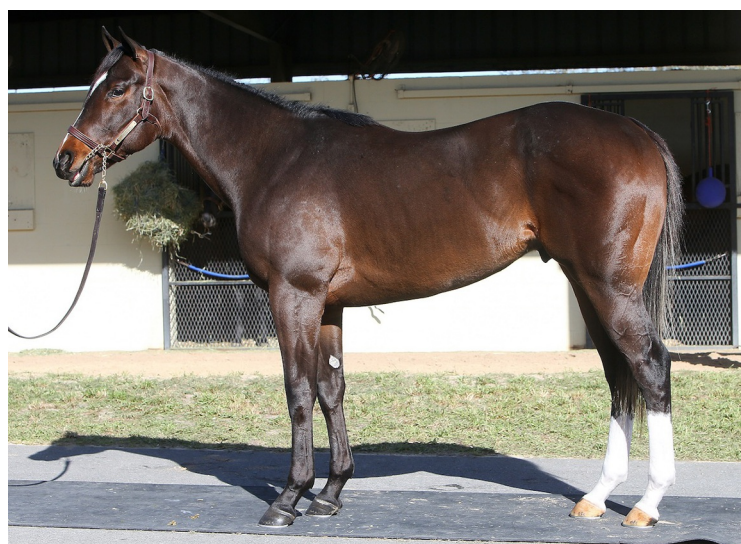
Raise Cain's year-old full-brother as a 2-year-old | ThoroStride