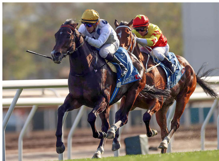
Golden Sixty | HKJC