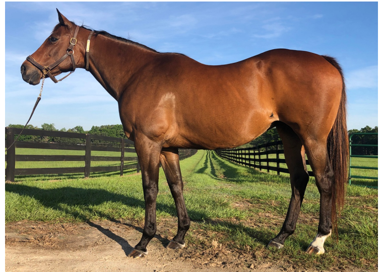
Xtra Heat

Xtra Heat (Dixieland Heat--Begin, by Hatchet Man), winner of 25 black-type races in an overachieving career that saw her named the Eclipse Award-winning 3-year-old filly of 2001, passed away last December at the age of 24, according to a release from Woodford Thoroughbreds.