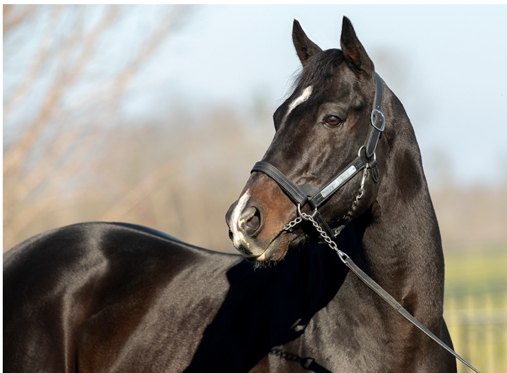
Violence

but when he said how about finding some Thoroughbred mares, I thought he was crazy." Cont.