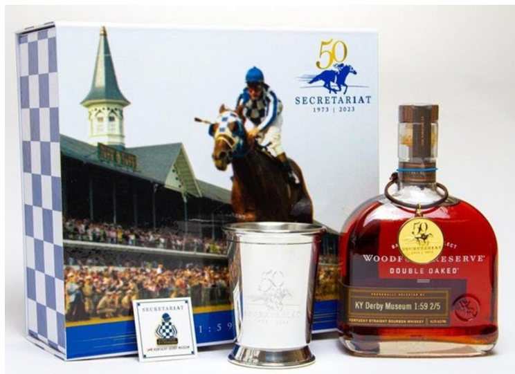
Kentucky Derby Museum

The tickets are on sale for the Apr. 20 Kentucky Derby Museum's Secretariat Bourbon Dinner, presented by Fifth Third Bank. Guests at this launch party will have several opportunities, including being the first to explore the new exhibit, Secretariat: America's Horse , before it opens to the public Apr. 21.