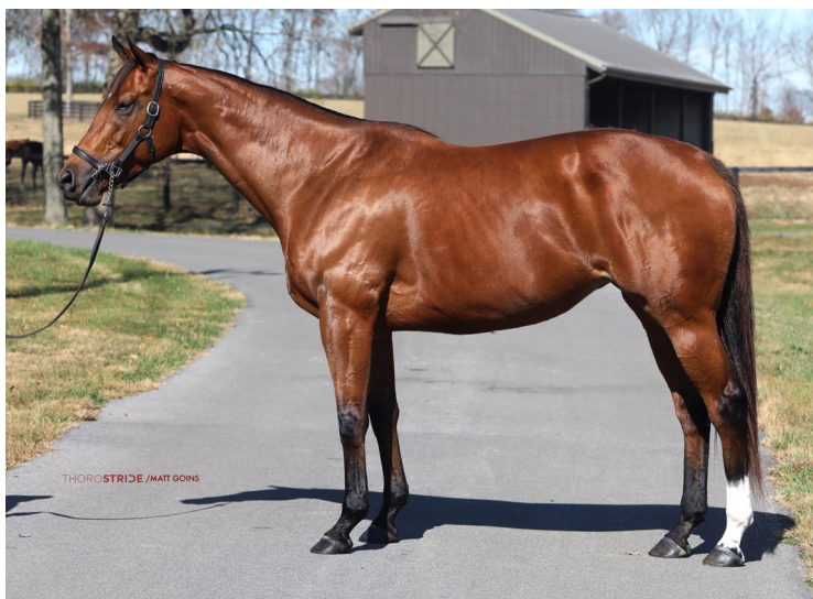
Graded stakes-placed Message will visit Flightline in 2023

You can't look at this mare without the thought "pretty" crossing your mind. She's a beautiful mare that won the GIII Delaware Oaks as a 3-year-old and the Parx Juvenile Fillies S. as a 2-year-old. We love that she had speed and class early on.