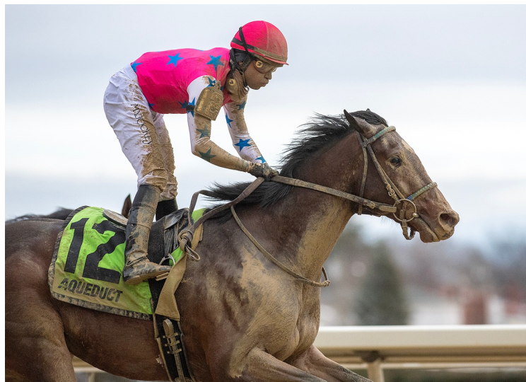
Raise Cain's 7 1/2-length Gotham win last Saturday

"Raise Cain hadn't run a bad race yet: some better than others, but he'd shown the potential to run respectably. But to see him run a monster race like that was a total surprise, and had us all just extremely proud to even be associated with him. And we're very, very hopeful he'll go on from here."