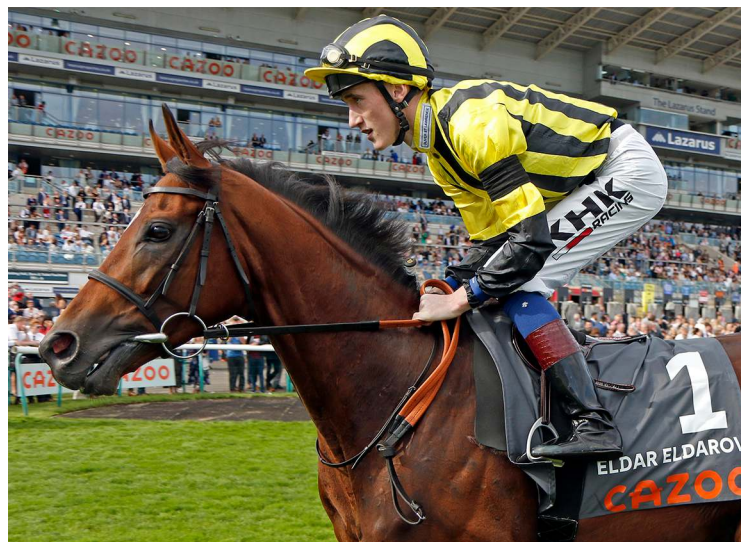
2022 St Leger hero Eldar Eldarov

I don't want any races shortened. If anything, I'd like to see some lengthened. This is especially pertinent in the US where many 'Classic' filly and mare races are shorter even than their male counterparts. I'd love to see both the Kentucky Oaks and Breeders' Cup Distaff (just to name two) go back to being 1 1/4[-mile] races. Cont. p7