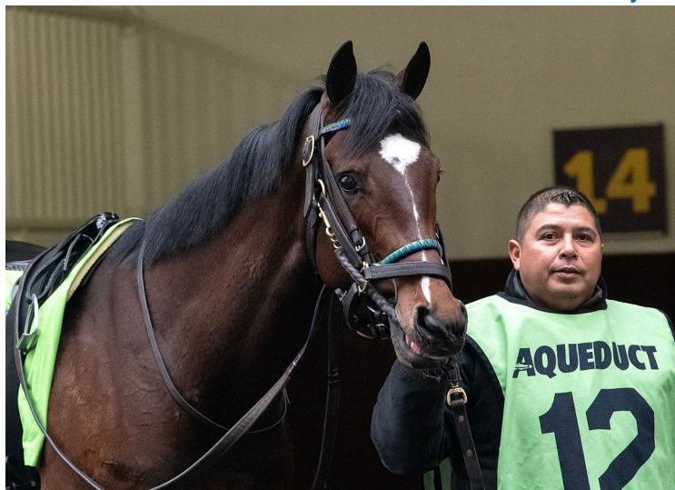
Raise Cain