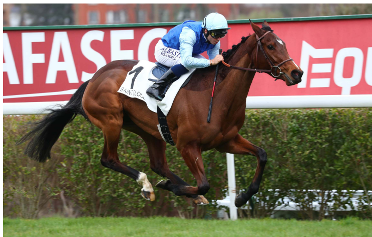
Pensee Du Jour

Ballymore Thoroughbred Racing's undefeated 3-year-old filly Pensee Du Jour (Ire) ( Camelot {GB} --Painter's Pride {Fr}, by Dansili {GB}) delivered a spectacular winning debut last month, attaining 'TDN Rising Star' status with a four-length tally atop Chantilly's all-weather surface, and made a smooth transition into black-type company with an impressive pillar-to-post victory on the turf in Thursday's Listed Prix Rose de Mai at Saint-Cloud. The 1-2 favourite broke smartly and held sway throughout the 10-furlong contest. Unflustered and dominating into the straight, she was allowed an inch of rein soon after passing the quarter-mile marker and lengthened clear in effortless style in the latter stages to easily outclass toiling rivals by daylight. At the line, she was seven lengths too good for the overmatched Olkovskha (Fr) (Zelzal {Fr}), herself three lengths clear of Cracksmania (GB) (Cracksman {GB}).