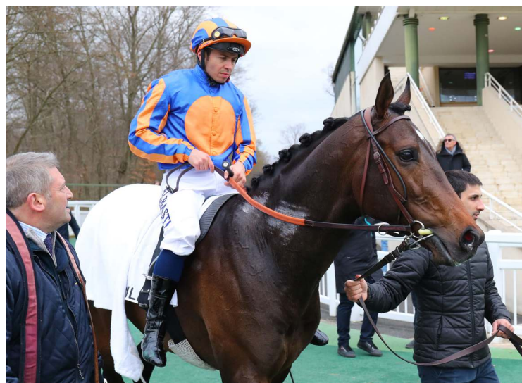
Ancient Rome is led back to the scales | Scoop Dyga

2nd-Chantilly, €27,000, Mdn, 3-7, unraced 3yo, c/g, 8f (AWT), 1:40.13, st.