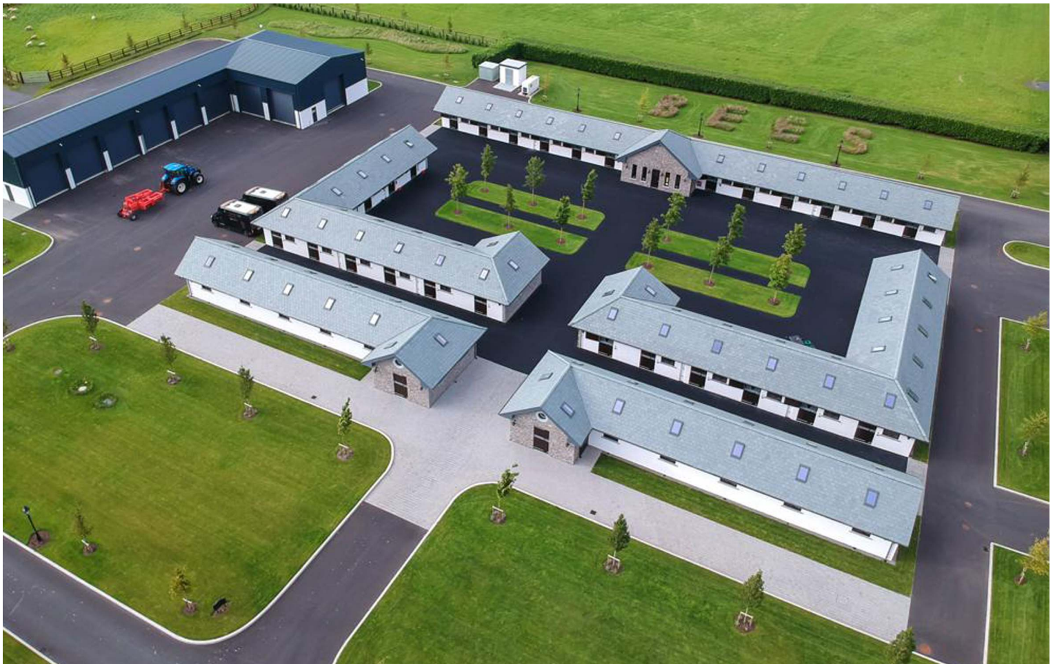
Meadow Court Stud from the air | Al Shira'aa