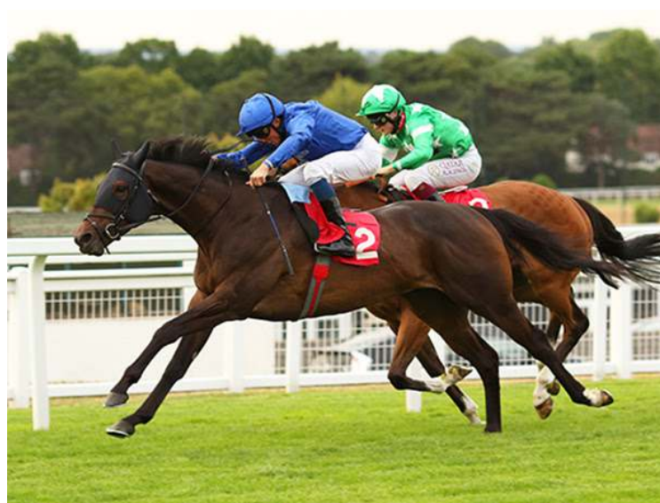
Cosmic Desert has been entered in the March Sale | Tattersalls Ascot