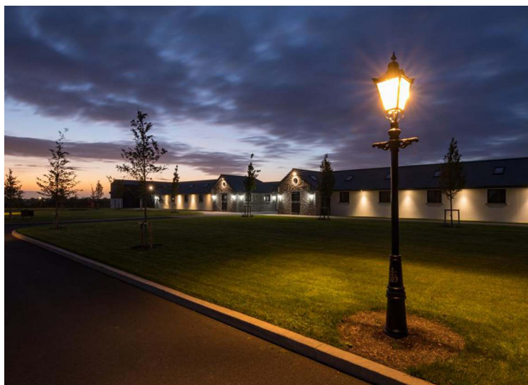
Meadow Court Stud | Al Shira'aa