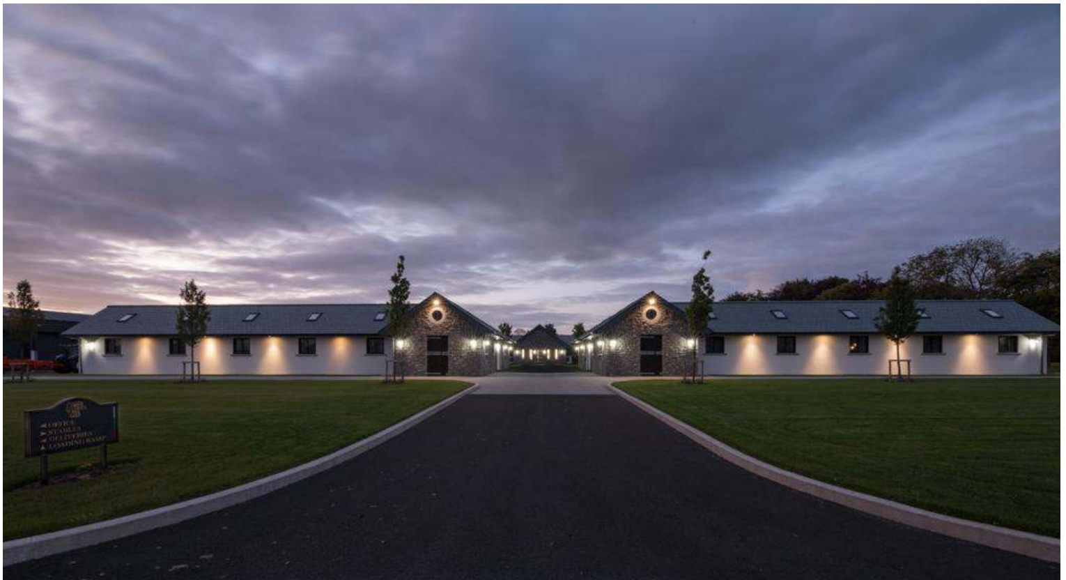
Part of the Meadow Court Stud complex | Al Shira'aa