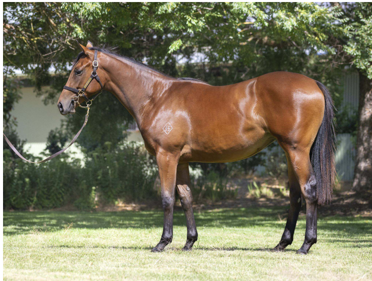
A filly by Pierro