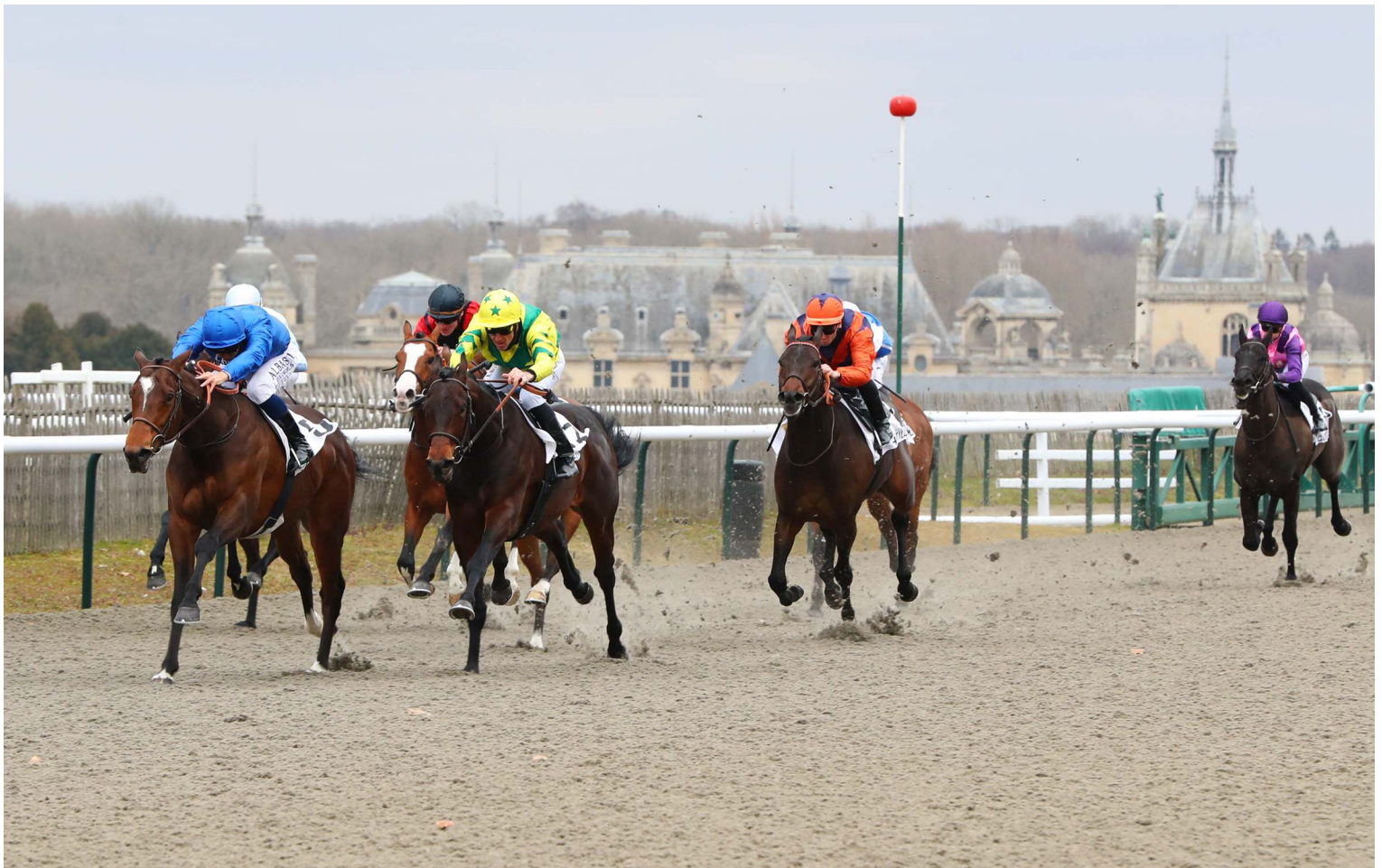
Godolphin's Swing Vote, out of Oaks winner Qualify, graduated at first asking on Tuesday.