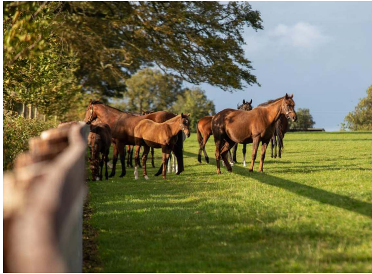
Mares and foals at ease | Al Shira'aa