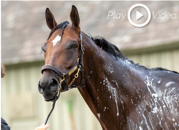
Keepmeinmind