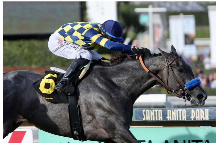
Fun to Dream