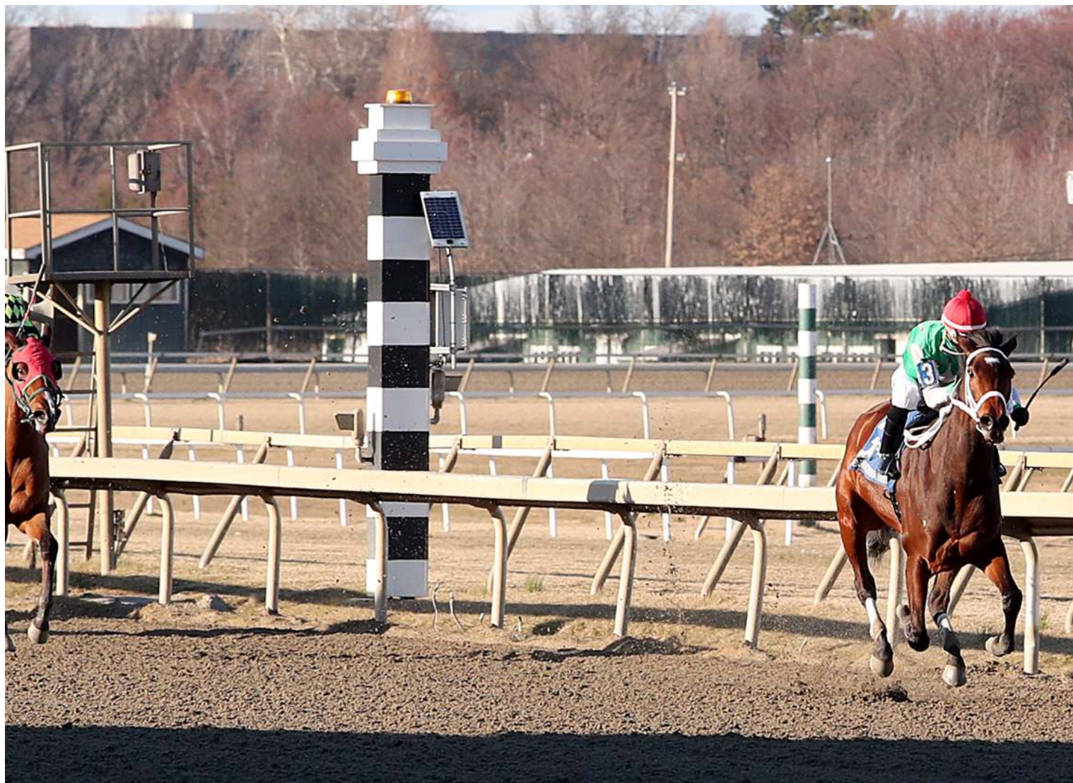
Disco Ebo romps in Penn's Landing S.

Wilburn , Red River Witch, f, 3, o/o Foreign Sultress, by Foreign Policy. MSW, 3-7, Will Rogers