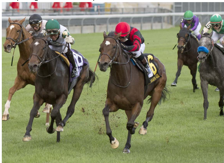
Mutamakina (red cap) became the first top-level winner for the operation

He adds of Sheikha Fatima, "She's very passionate about all breeds of horses. She was very successful at show jumping and dressage herself, and she has a big show jumping team competing all around Europe and the UAE."