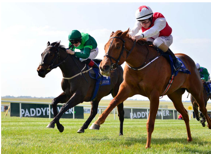
Ocean Quest