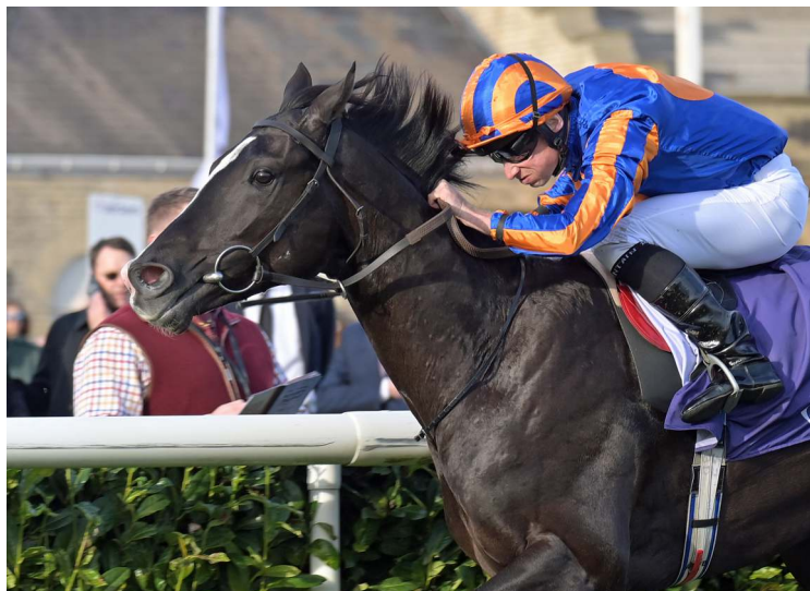
Auguste Rodin