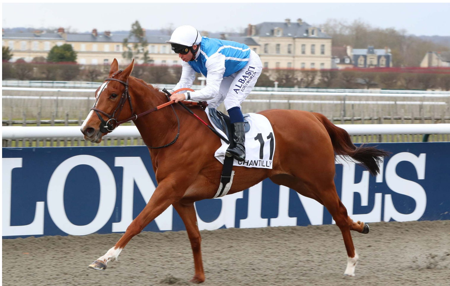
Algolia is the 10th 'TDN Rising Star' for her Ballylinch Stud-based sire.

Of the 83, 45 are trained in Ireland and of that number, 29 are trained by Ballydoyle supremo Aidan O'Brien for various Coolmore partnerships. Cont. p11