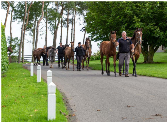
Mares and foals at Meadow Court Stud | Al Shira'aa

Half-sisters to Classic winners Mother Earth (Ire) (Zoffany {Ire}) and Poetic Flare (Ire) ( Dawn Approach {Ire} ), and to Arc winner Waldgeist (GB) (Galileo {Ire}) were recruited in 2021. The first of that