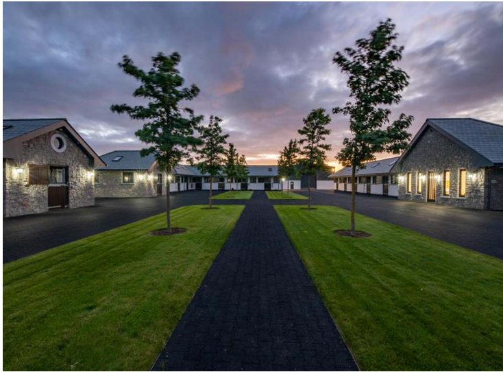
Meadow Court Stud | Al Shira'aa