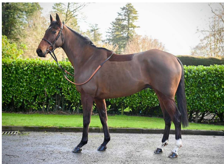
Mikimoto | ThoroughBid