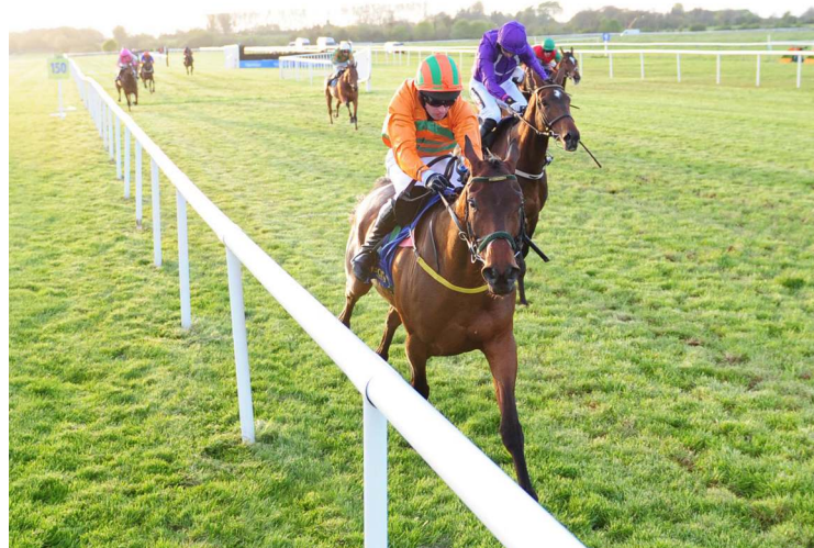
Point-to-pointers competing in a National Hunt flat race

Currently, winning British and Irish point-to-point performers are classified as runners, but not as winners in either the subject horse detail or the dam summary line. For all National Hunt sales from April 2023 onwards, if the progeny of a dam has won a point-to-point in Great Britain or Ireland but the same animal has not won under rules the point-to-point only, winner(s) will be referenced as point-to-point only winners in the dam summary line and/or produce summary.