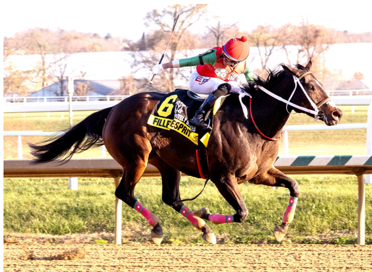
Maryland-bred Horse of the Year Fille d'Esprit