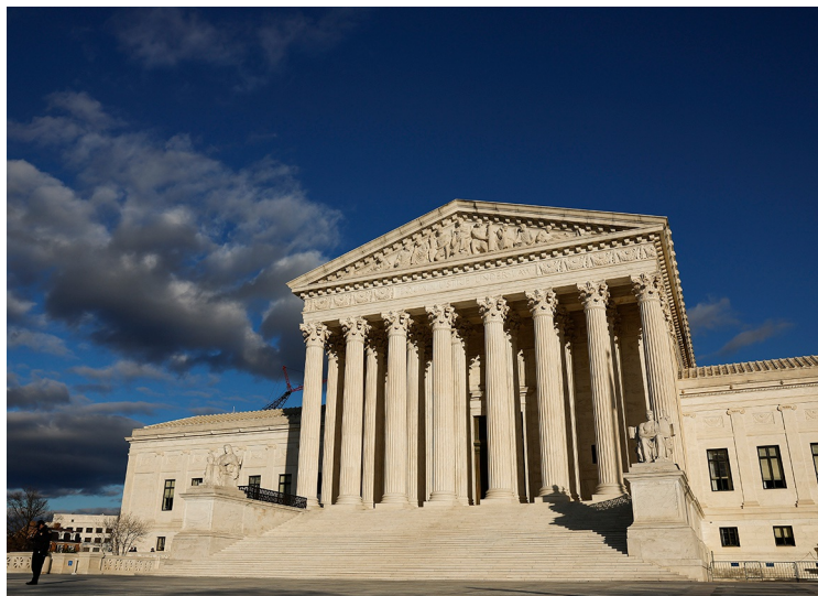
Supreme Court battle may be next for HISA