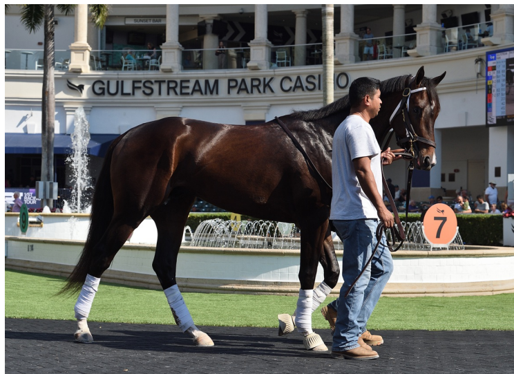
Champion Forte schooling at Gulfstream earlier this week