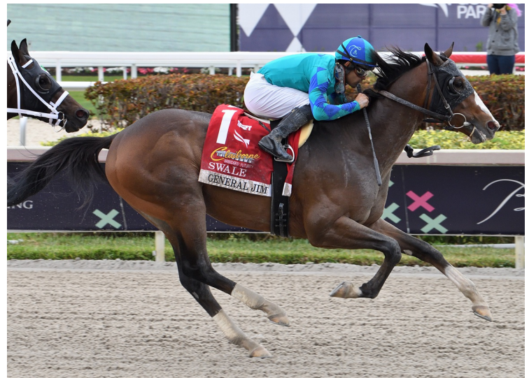
General Jim