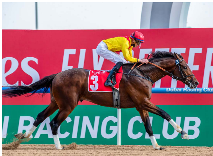
Bendoog | Dubai Racing Club