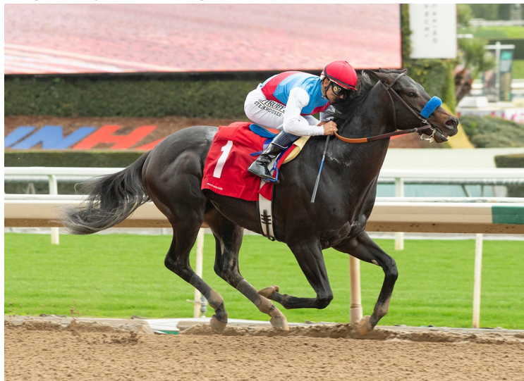
Hejazi, a $3.55-million son of Bernardini, takes the next step toward the Kentucky Derby in the GII San Felipe S.