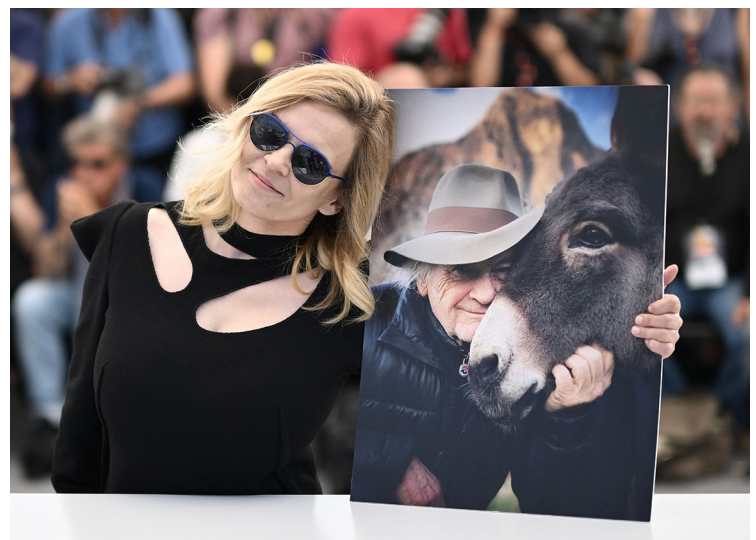
Producer Ewa Piaskowska holds a photo of director Jerzy Skolimowski and his donkey from the film EO at the Cannes Film Festival

Interestingly, for our community, he spends an early chapter of his career in a stable housing expensive, lovingly groomed sport horses (whose beauty, by the way, is captured in haunting fashion). Cont.