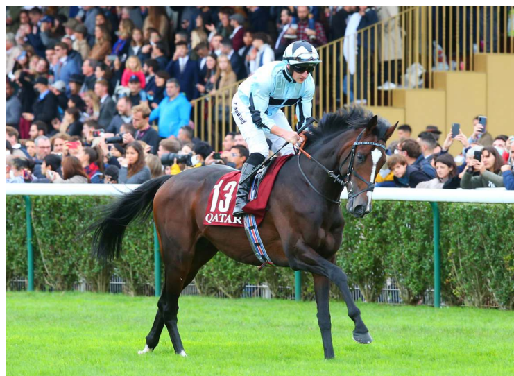
Alenquer