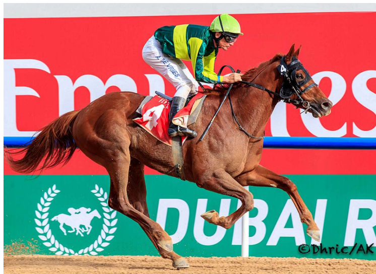
Desert Wisdom

"Desert Wisdom hasn't been the same horse as last year," he said. "Last time he was ridden quite positively after a bad start and when I rode him first time out he didn't get a good run as well."