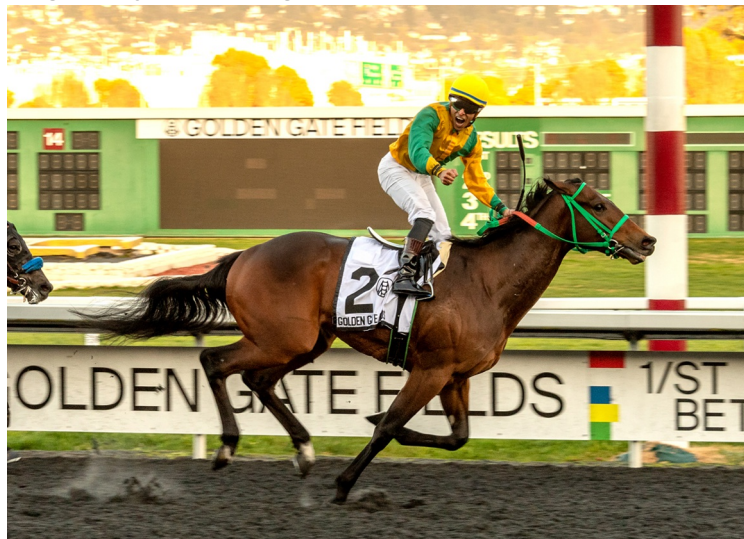
Chase the Chaos gets his first stakes win in the El Camino Real Derby