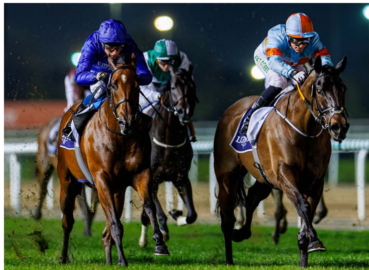
Coachello (right)