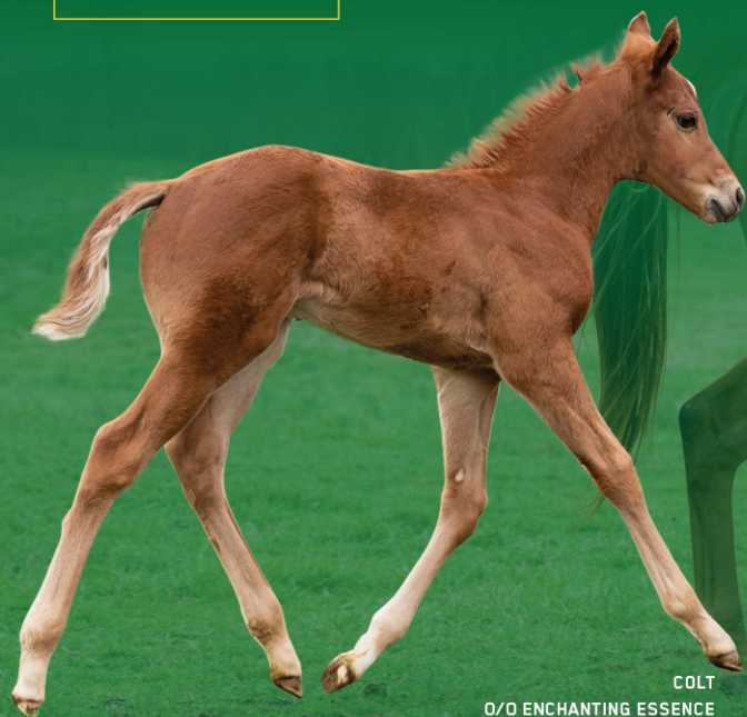
COLT O/O ENCHANTING ESSENCE