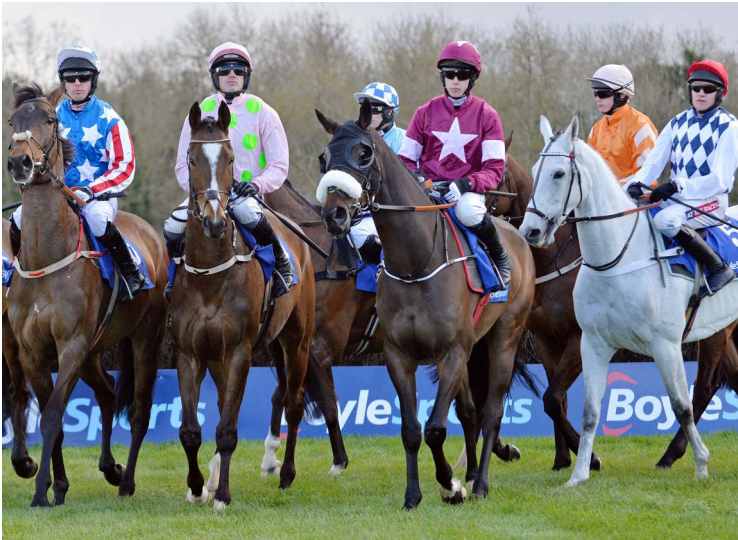
Mental fitness and resilience are very important to a jockey's health