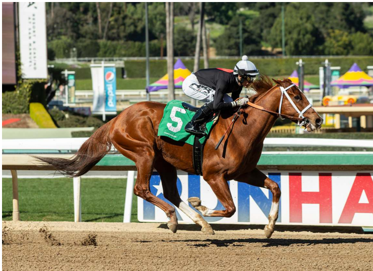
The Chosen Vron

The ultra-consistent The Chosen Vron made easy work of the four-horse field to record his fifth straight stakes victory in the Tiznow s. at Santa Anita Monday. The chestnut gelding charged out to the early lead and was under a snug hold through a quarter in :23.60. Leyas Candy was a constant presence just to the outside of the heavy favorite through a half in :47.15, but The Chosen Vron never looked to be bothered and shrugged off that foe at the top of the lane before bounding clear to the wire.