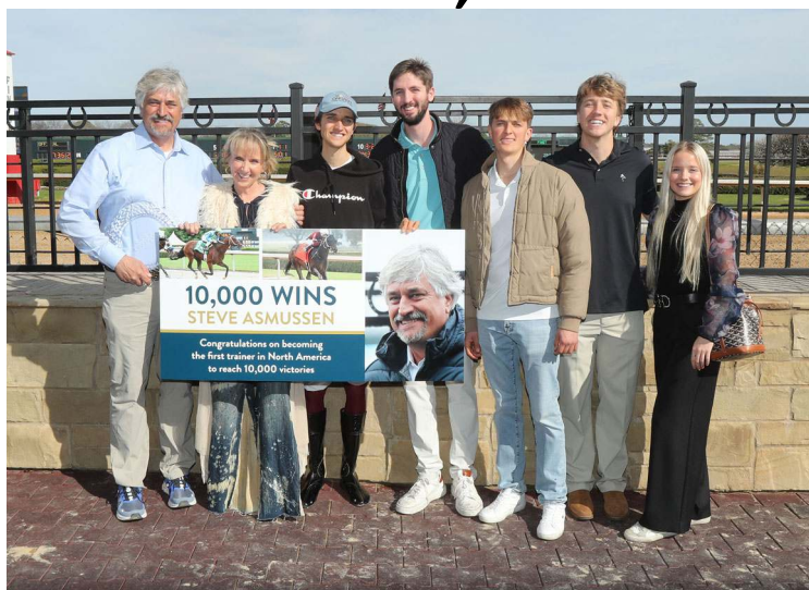
Steve Asmussen celebrates win 10,000