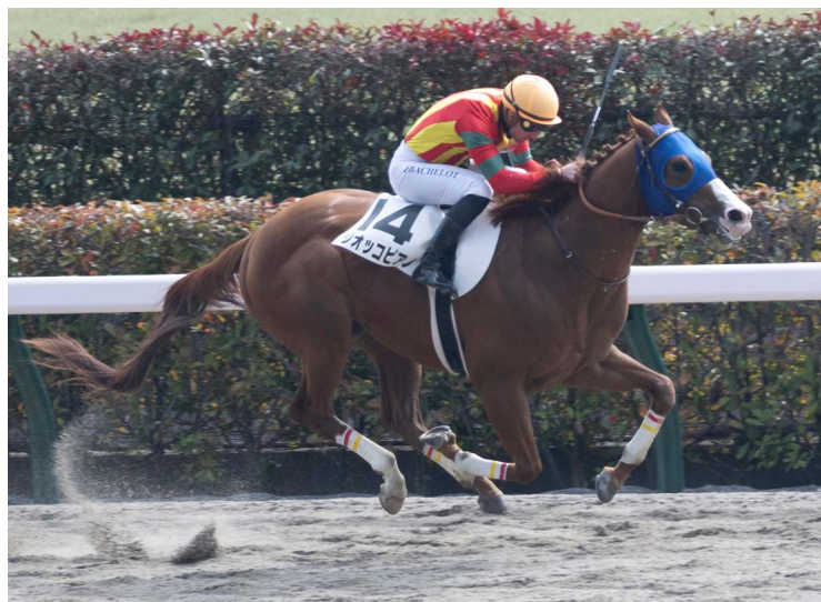
Giuoco Piano

CAN'T WAIT TO GET YOUR TDN BREAKING NEWS AND RACE RESULTS?