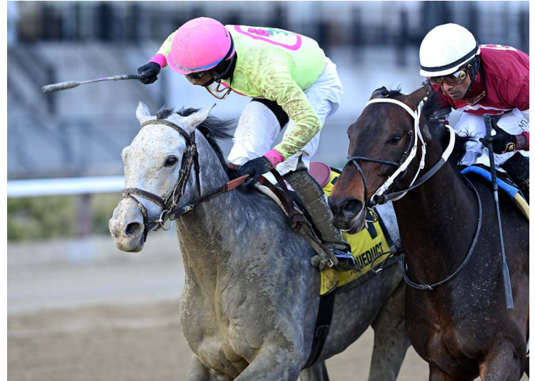
Dr Ardito outbattles Bankit