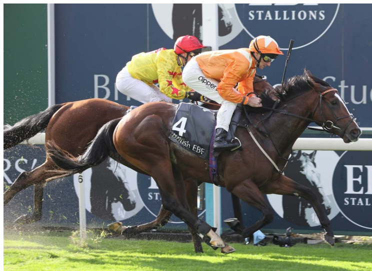
Streets of Gold

“This is in addition to our long-standing commitments to our high-value fillies’ and mares’ handicaps, designed to retain mares in GB and give them productive targets throughout the season, and of course, our flagship British EBF £100,000 2yo Series finals founded last year.”