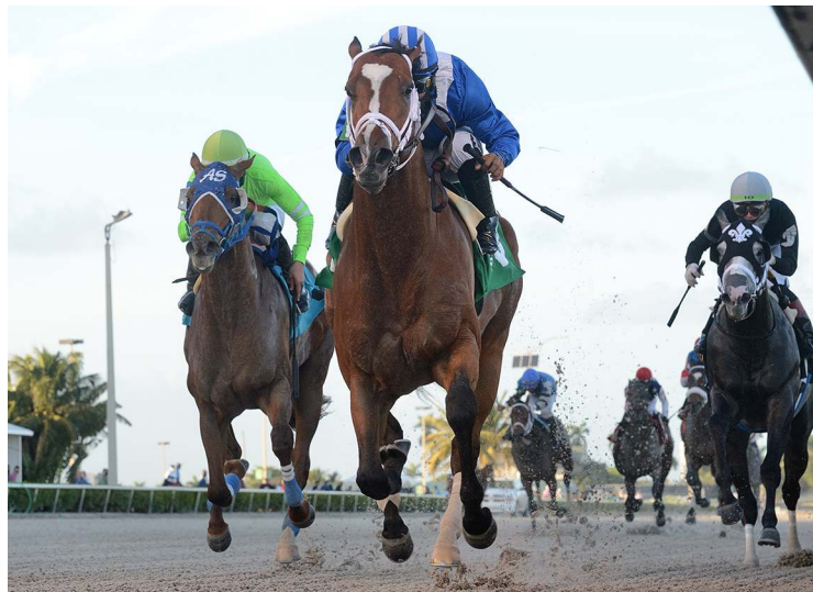
Mutasaabeq

Tabbed a 'TDN Rising Star' following his debut win at Saratoga in 2020, Mutasaabeq was third in the GI Runhappy Hopeful S. in his second career outing before winning the GII Bourbon S. over the turf at Keeneland for Shadwell Stable and trainer Todd Pletcher. He added a win in the Mucho Macho Man S. in his lone start at three.