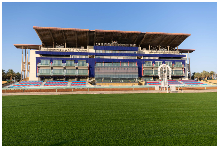
King Abdulaziz Racetrack | The Saudi Cup