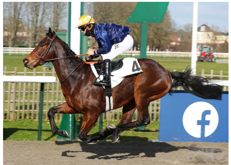
Mr Moliere | ScoopDyga