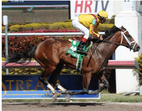
Dreaming of Julia

Stonestreet Stable's Dreaming of Julia (A.P. Indy), an eye-popping winner of the Mar. 30 GII Gulfstream Oaks, headed Todd Pletcher's team of mavens who were sent out for a spin Sunday morning at Churchill as they march toward the May 3 GI Kentucky Oaks.