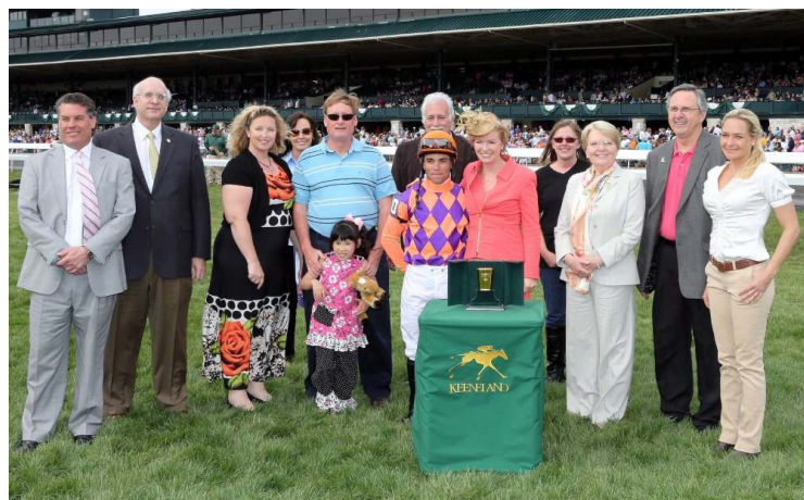
Ciao Bella Luna's winning connections