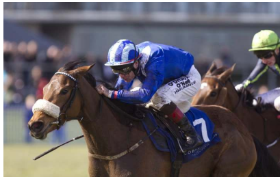
Rawaaq (GB)

Rawaaq began her career with a taking defeat of Leitir Mor (Ire) (Holy Roman Emperor {Ire}), with Afonso de Sousa (Henrythenavigator) and George Vancouver