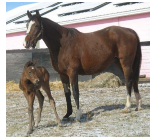
Honorias with her 2013 Lemon Drop Kid filly

7th-AQU, $65,000, Msw, 3yo/up, f/m, 1m, 1:38 2/5, ft.