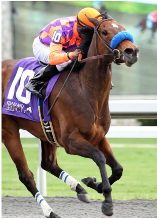
Ciao Bella Luna

In front of a crowd of 18,325, Ciao Bella Luna (Tribal Rule) came from off the pace to annex the 28th running of the GII Beaumont S. at Keeneland Sunday afternoon.