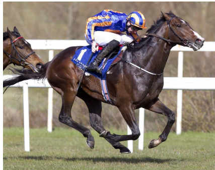
Battle of Marengo (Ire)

Lagging just one behind the record of seven renewals of this significant Derby pointer held by trainer Jim Bolger prior to this running, Aidan O'Brien equaled that tally courtesy of a game performance by Battle of