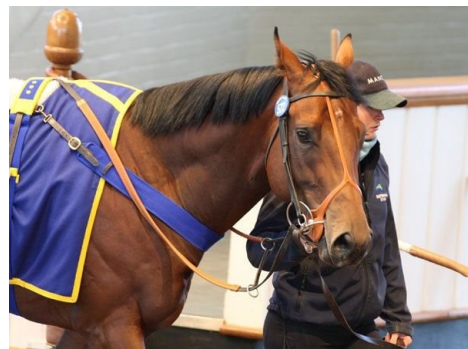
The 370,000gns Invincible Warrior

The strong trade for form horses continued in Newmarket on Tuesday at the Tattersalls Autumn Horses-in-Training Sale, with another 6,734,800gns changing hands for 248 lots, bringing an impressive clearance rate of 91%. The median was up again to 14,000gns (+17%), as was the average at 27,156gns (+8%).