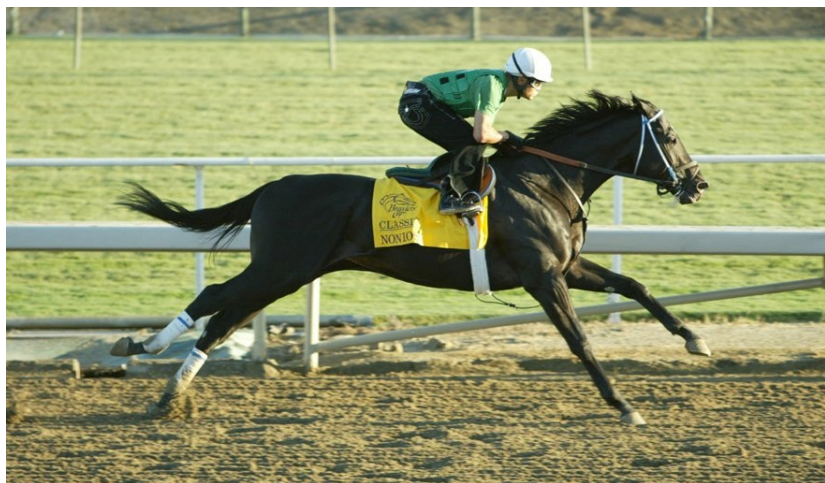
BC Classic prospect Nonios (Pleasantly Perfect) breezing a bullet 5f in :46 2/5 at Santa Anita Tuesday