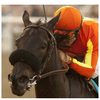
Teddy's Promise