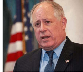
Illinois Gov. Pat Quinn

GOV. NEXT Illinois moved one step closer to expanded gaming at its racetracks Tuesday after the state Senate joined the House in approving a bill that permits a broad expansion of gambling in the state, but there are still doubts about whether Gov. Pat Quinn will sign off on the bill. Yesterday, Quinn called the legislation 'excessive,' saying that while he would support the creation of a casino in Chicago, he questioned the portions of the bill that allowed for four other casinos to be built in Illinois and for slot machines at racetracks and, possibly, Chicago's two airports. "I have told the legislators over and over again the people of