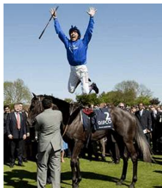
Frankie Dettori catching air after 1000 Guineas Newmarket photo

Godolphin's G1 1000 Guineas winner Blue Bunting (Dynaformer) heads the baker's dozen remaining in tomorrow's G1 Investec Oaks at Epsom, and connections are expecting a bold show as she bids to emulate the operation's 2002 Guineas and Oaks heroine Kazzia (Ger) (Zinaad {GB}). "We've got to be very hopeful--she hasn't done a great deal as she was very fit for Newmarket, but her work has been very nice