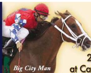
Big City Man

A Taylor Made / WinStar Venture Standing at Taylor Made • (859) 885-3345 www.taylormadestallions.com