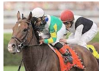
King's Drama

The GII San Gabriel H. ushered in 2006 when Badge of Silver captured the New Year's Day contest, and the year will end the same way, albeit with a different winner. Making his first start since June is the field's lone Grade I winner King's Drama (Ire) (King's Theatre {Ire}), who has had his greatest success at marathon distances. The six-year-old captured the 12-furlong GII San Luis Rey H. Mar. 25 before running second to Lava Man in the 10-furlong GI Charles Whittingham Memorial H. June 10 in his most recent trip postward. This