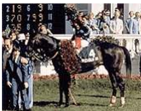
The 1979 Kentucky Derby winner's circle