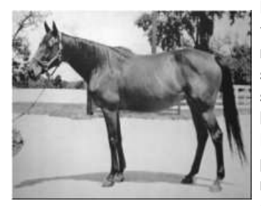
La Troienne

Latent Heat and Wait a While are both by Maria's Mon out of mares by sons of Seattle Slew, and Maria's