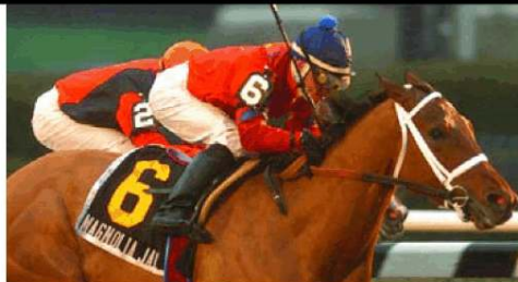
GSW MAGNOLIA JACKSON, one of five 2006 SWs by CAPE CANAVERAL

- Bill Oppenheim on "Value Sires" Thoroughbred Daily News, 12/20/06