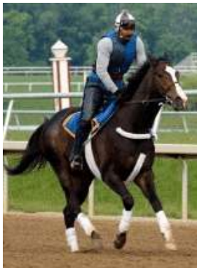
Sweetnorthernst