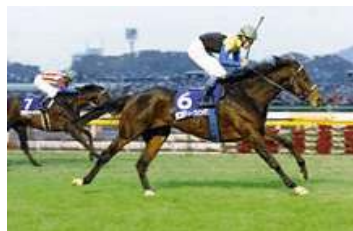
Deep Impact beats Dream Passport in the Japan Cup

Over 150,000 are expected to flock to Nakayama Racecourse for this afternoon's Arima Kinen, which marks the final career start for Deep Impact (Jpn) (Sunday Silence) before he heads off to stud. The 2005 Japanese Triple Crown winner entered this event a year ago undefeated and the heavy chalk to stay that way,