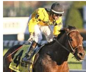
Premium Tap at Churchill