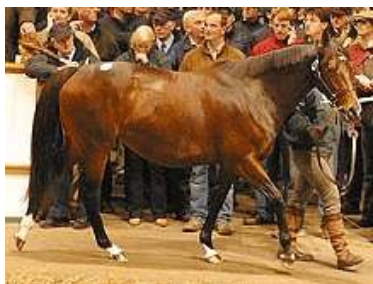
Magical Romance at Tatts

Four-year-old Magical Romance (Ire) (Barathea {Ire}), purchased for a world-record 4.6-million guineas from the Elms Stud draft at Tattersalls December four weeks ago, foaled a Pivotal (GB) filly Wednesday morning at